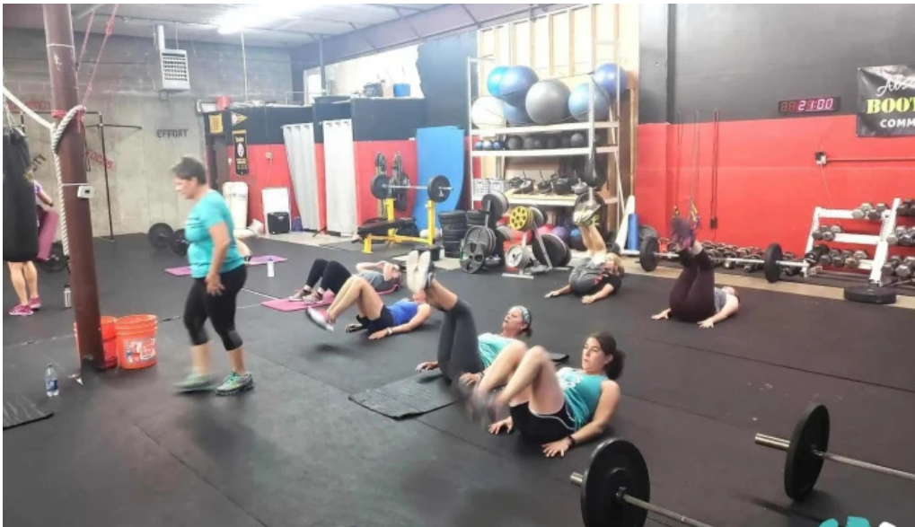
Ntense fitness all