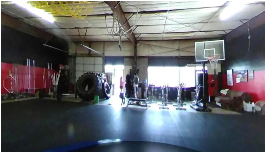
Ntense fitness street view 360deg