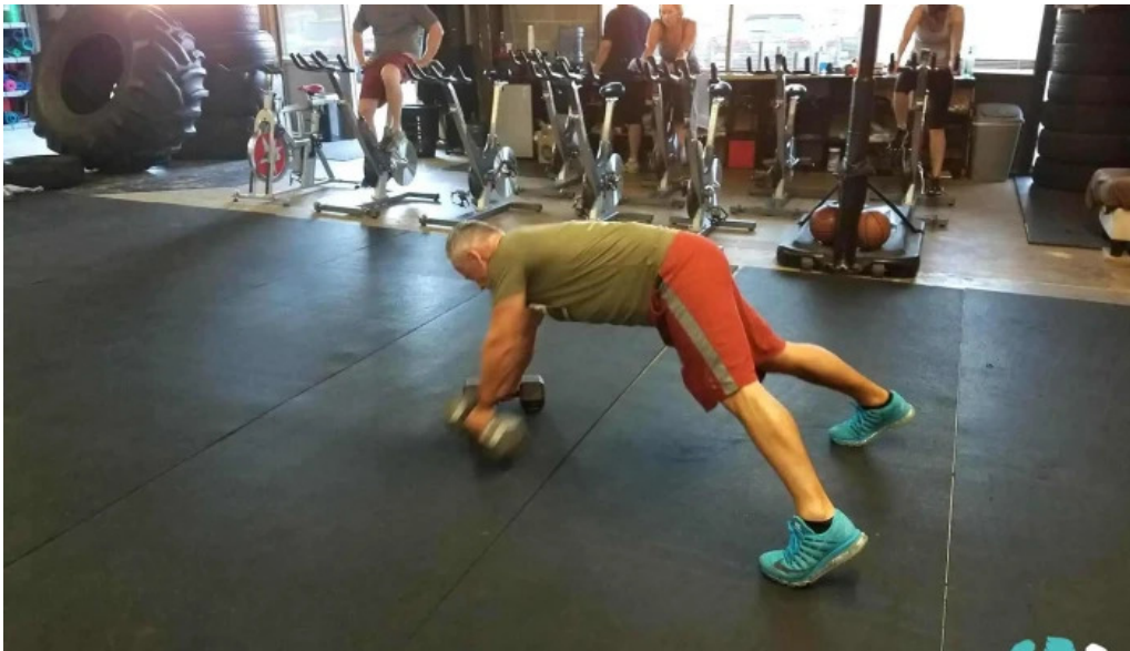
Ntense fitness gym