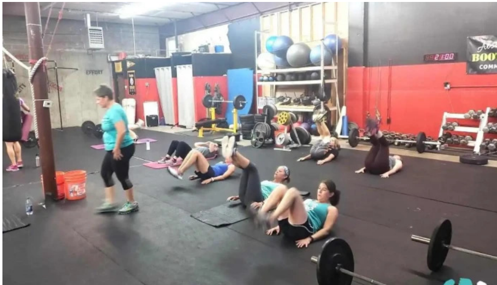
N tense fitness littleton