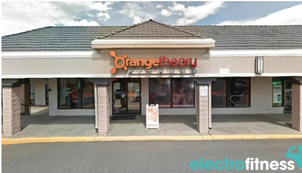
Orangetheory fitness by owner