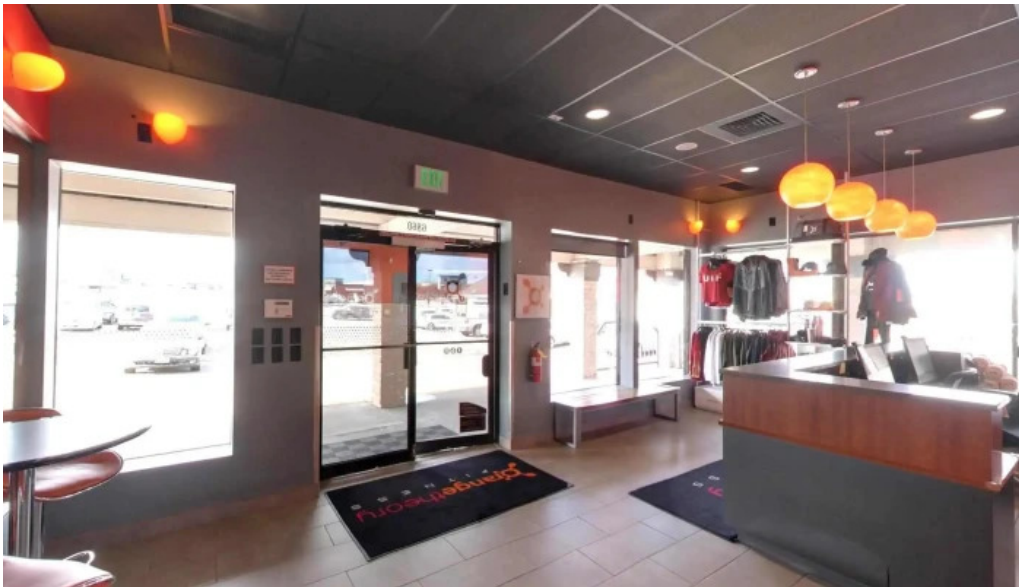
Orangetheory fitness street view 360deg