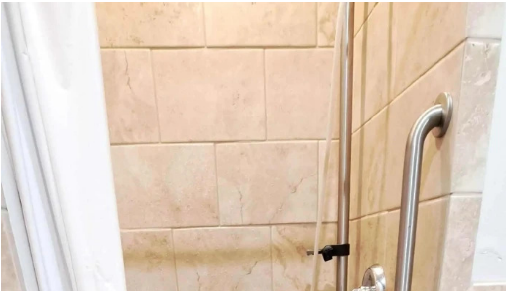
Anytime fitness open now