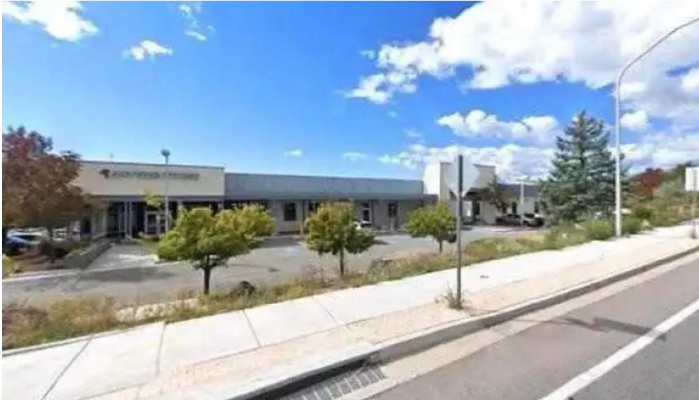
Anytime fitness street view 360deg