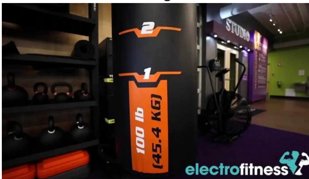
Anytime fitness videos