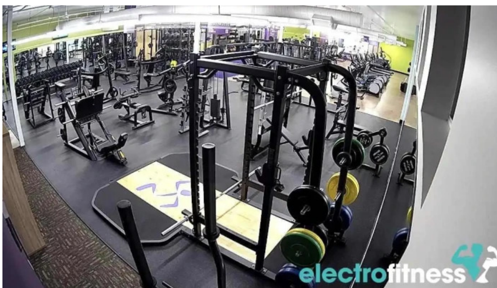
Anytime fitness all