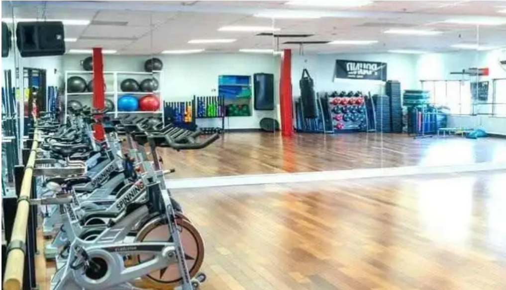
Encompass fitness center gym in marlborough all