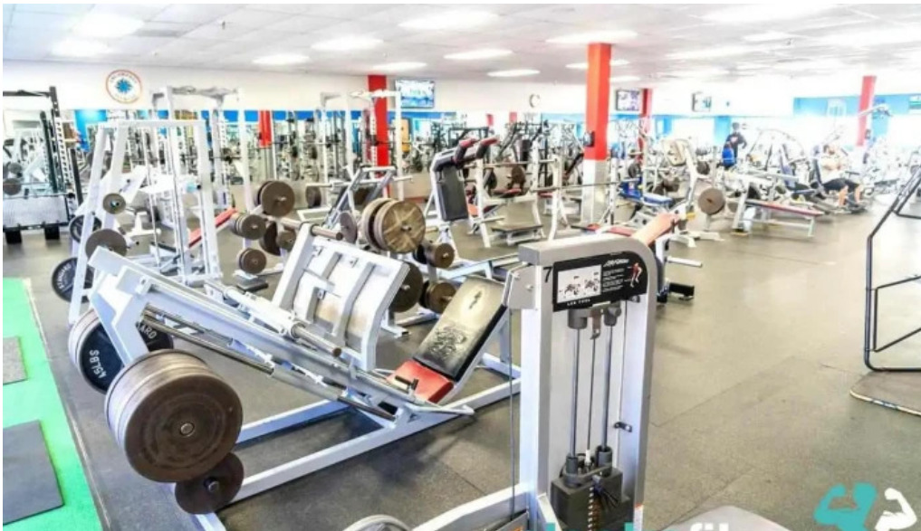
Encompass fitness center gym in marlborough by owner