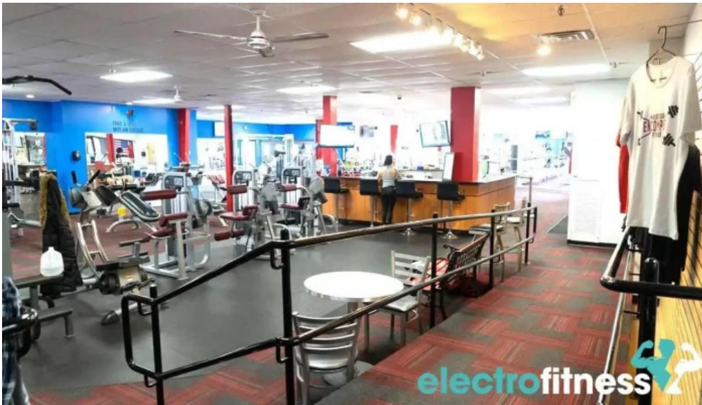
Encompass fitness center gym in marlborough gym