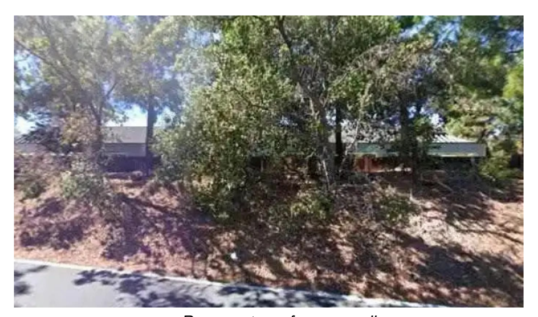
Raw sports performance all