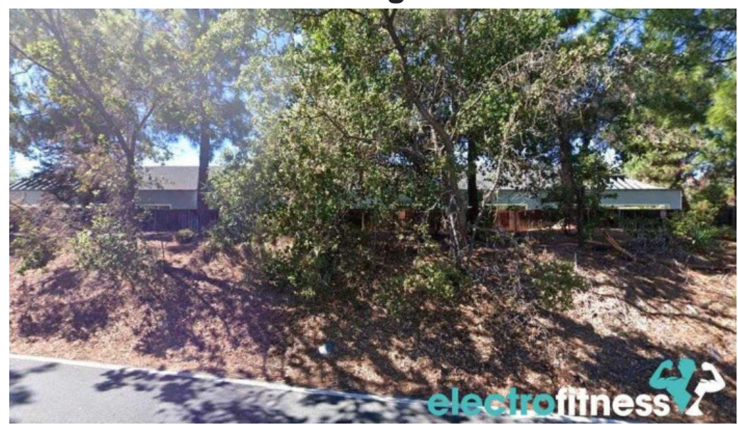
Raw sports performance martinez