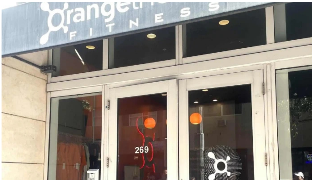
Orangetheory fitness gym