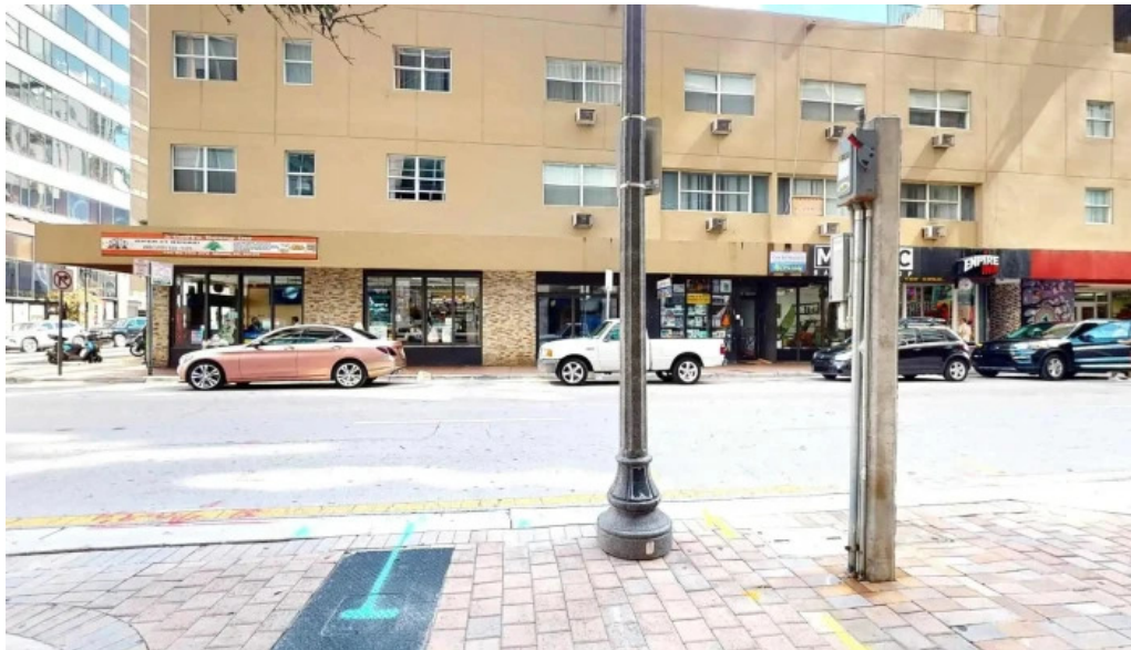
Orangetheory fitness street view 360deg