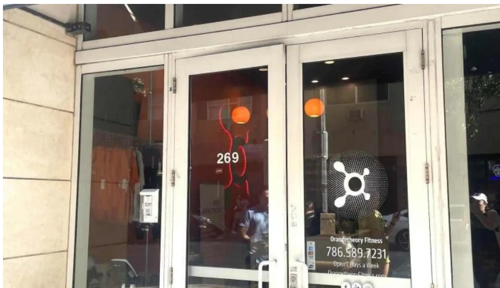
Orangetheory fitness latest