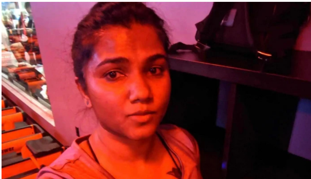
Orangetheory fitness catalog