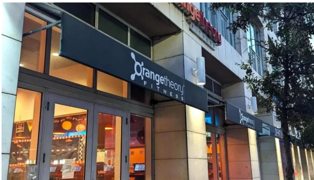
Orangetheory fitness all