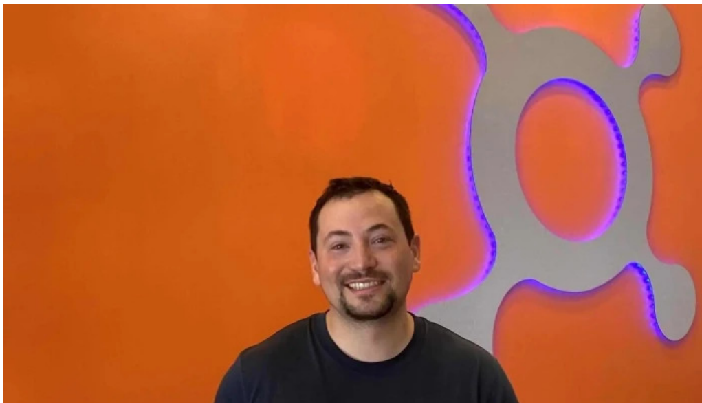
Orangetheory fitness miami