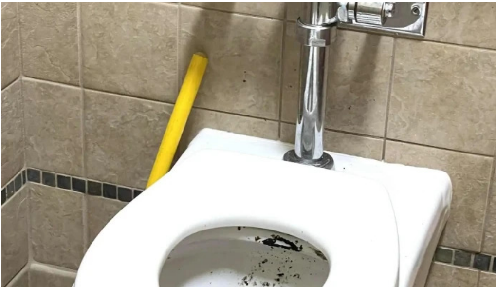
24 hour fitness area