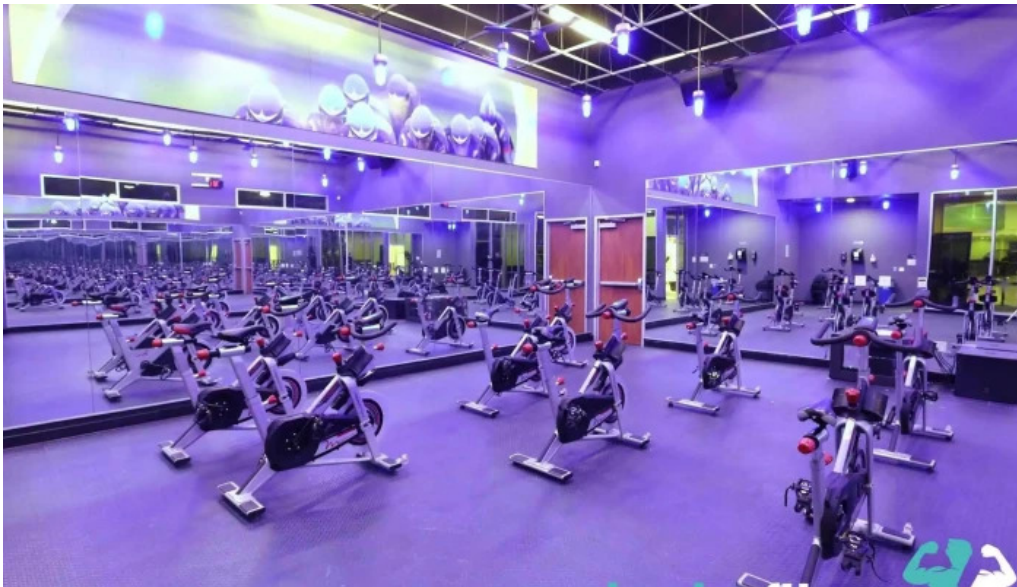
24 hour fitness all