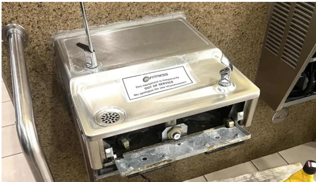
24 hour fitness gym