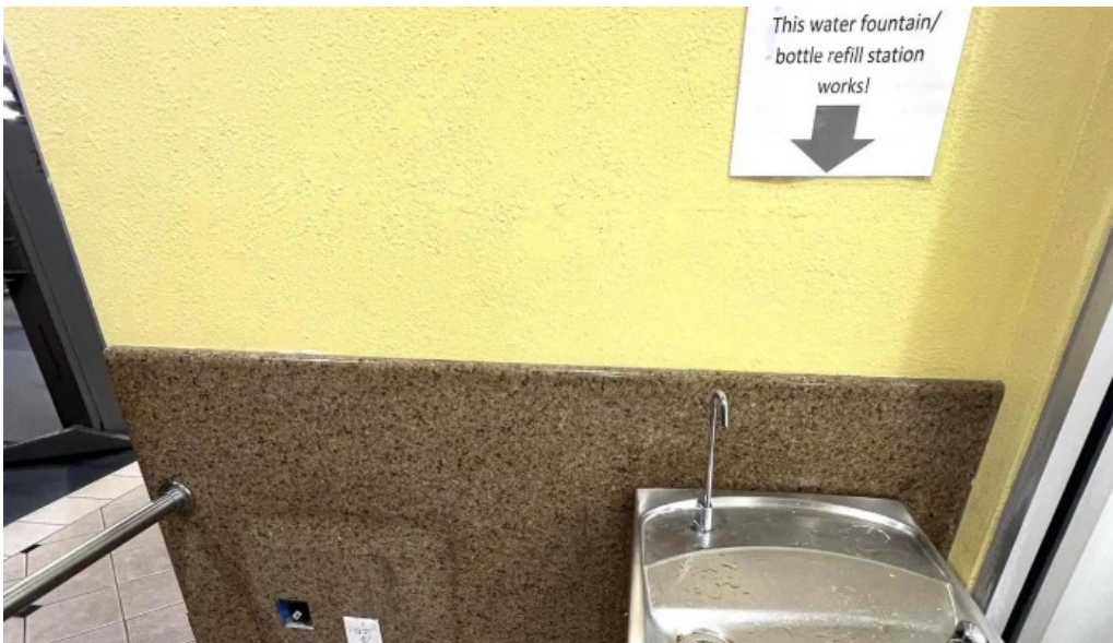
24 hour fitness moraga