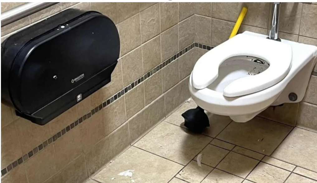
24 hour fitness website