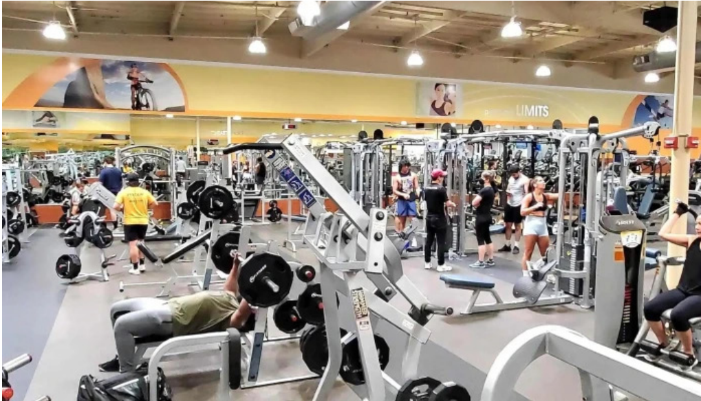
24 hour fitness score