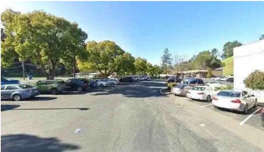
24 hour fitness street view 360deg