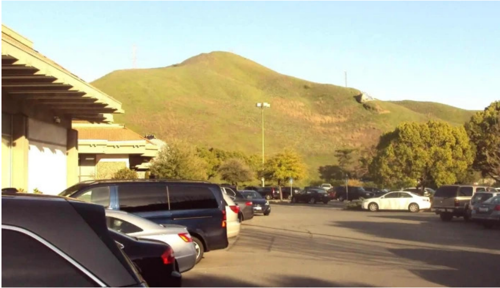
24 hour fitness videos