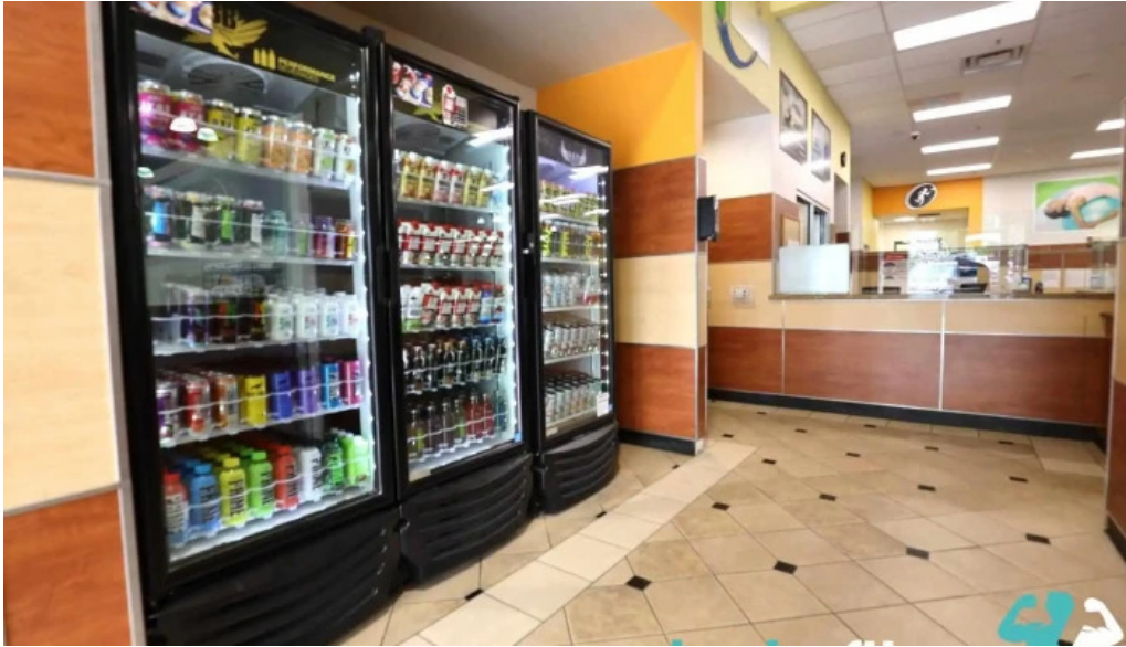
24 hour fitness by owner