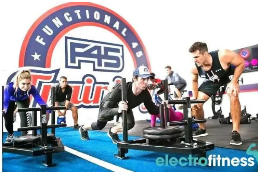
F45 training moraga moraga