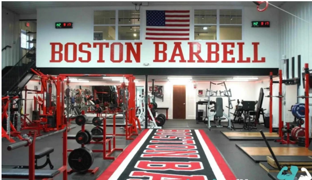
Boston barbell by owner