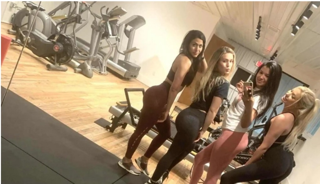
Boston barbell north billerica