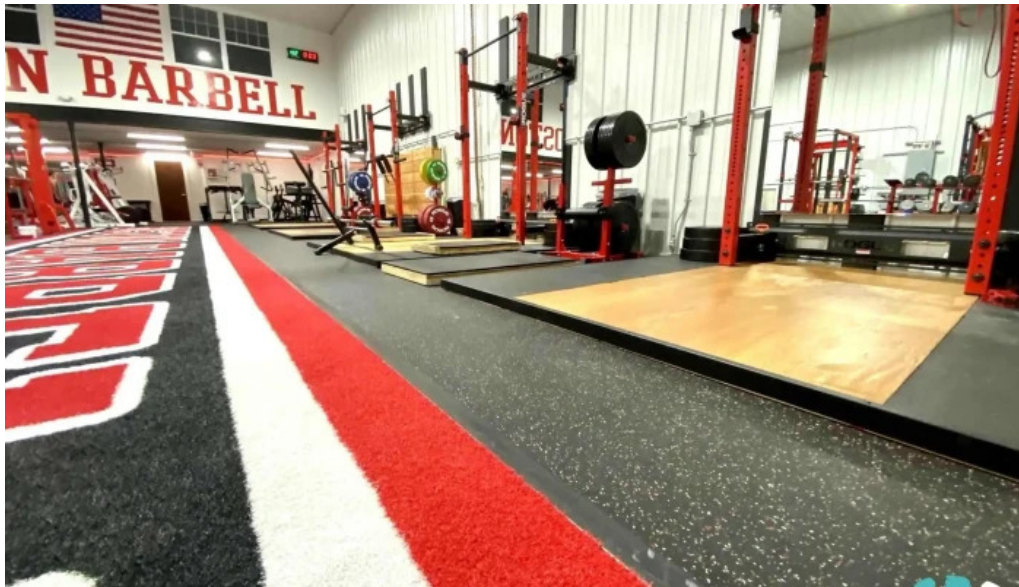
Boston barbell all