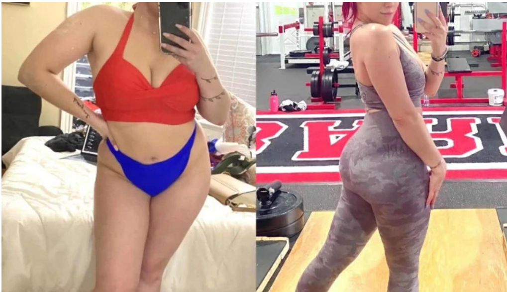
Boston barbell phone