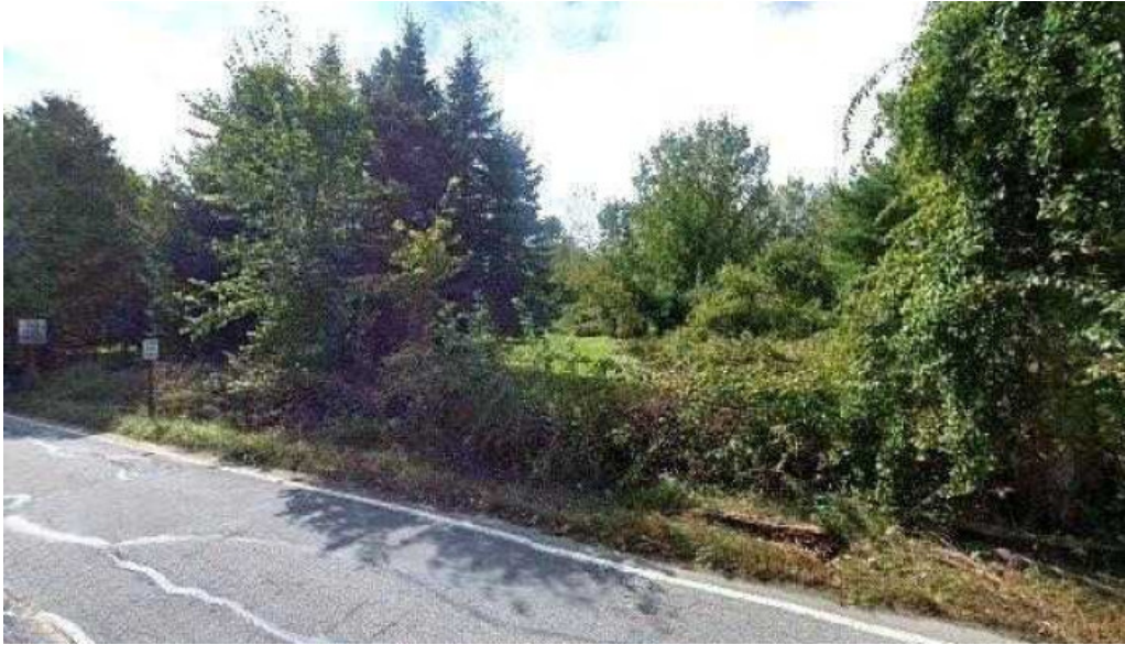
Boston barbell street view 360deg