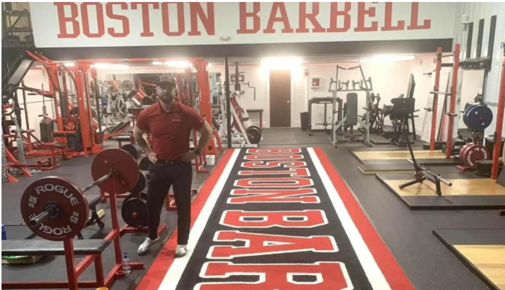
Boston barbell gym