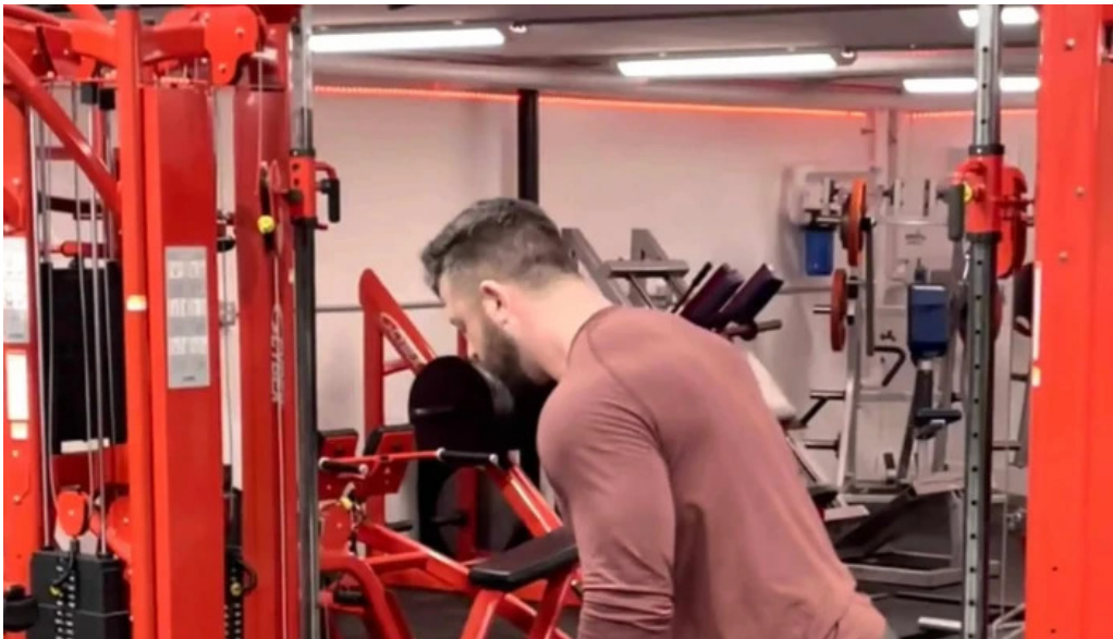
Boston barbell score