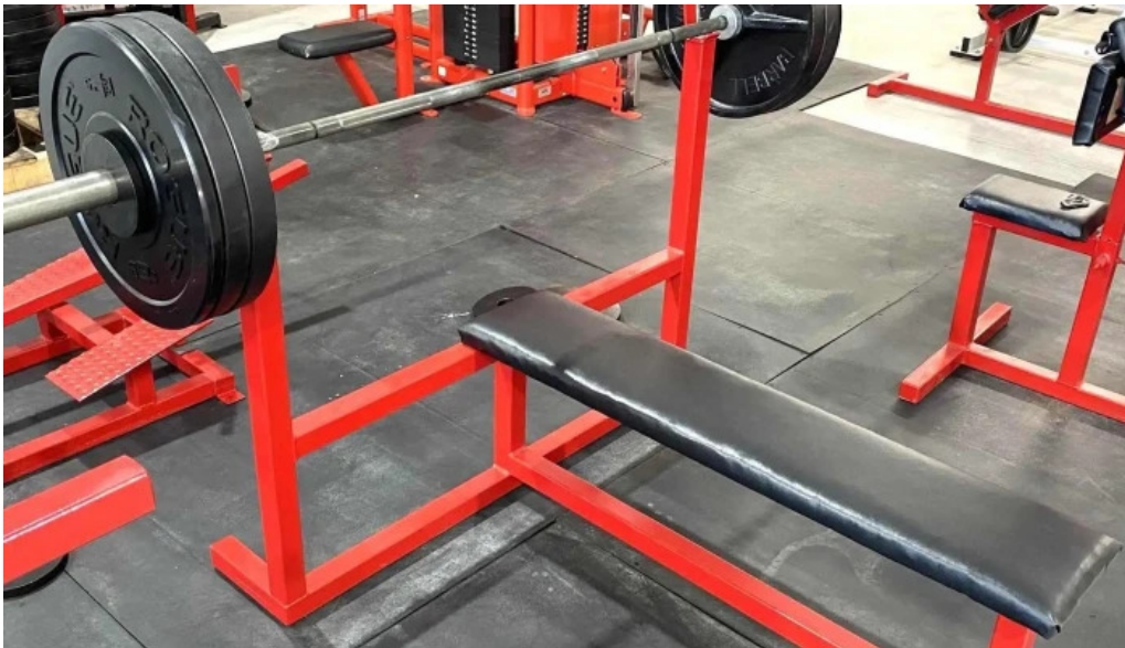
Boston barbell reviews