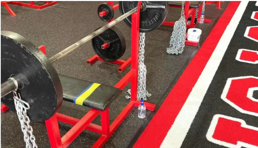
Boston barbell catalog