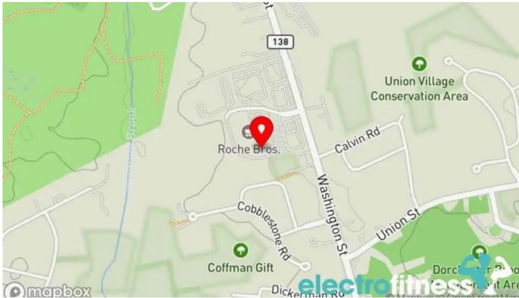
Anytime fitness map