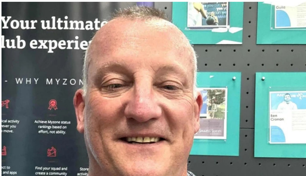
Anytime fitness location