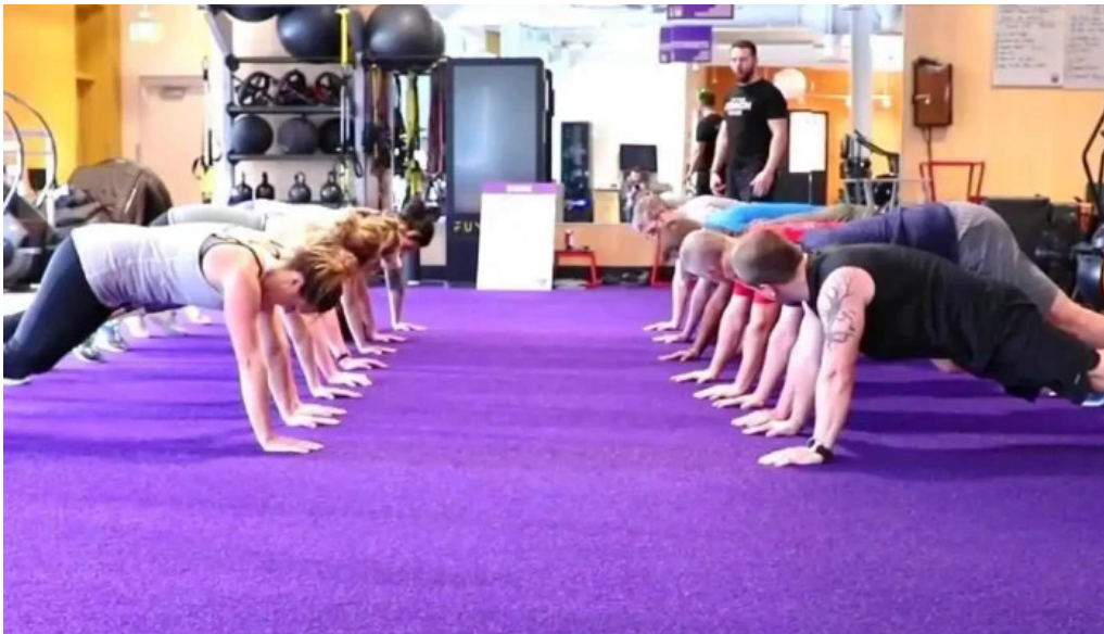
Anytime fitness videos