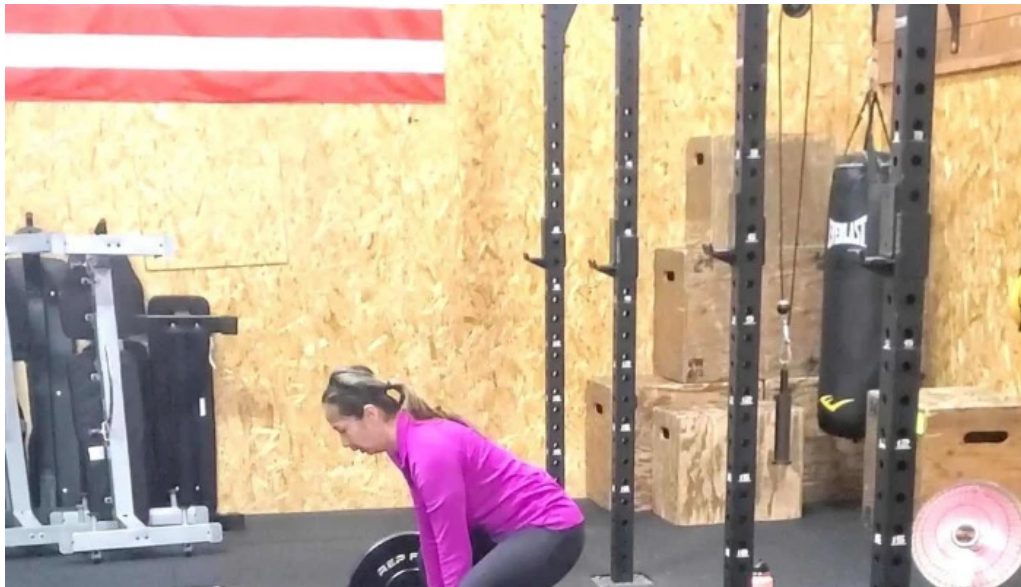
Yosemite strength and training phone