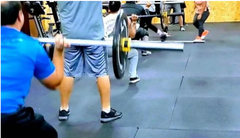
Yosemite strength and training by owner