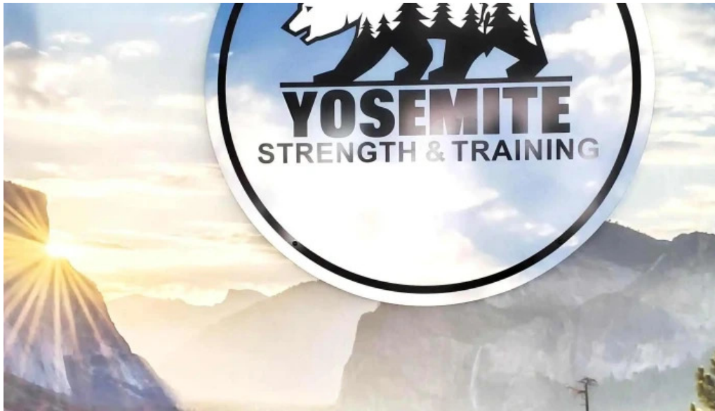
Yosemite strength and training catalog