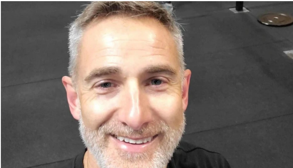
Yosemite strength and training schedule