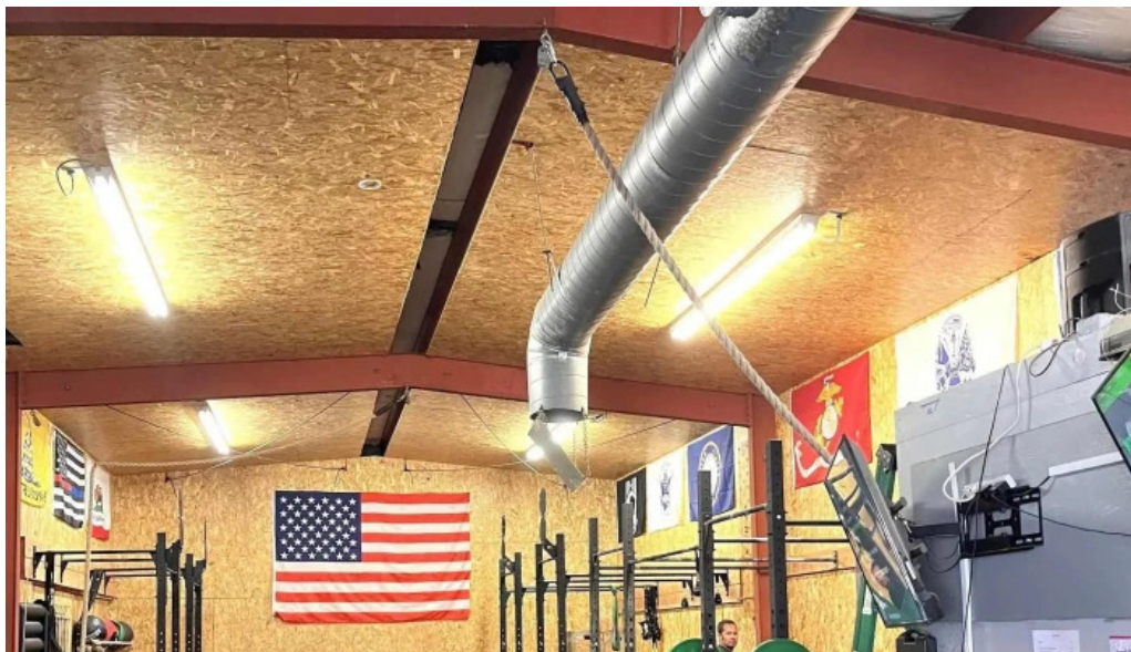
Yosemite strength and training oakhurst