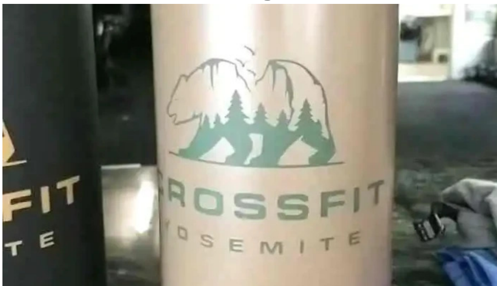
Yosemite strength and training videos