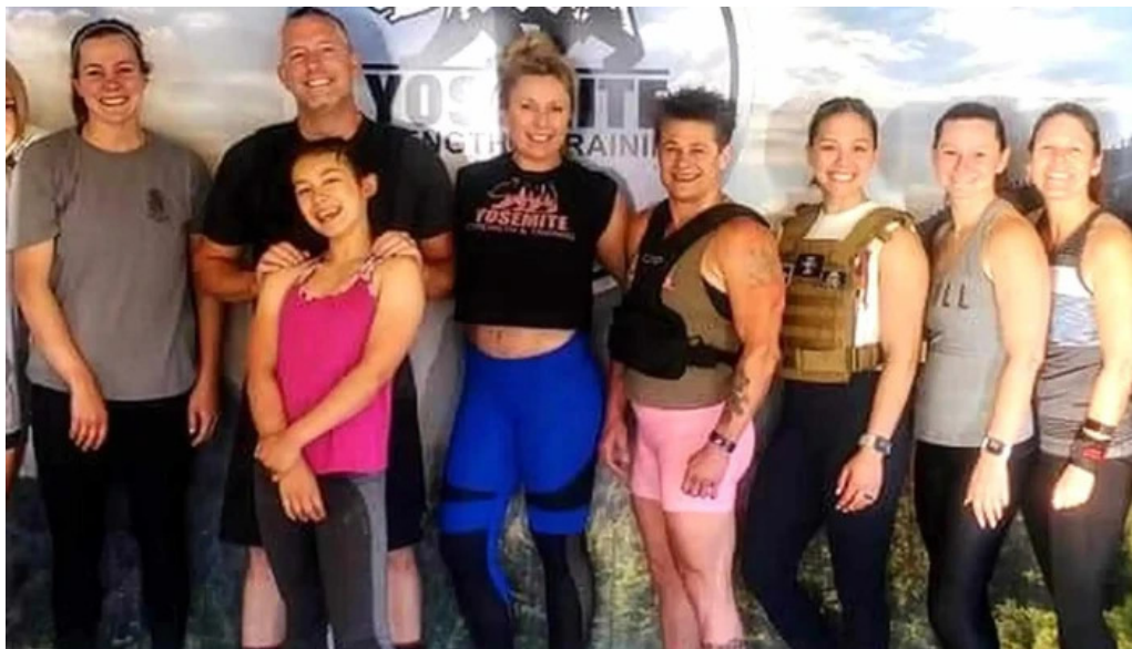
Yosemite strength and training gym