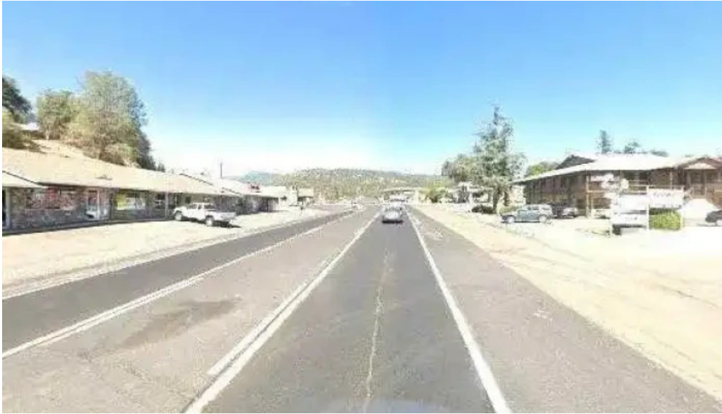
Yosemite strength and training street view 360deg