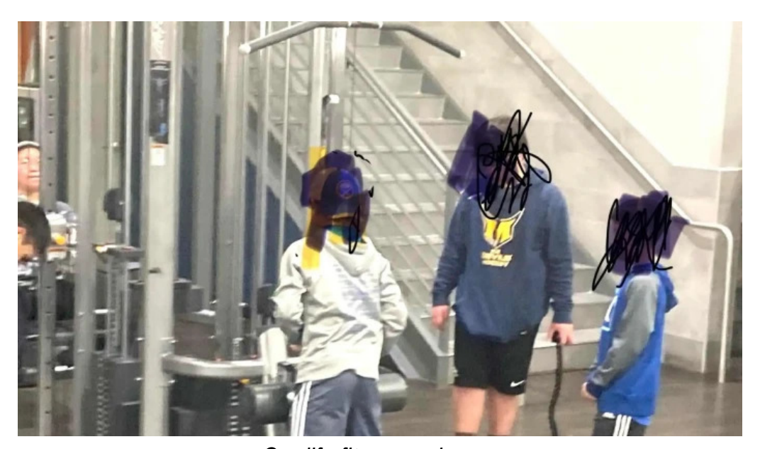
Onelife fitness olney gym