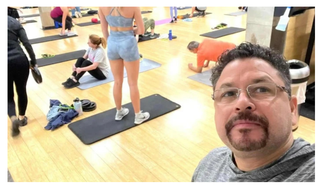
Onelife fitness olney website