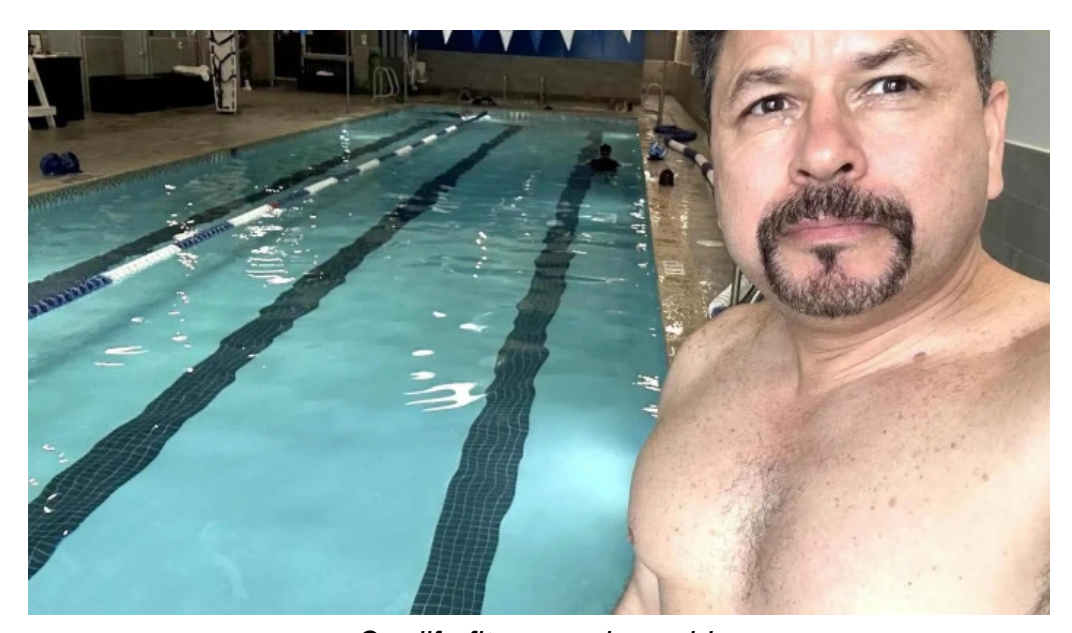
Onelife fitness olney videos