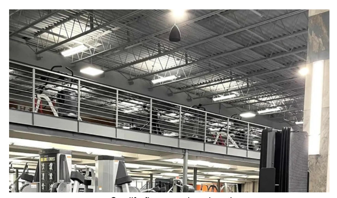
Onelife fitness olney location