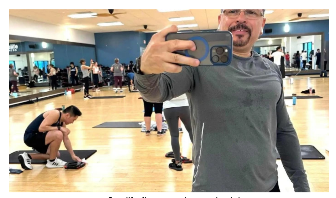
Onelife fitness olney schedule