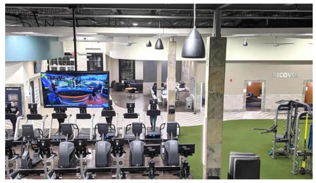
Onelife fitness olney reviews