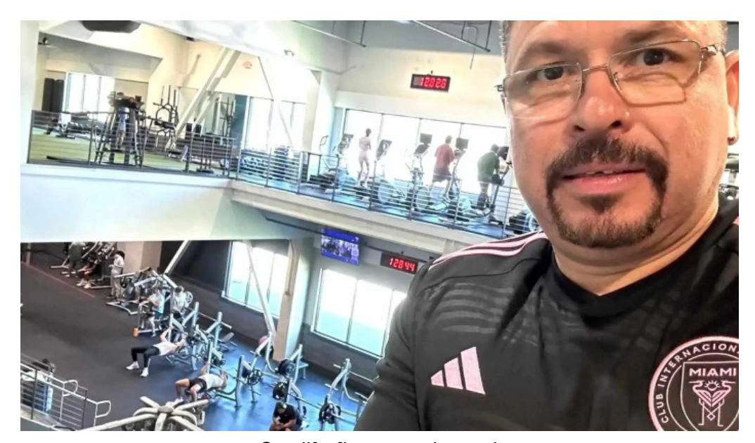
Onelife fitness olney olney