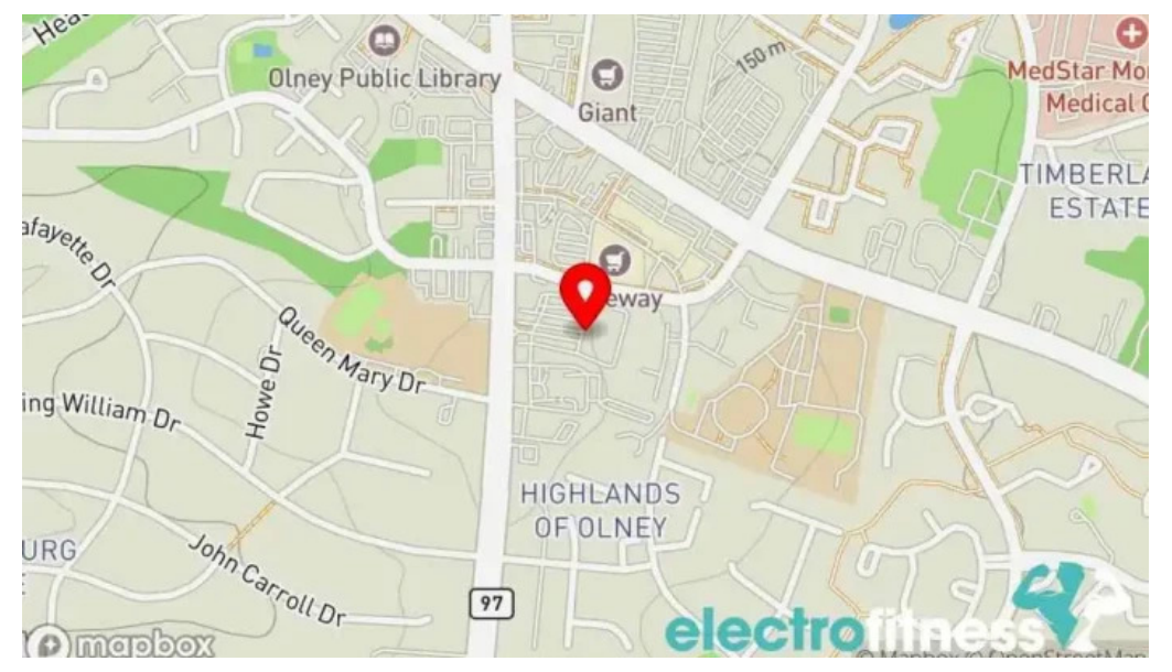
Onelife fitness olney map