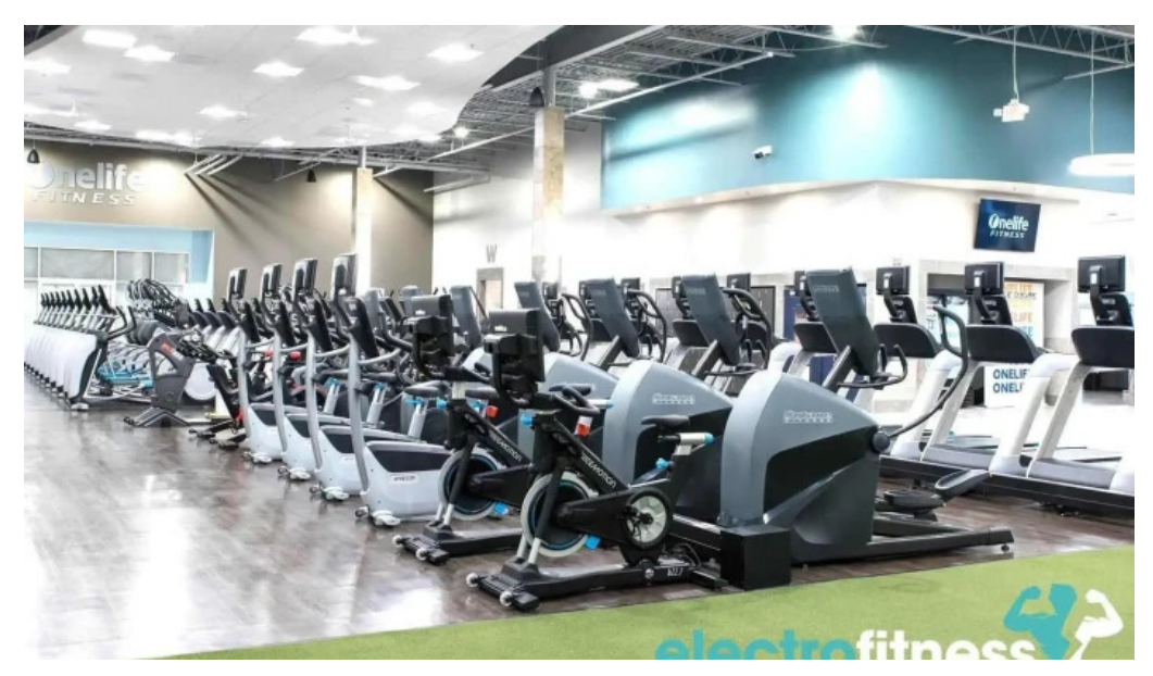
Onelife fitness olney all