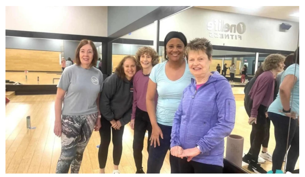
Onelife fitness olney latest