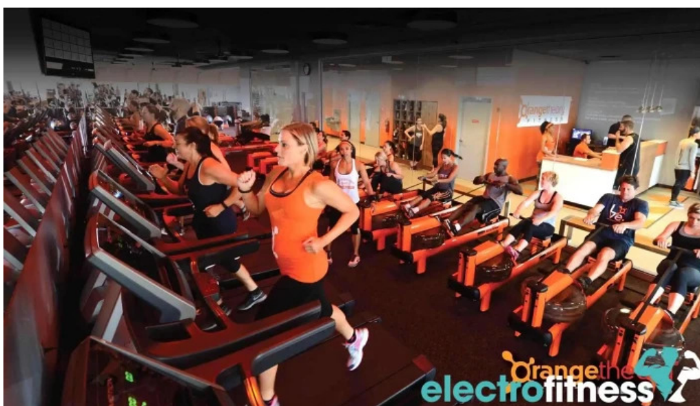
Orangetheory fitness all