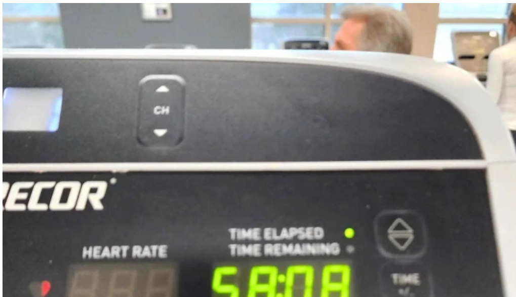
Orangetheory fitness phone