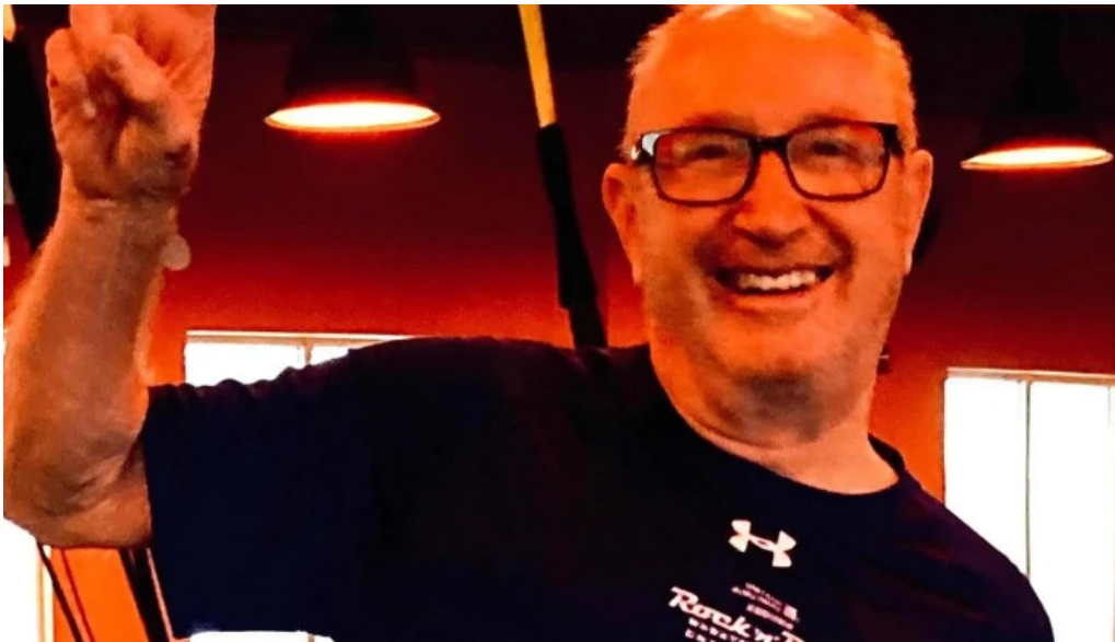
Orangetheory fitness promotion