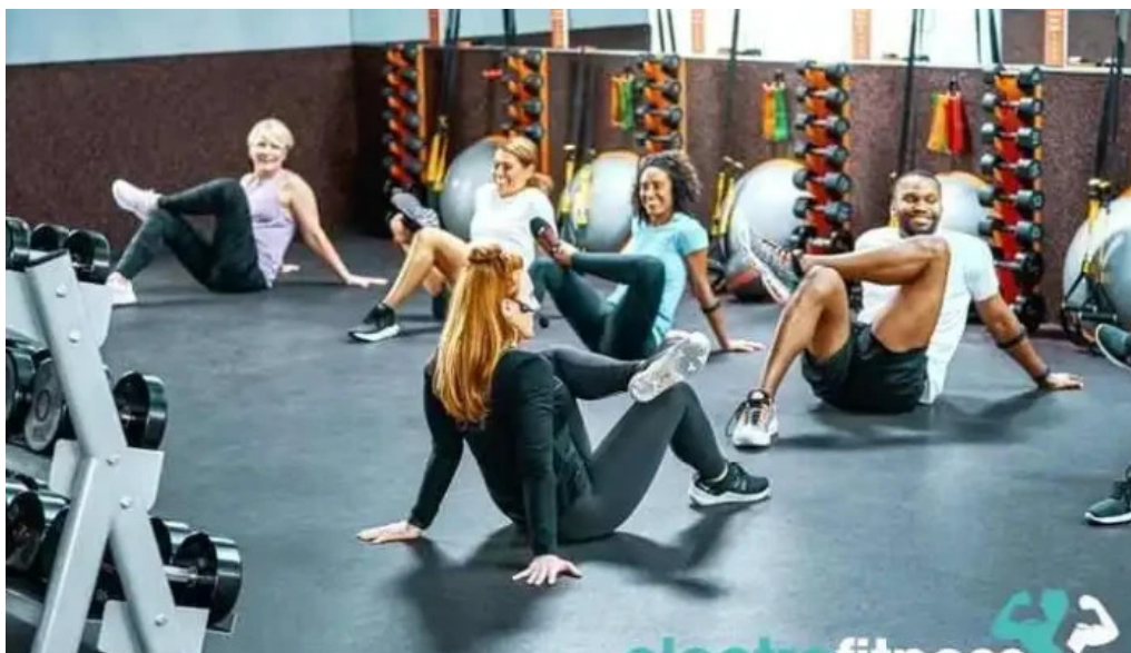
Orangetheory fitness by owner