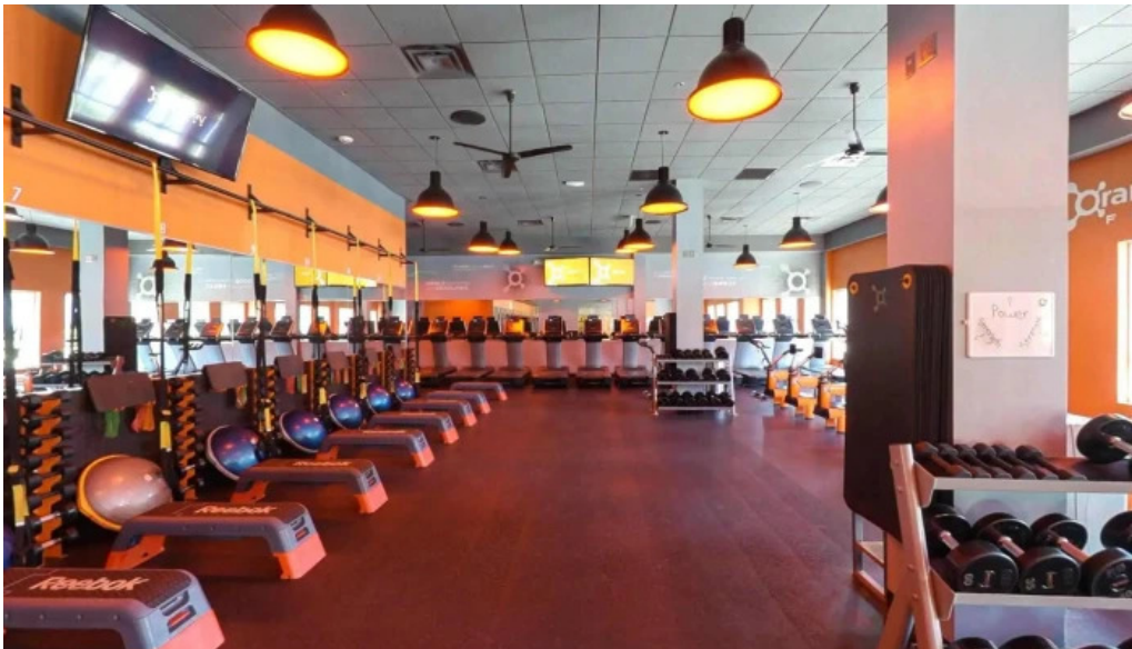
Orangetheory fitness street view 360deg