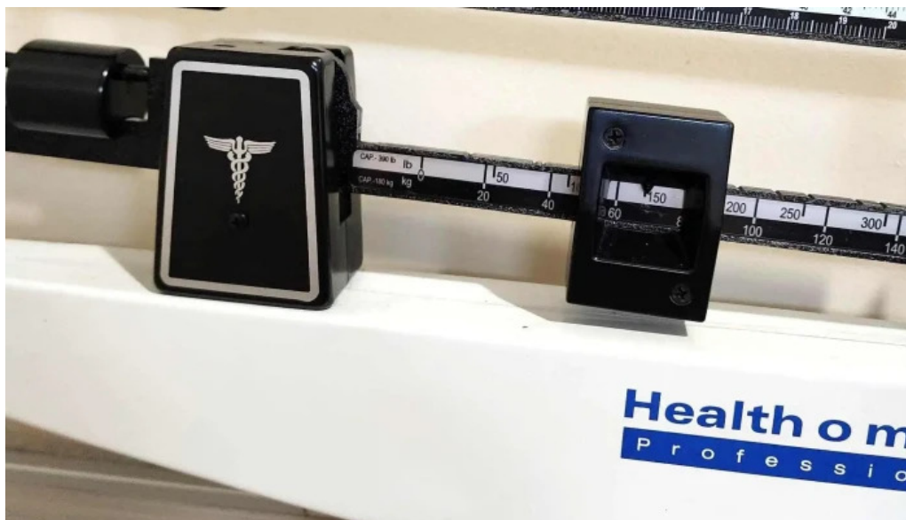
Orangetheory fitness how to get there