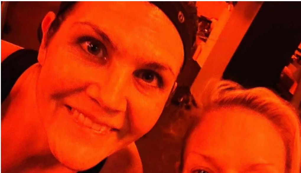
Orangetheory fitness discounts