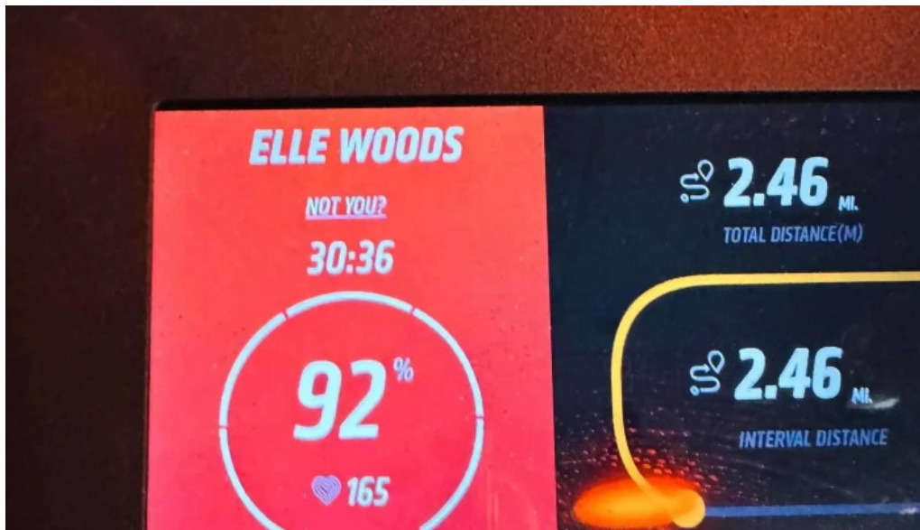
Orangetheory fitness olney