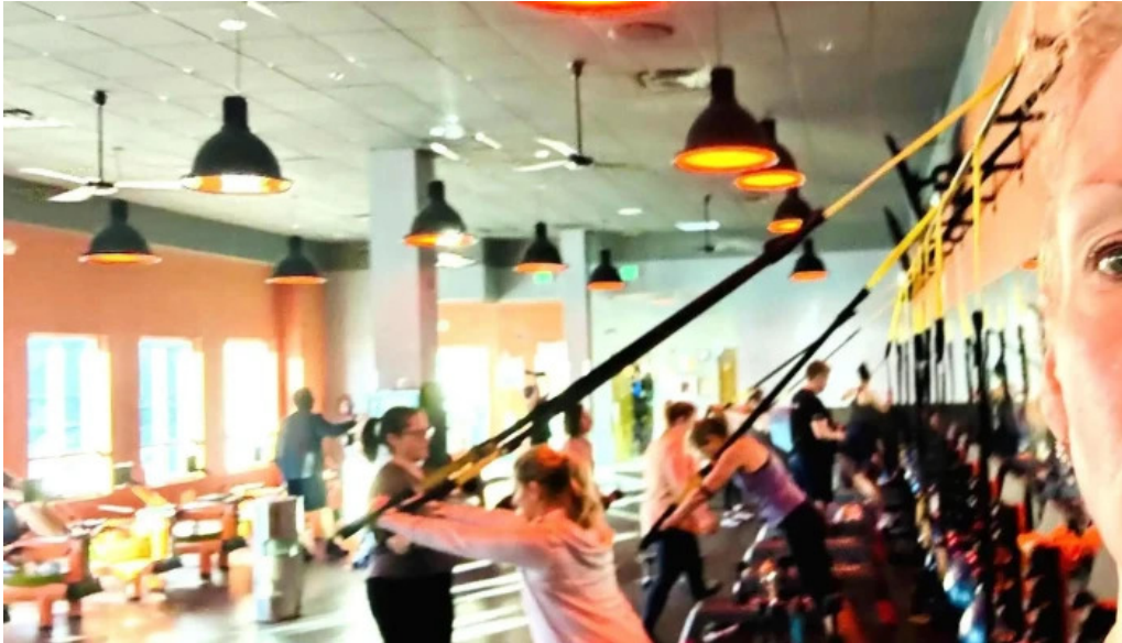
Orangetheory fitness gym