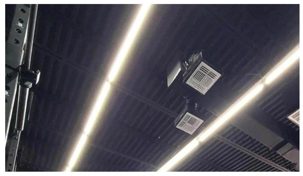
United front community fitness address