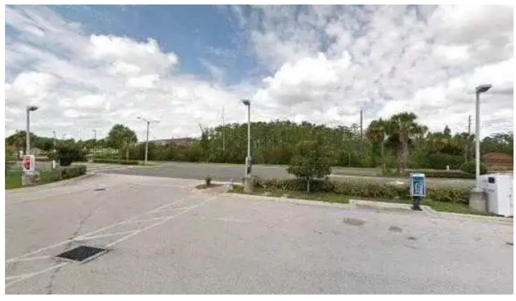
United front community fitness street view 360deg