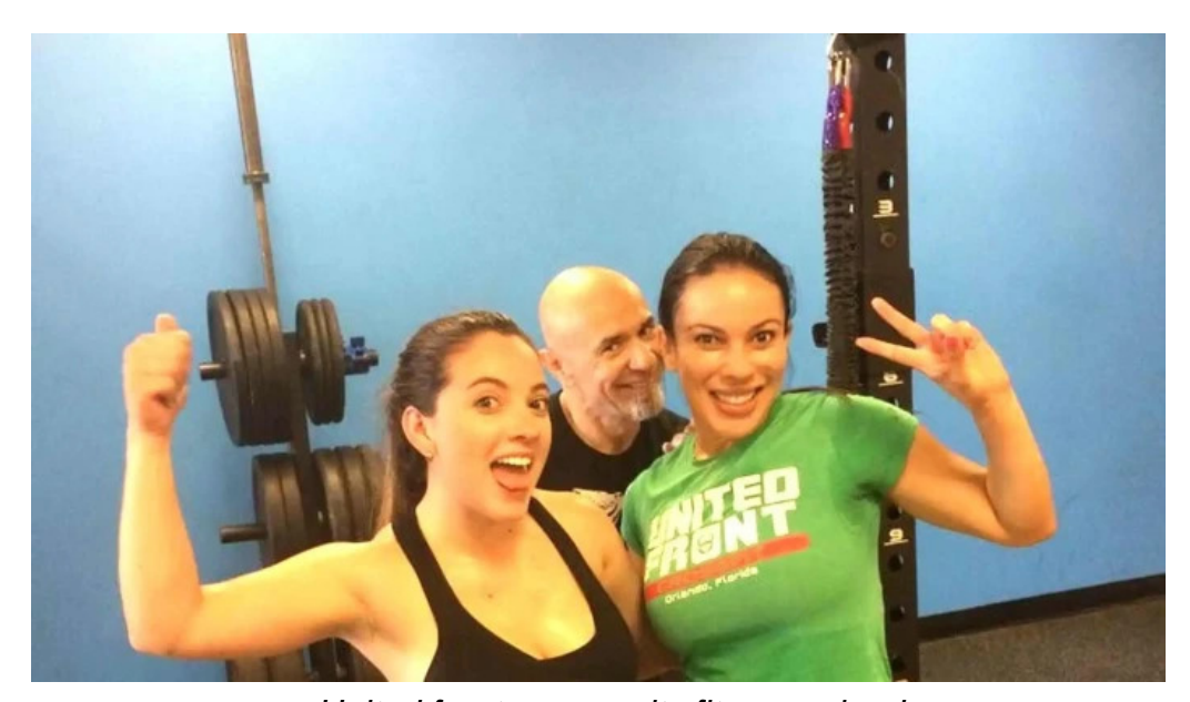
United front community fitness orlando