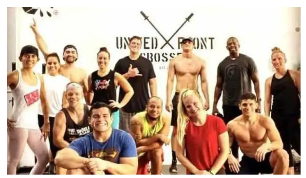
United front community fitness by owner