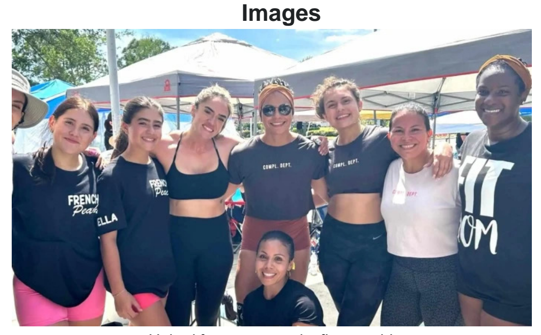
United front community fitness videos

If you wish to modify any element that you consider is not precise regarding this portal, please deliver a message so that we will adjust it as soon as possible. Thanks beforehand thanks.