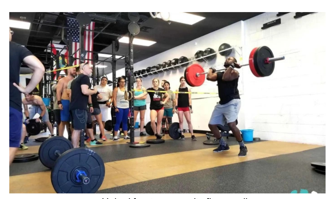
United front community fitness all