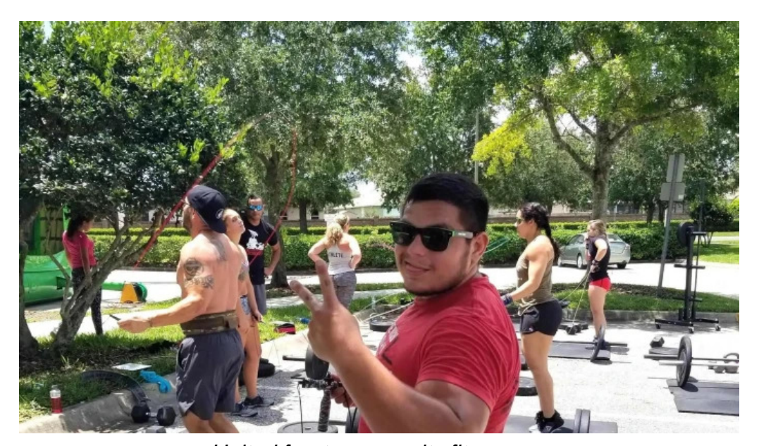
United front community fitness score