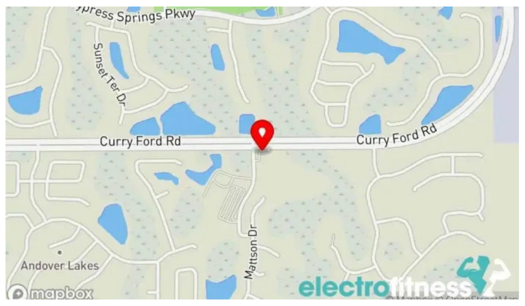
United front community fitness map