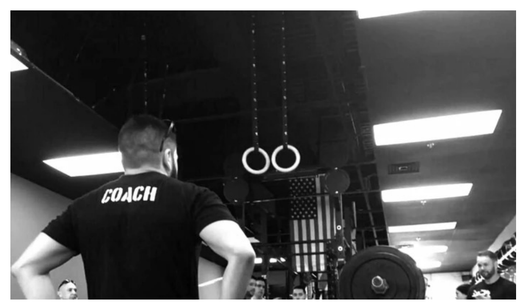
United front community fitness gym