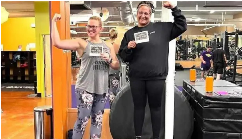
Anytime fitness pembroke