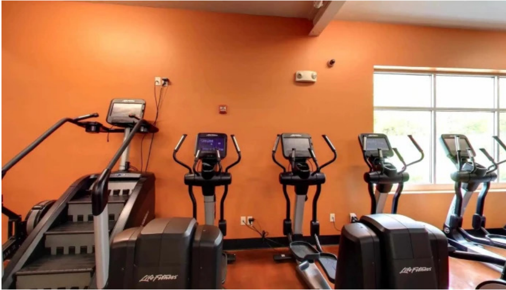
Anytime fitness street view 360deg