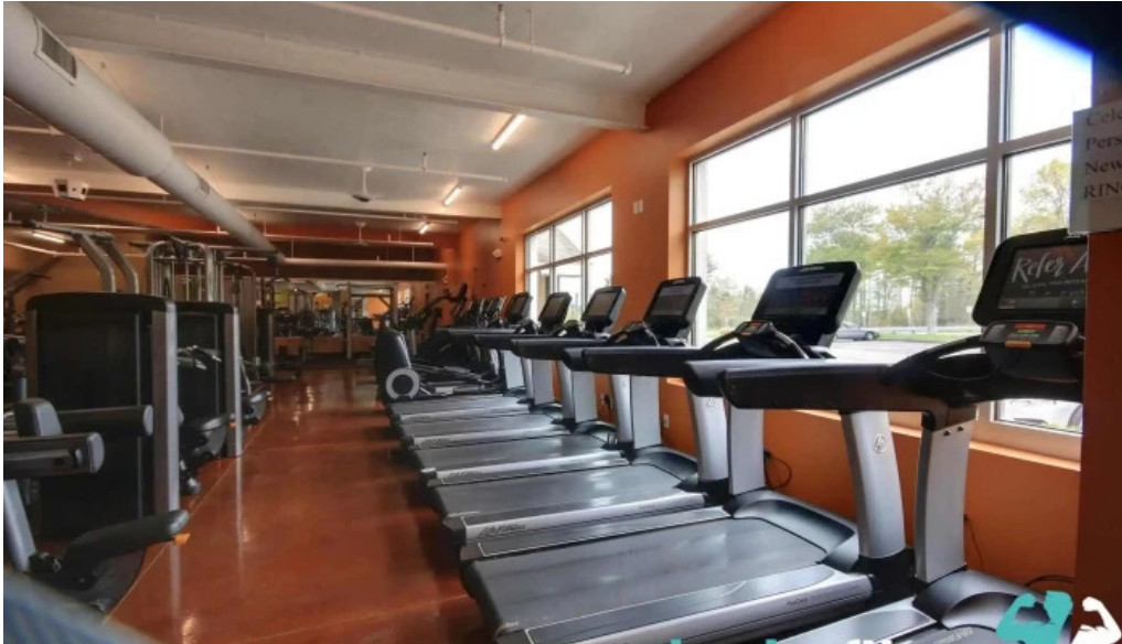
Anytime fitness by owner