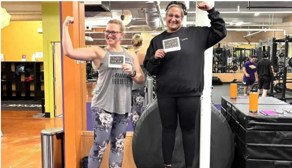
Anytime fitness all