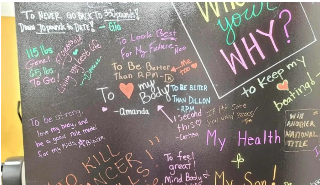
Anytime fitness phelan