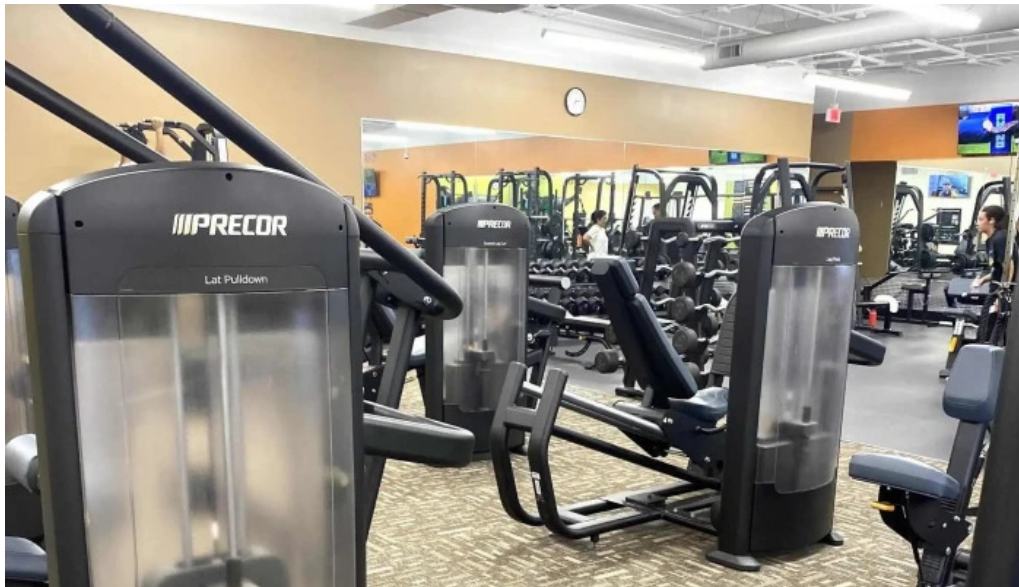
Anytime fitness address