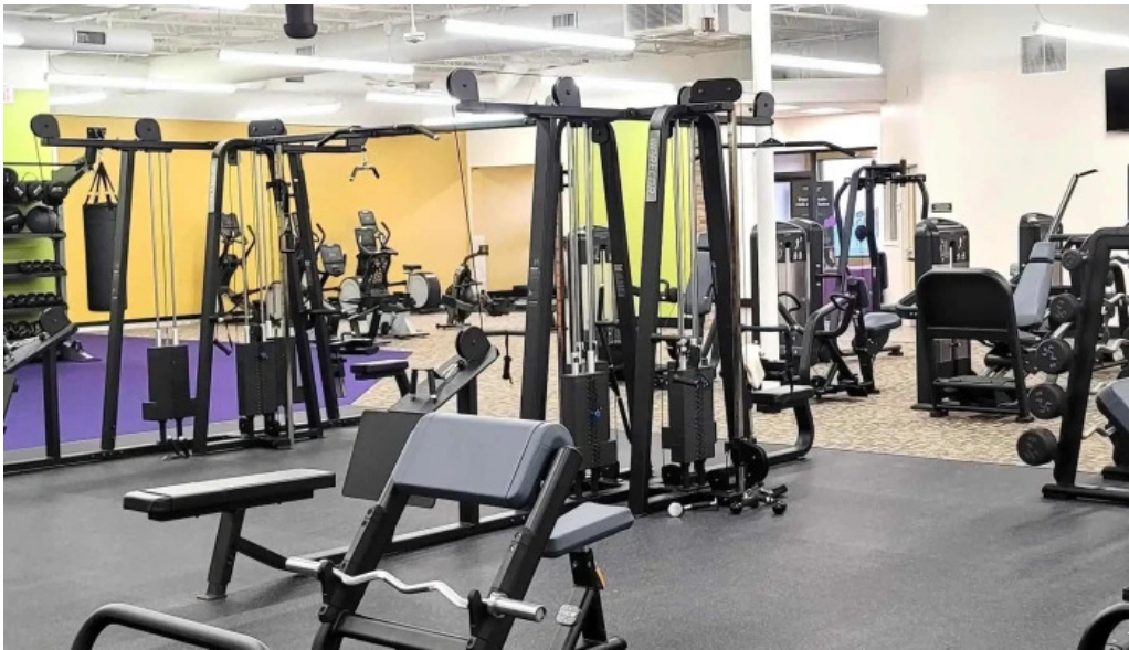
Anytime fitness area