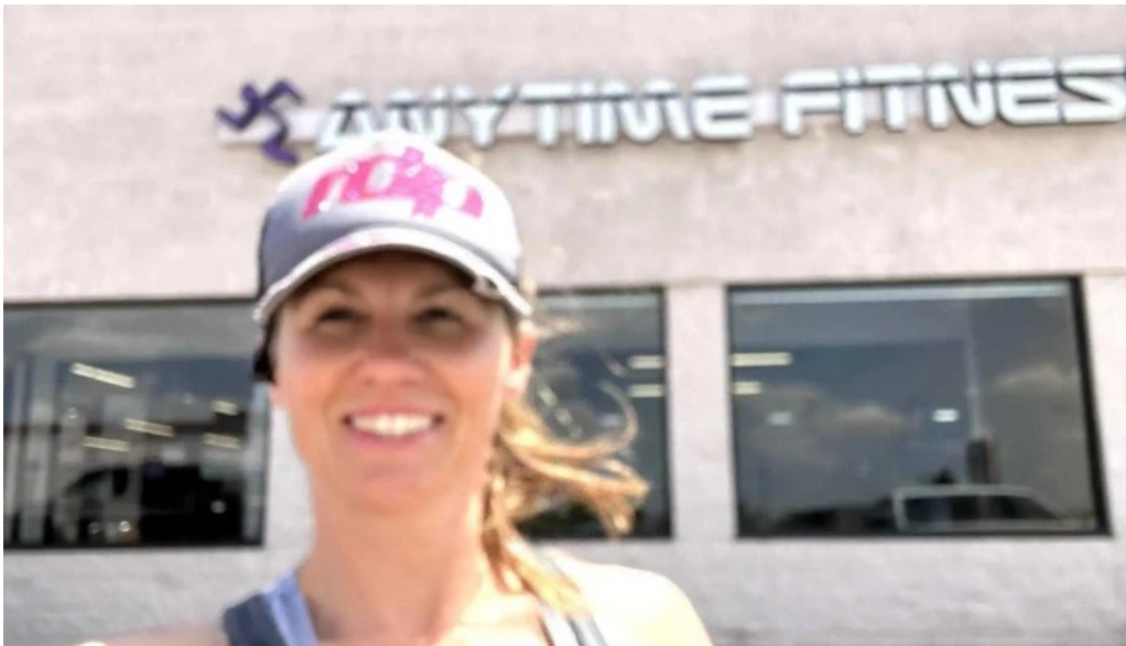
Anytime fitness promotion