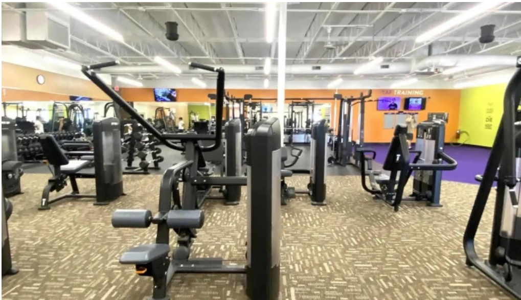
Anytime fitness schedule