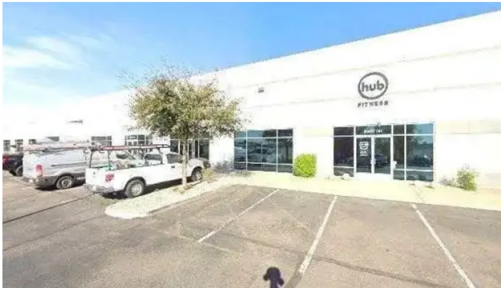
Hub fitness street view 360deg