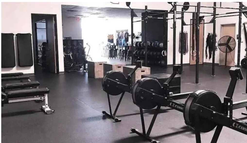
Hub fitness by owner