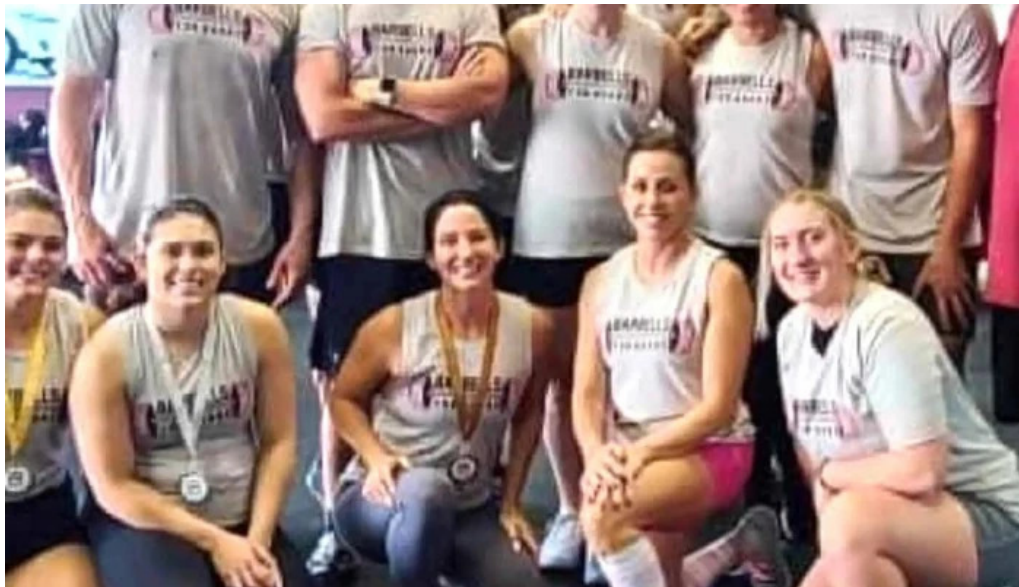
Hub fitness gym