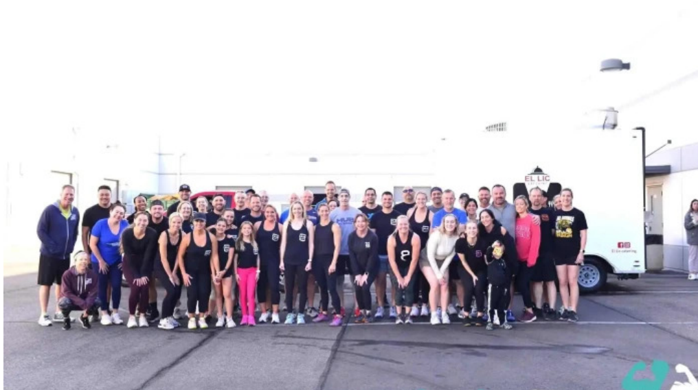
Hub fitness all