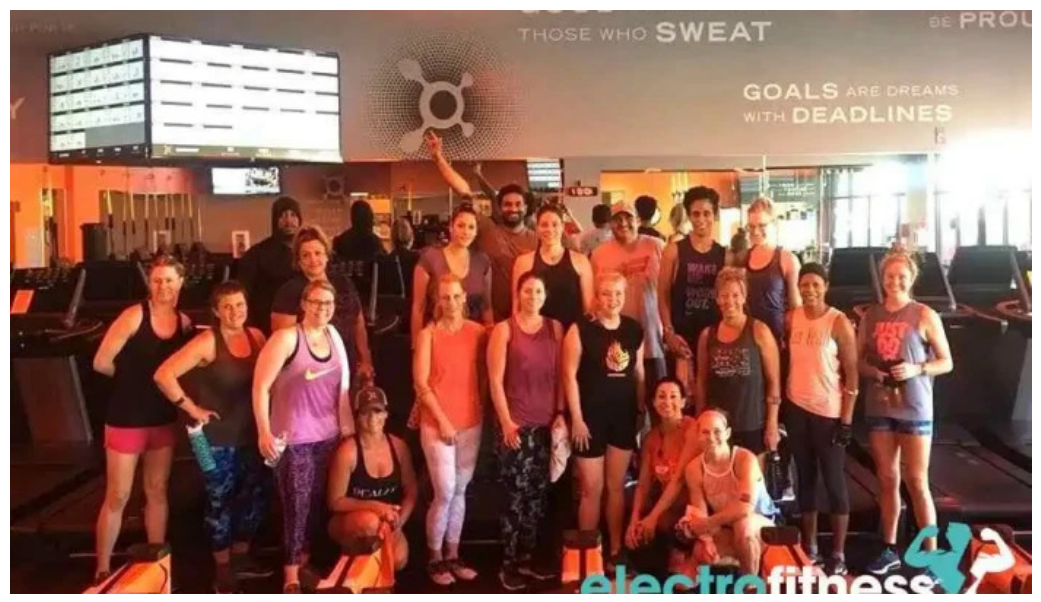
Orangetheory fitness by owner