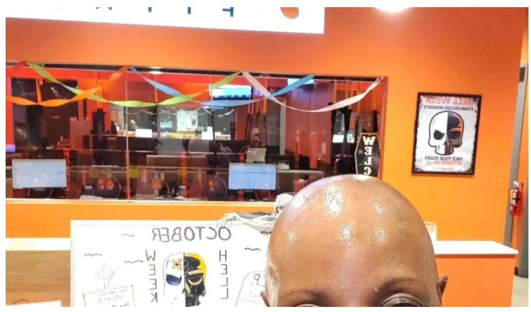
Orangetheory fitness phoenix