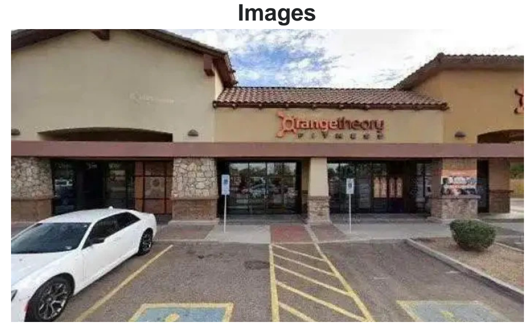
Orangetheory fitness street view 360deg

In case you want to alter any element that you think is not precise concerning this web, we kindly request deliver a message so we can we will correct it quickly. With anticipation thank you very much.