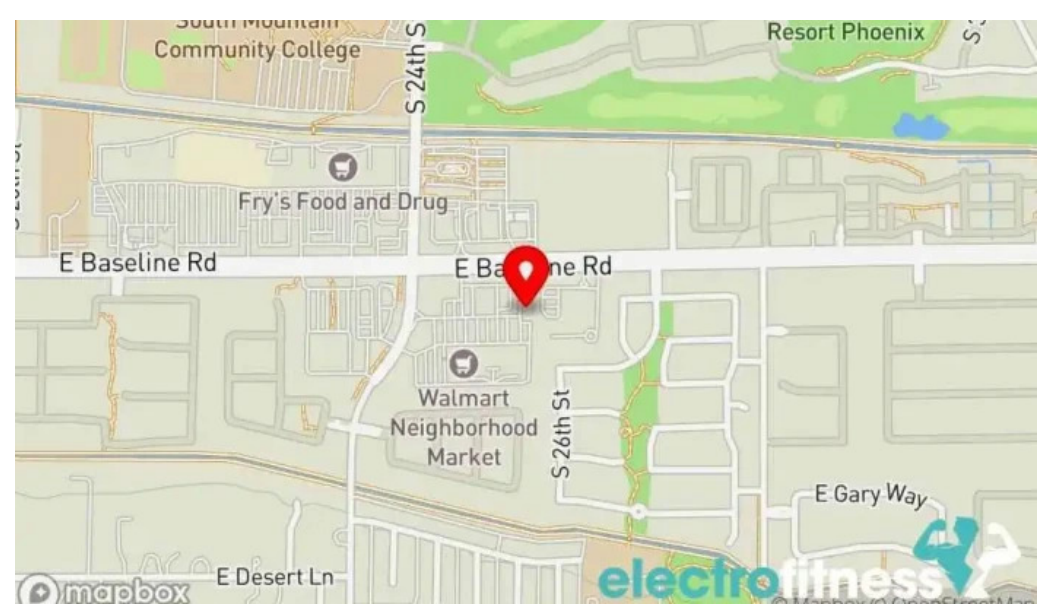
Orangetheory fitness map