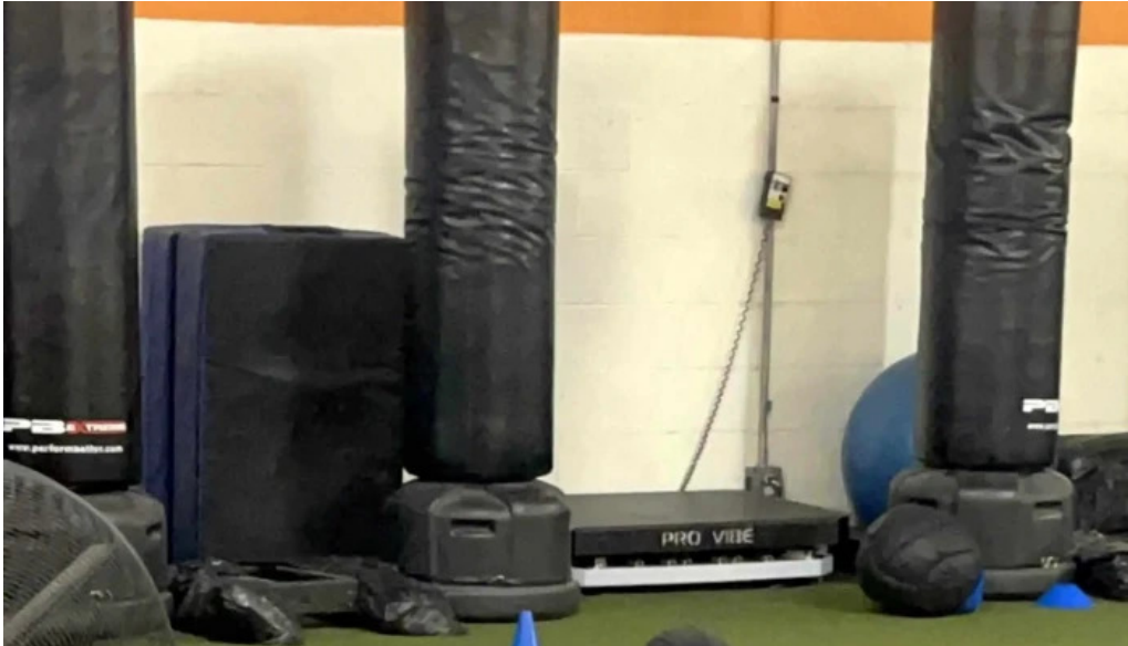
Faster pittsburgh comments