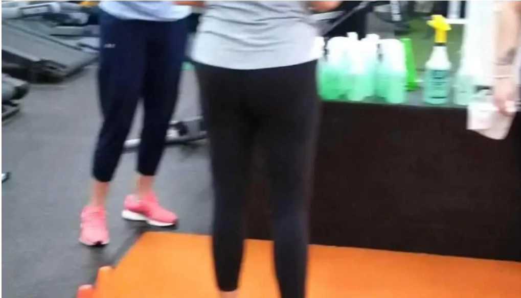
Faster pittsburgh videos