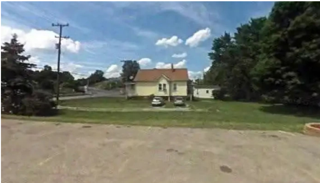
Faster pittsburgh street view 360deg