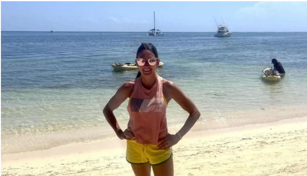
Faster pittsburgh pittsburgh