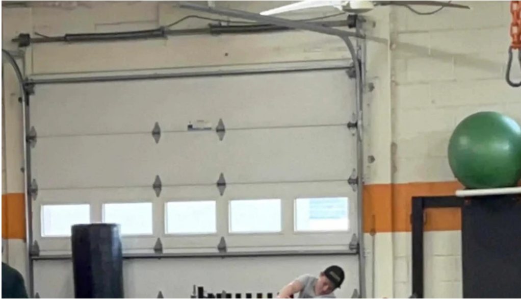
Faster pittsburgh promotion