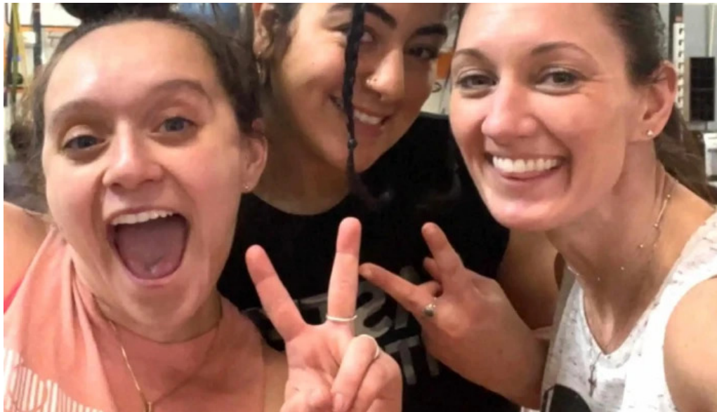
Faster pittsburgh gym