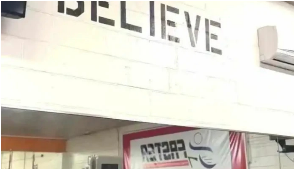
Faster pittsburgh by owner