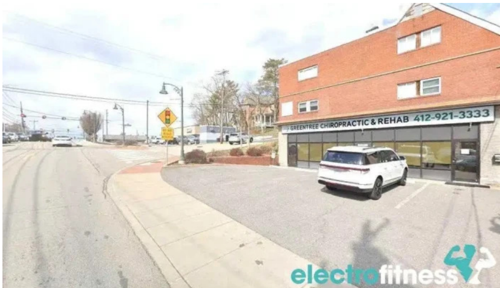
Pittsburgh kettlebell performance pittsburgh