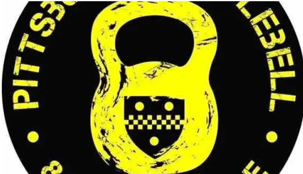
Pittsburgh kettlebell performance by owner