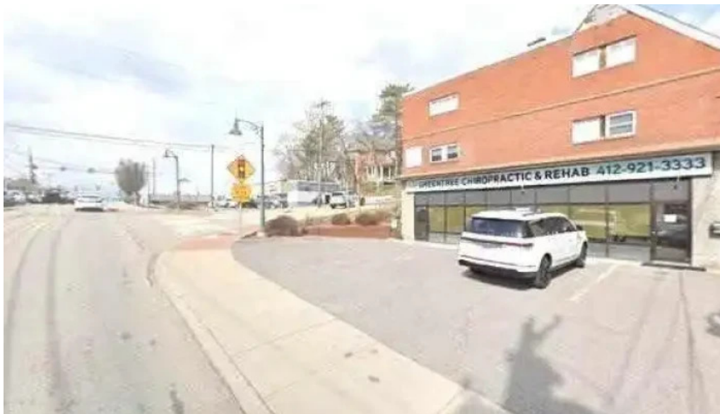
Pittsburgh kettlebell performance all