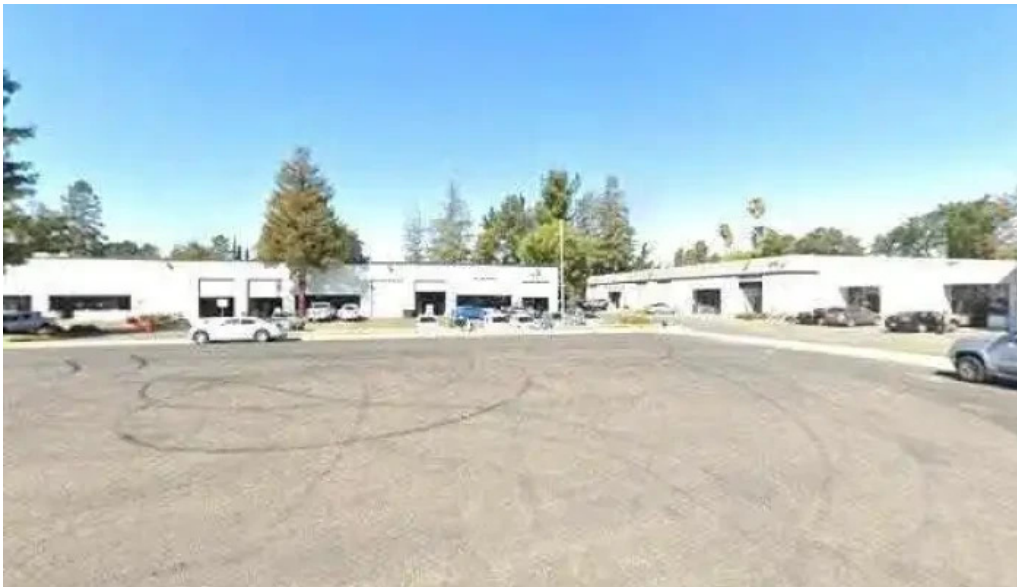
Diablo crossfit street view 360deg