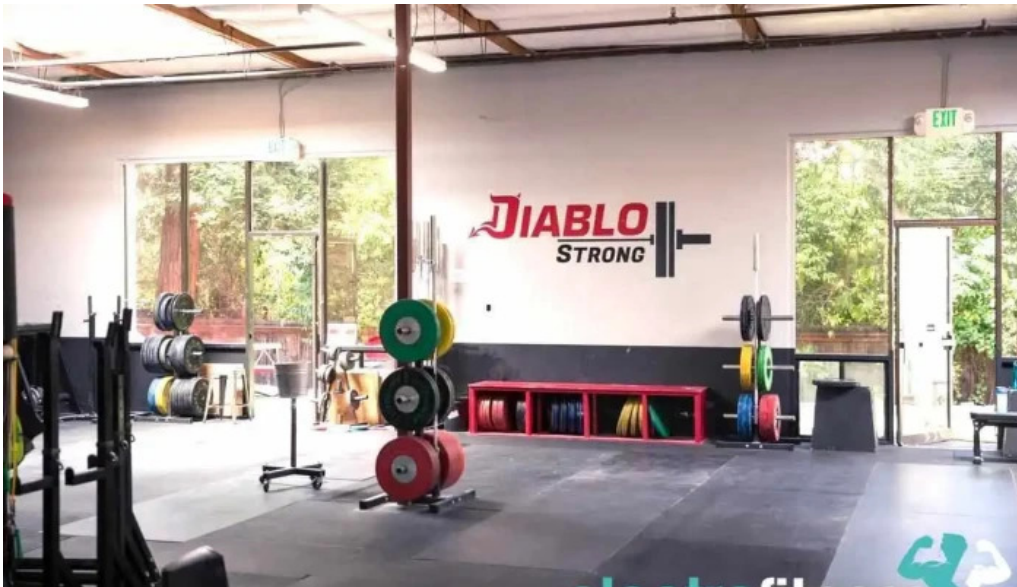
Diablo crossfit gym