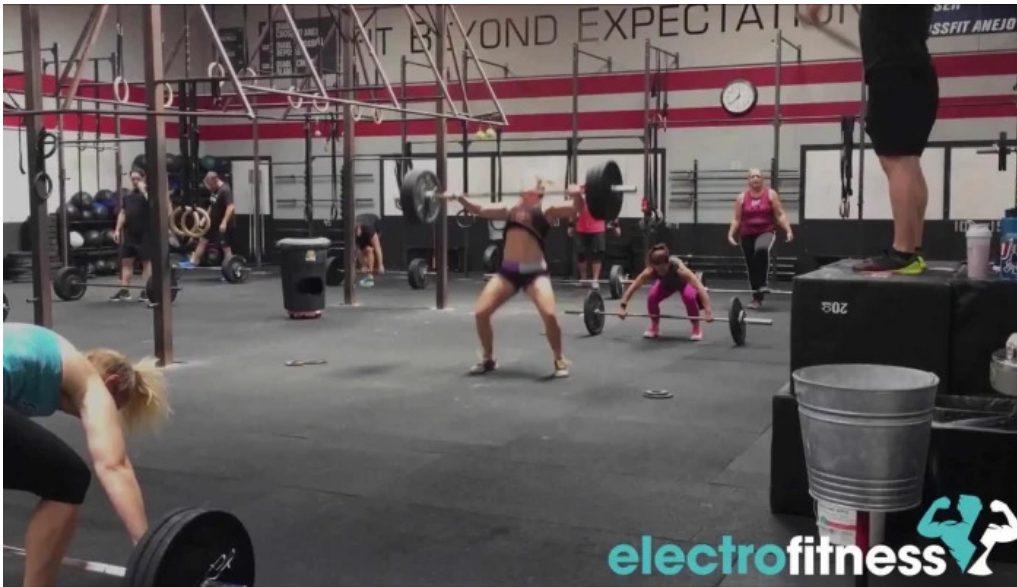
Diablo crossfit videos