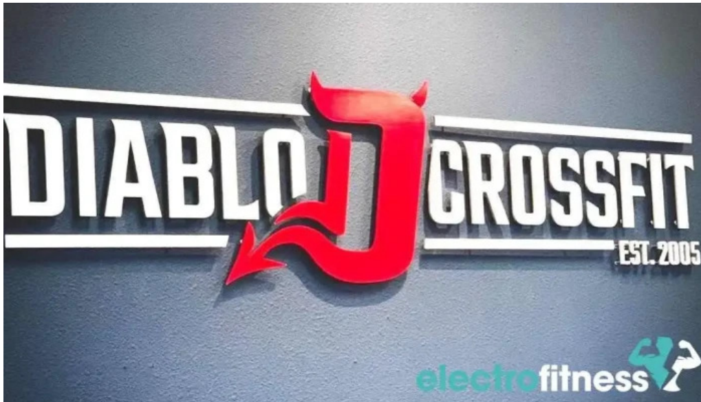
Diablo crossfit pleasant hill