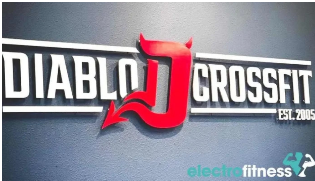
Diablo crossfit all