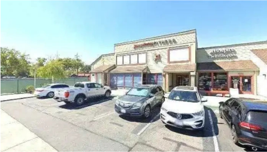
Orangetheory fitness street view 360deg