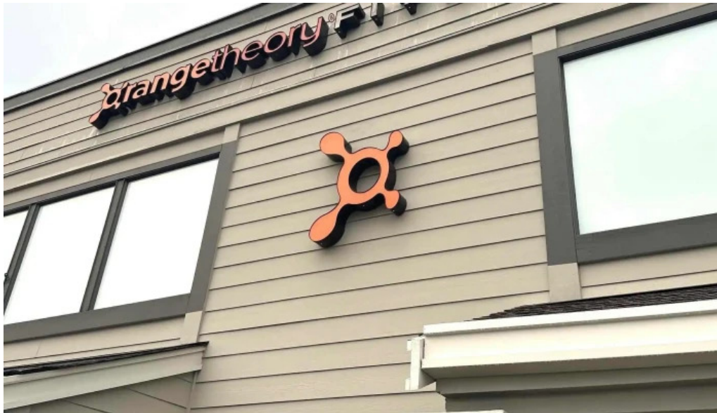
Orangetheory fitness gym