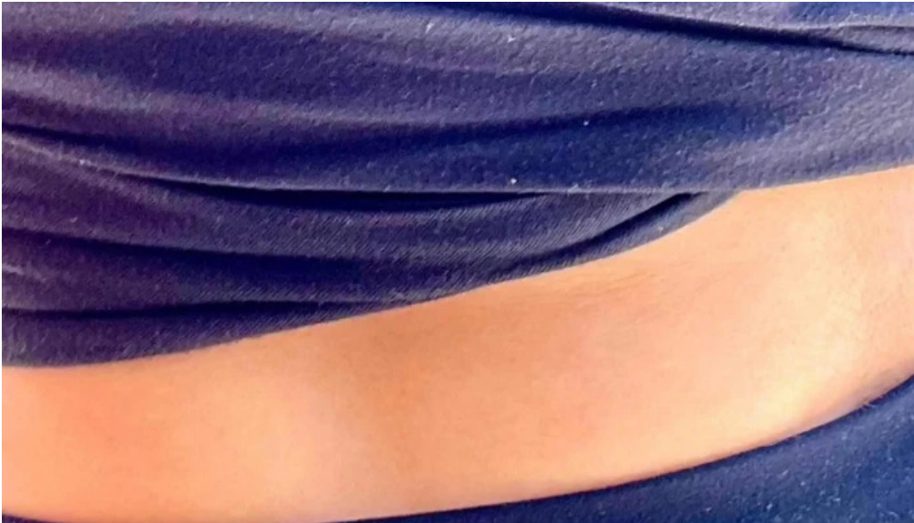
Orangetheory fitness reviews