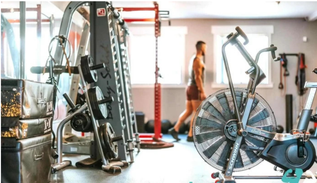
Studioflex exercise machine