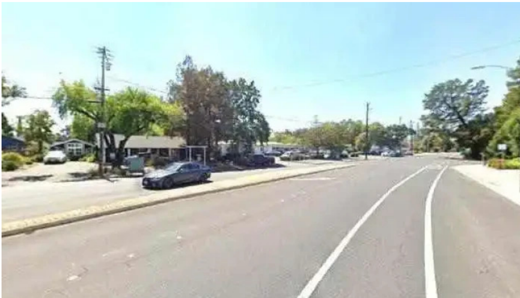
Studioflex street view 360deg