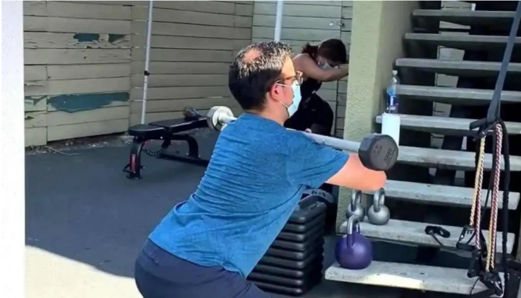
Studioflex by owner