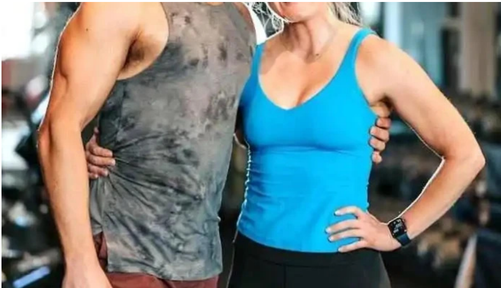
Studioflex pleasant hill