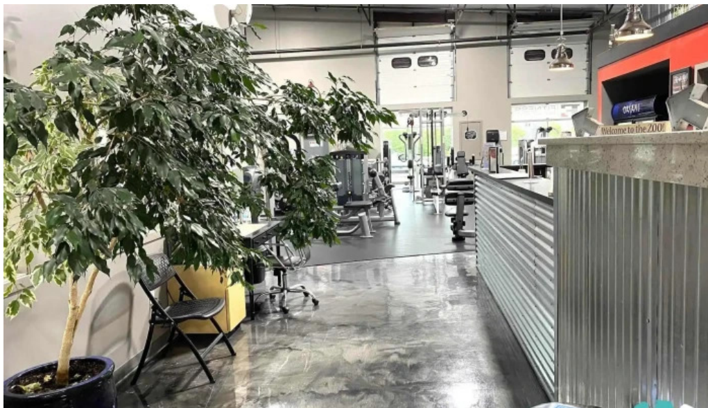
Fitness elevations by owner