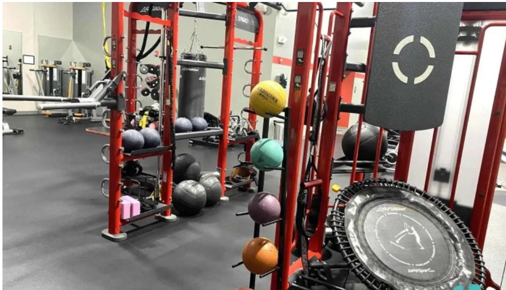
Fitness elevations gym