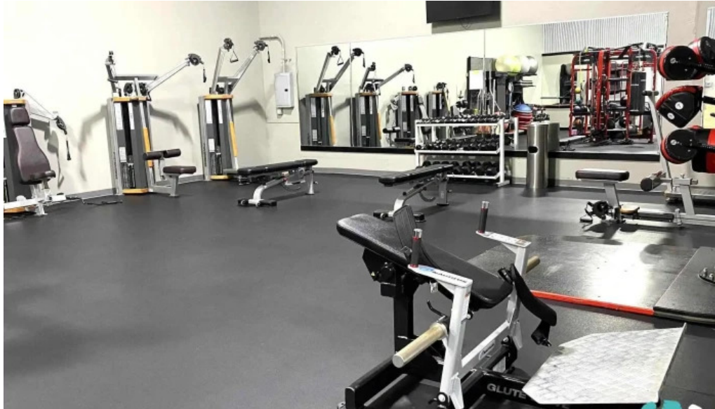
Fitness elevations all