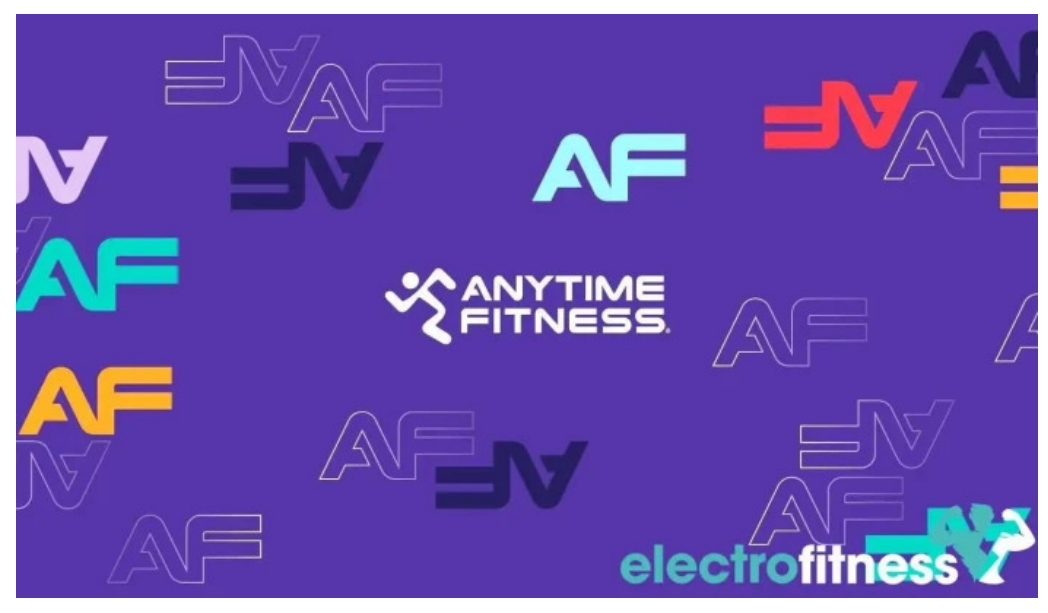
Anytime fitness all