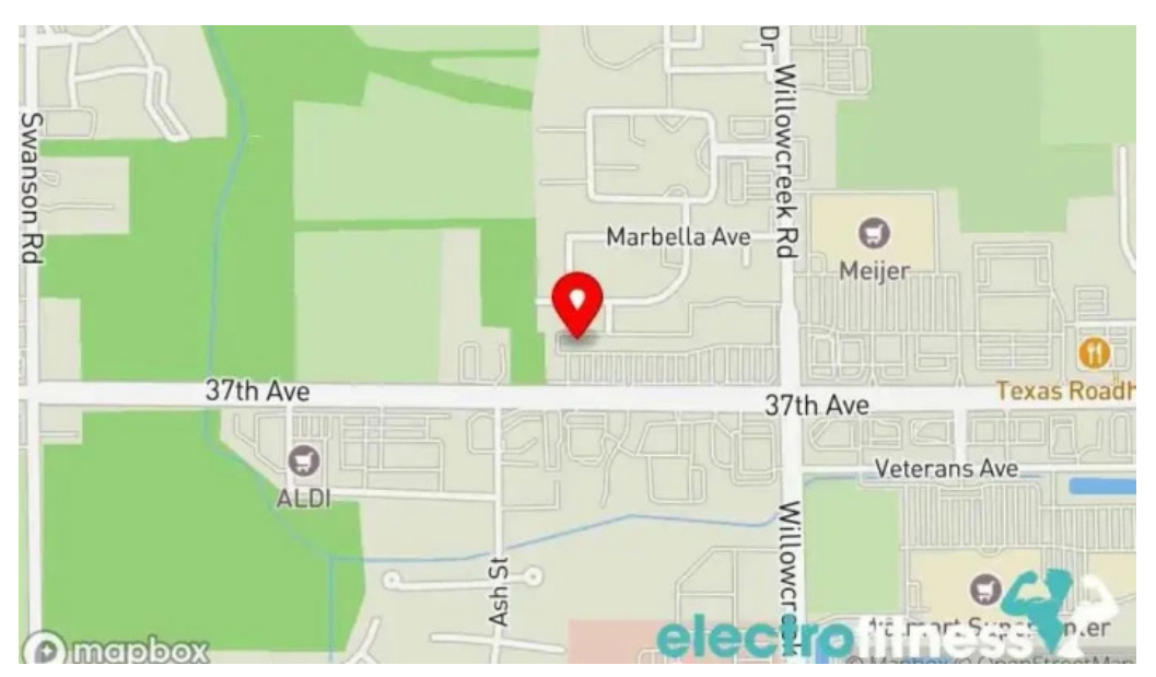
Anytime fitness map