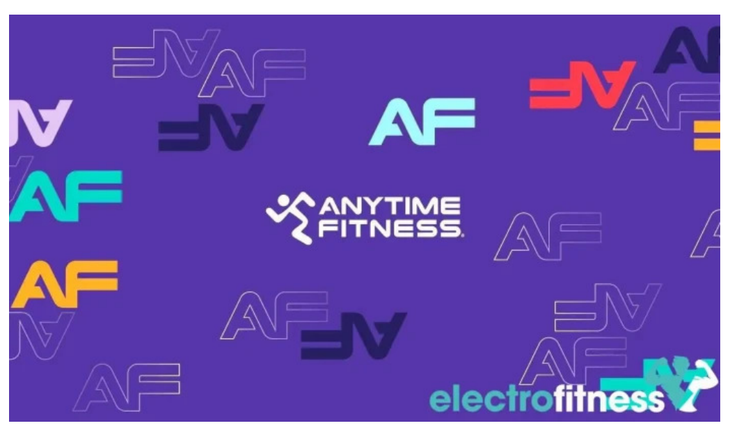
Anytime fitness portage