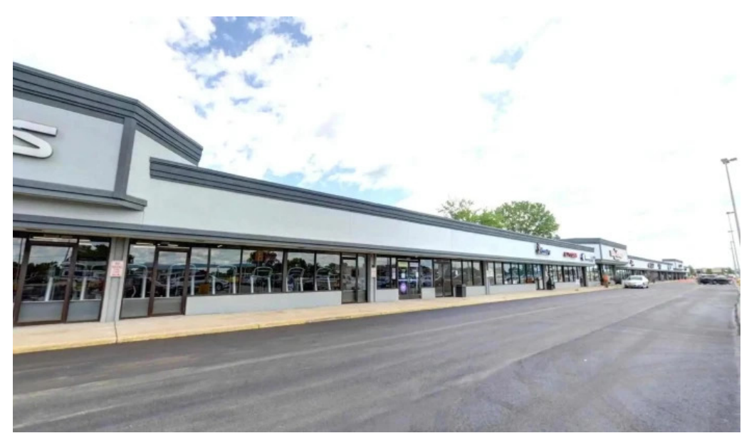
Anytime fitness street view 360