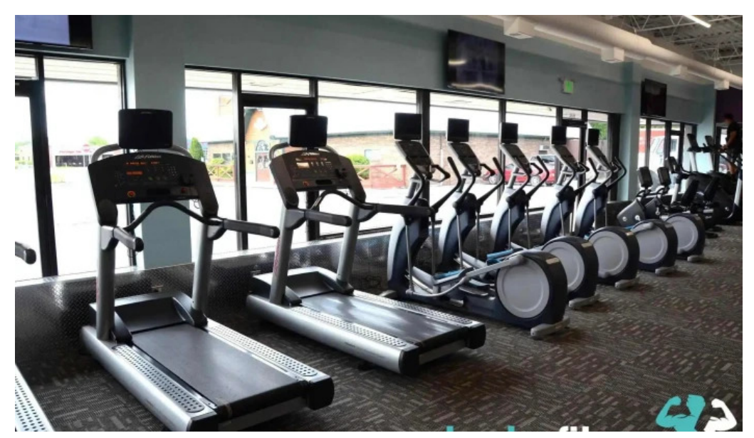
Anytime fitness gym