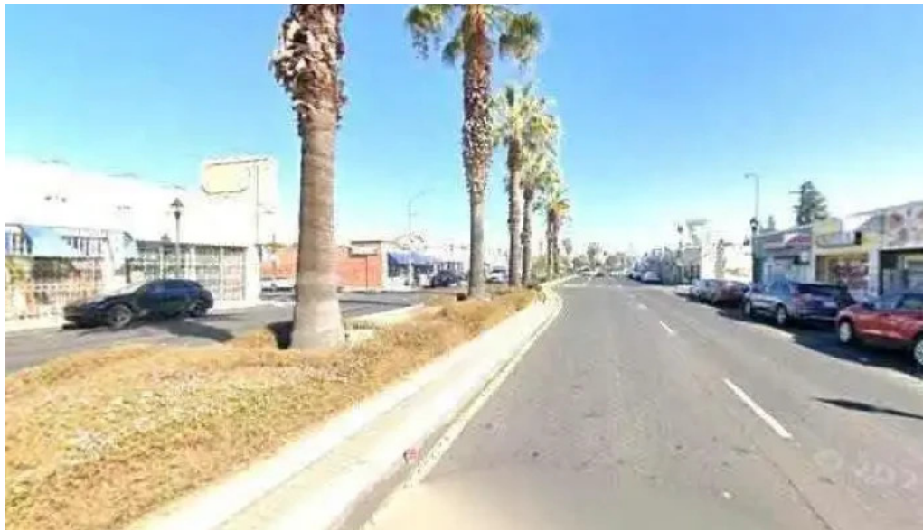
Brick house fitness street view 360deg