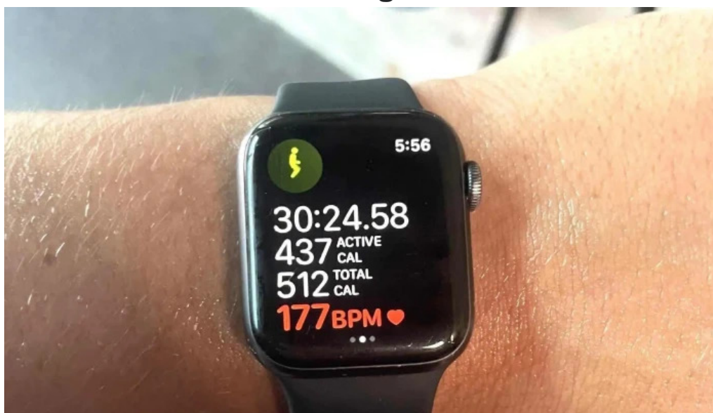
Brick house fitness where