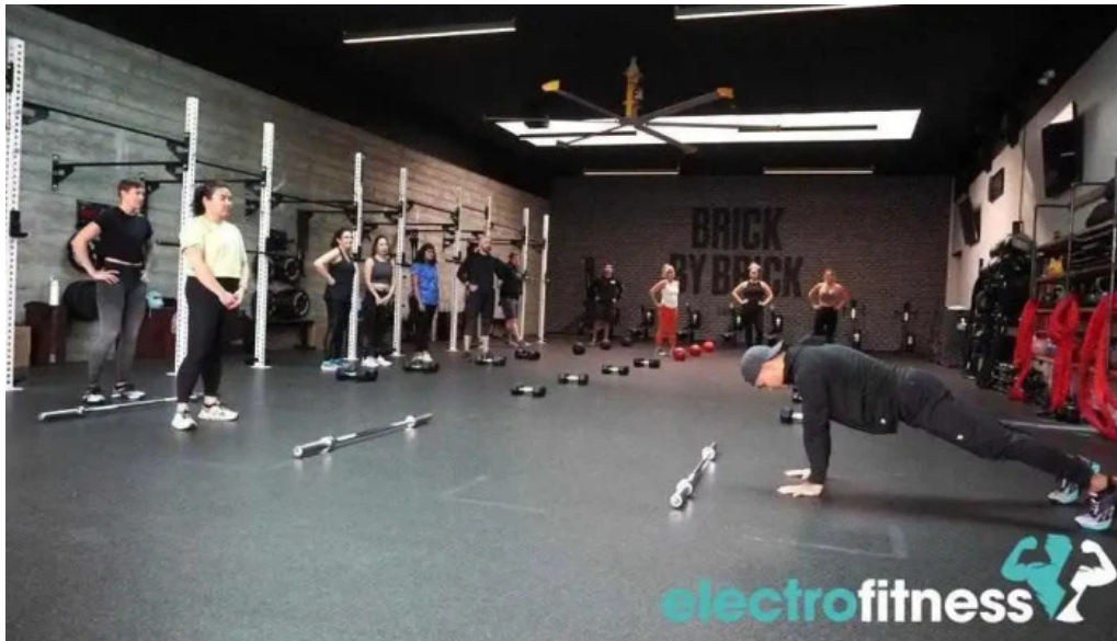
Brick house fitness all