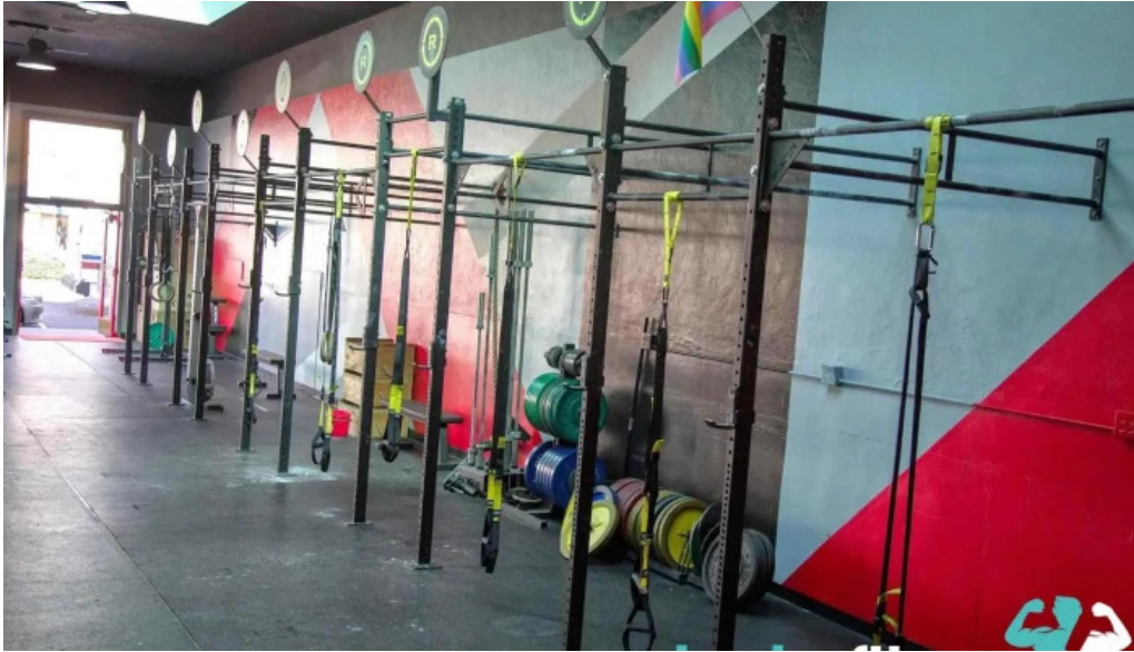
Brick house fitness by owner