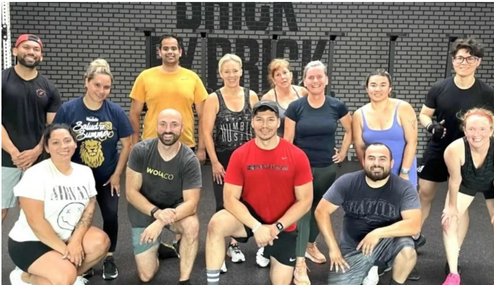
Brick house fitness area