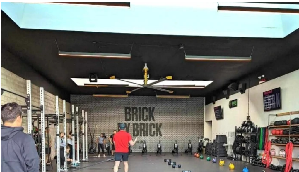
Brick house fitness gym