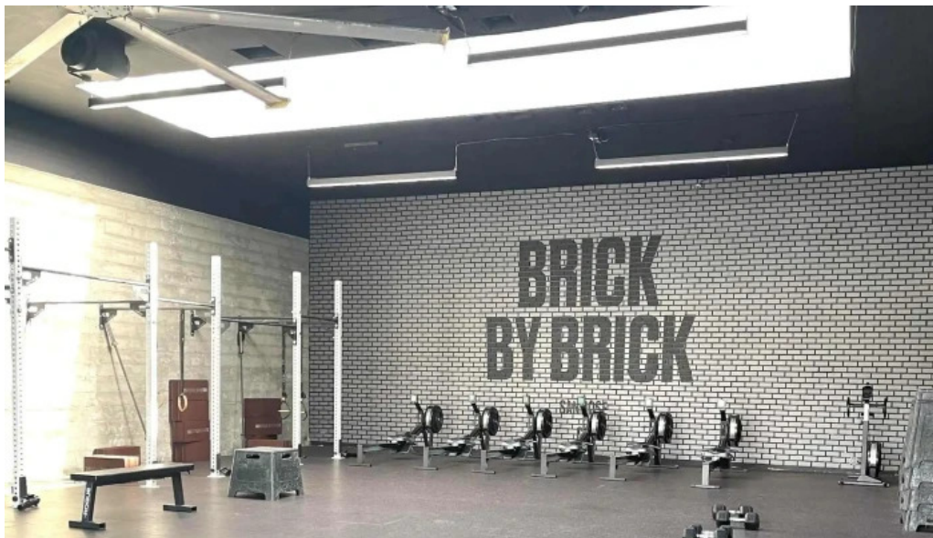
Brick house fitness san jose