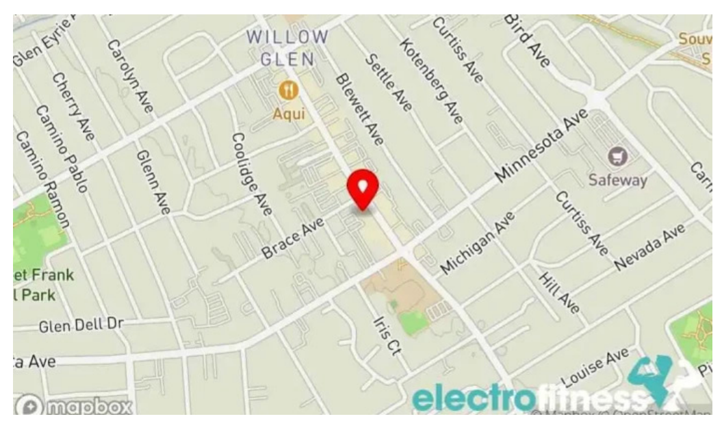
Orangetheory fitness map