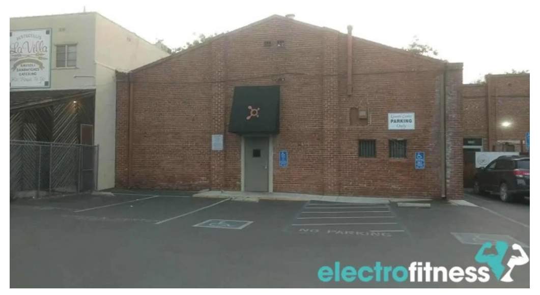
Orangetheory fitness videos