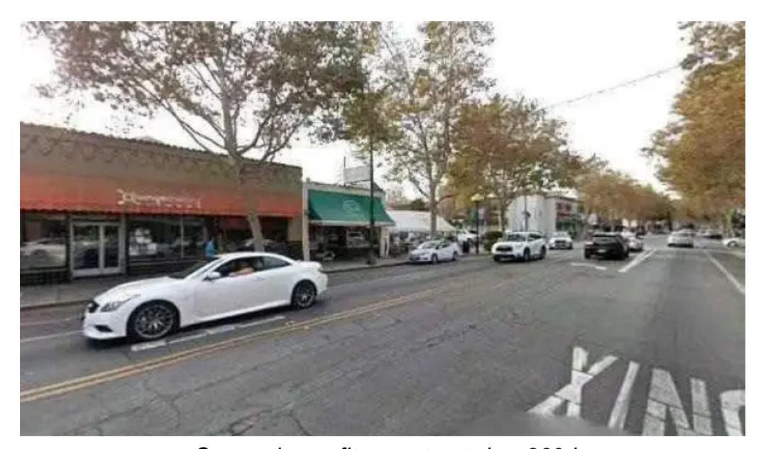
Orangetheory fitness street view 360deg