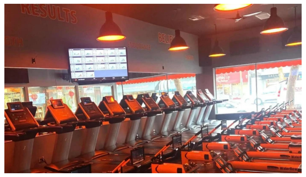
Orangetheory fitness san jose