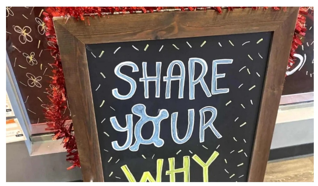
Orangetheory fitness gym