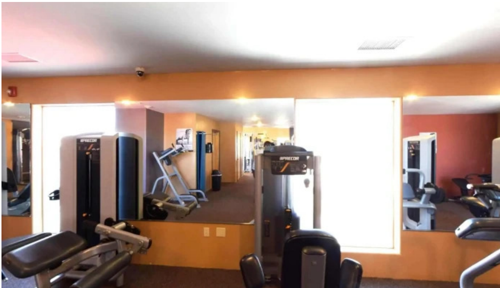
Anytime fitness gym