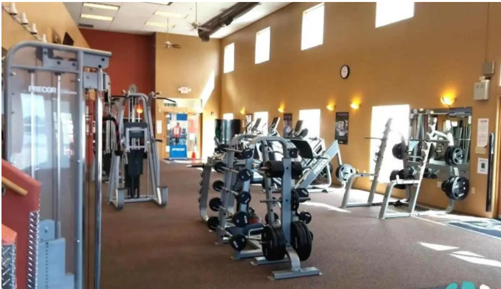
Anytime fitness santa fe