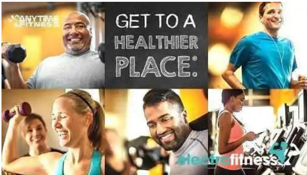
Anytime fitness by owner