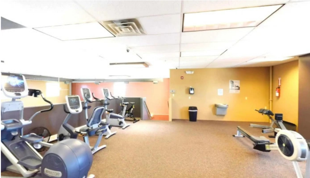
Anytime fitness street view 360deg