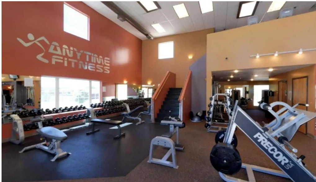
Anytime fitness exercise machine