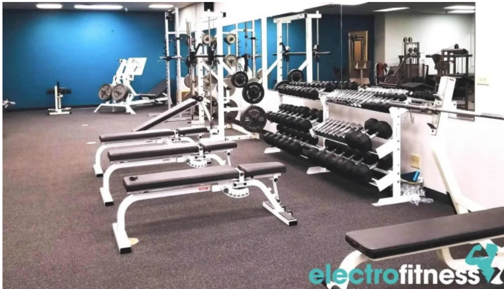
Santa fe health fitness gym