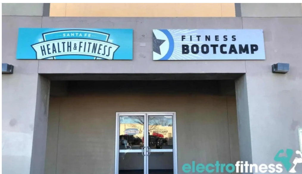
Santa fe health fitness all