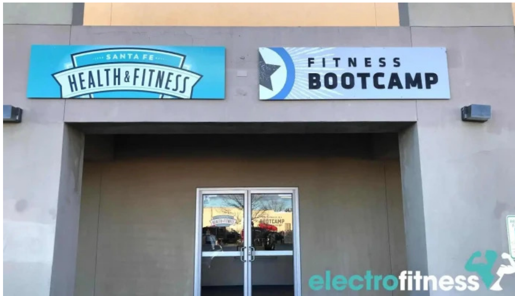
Santa fe health fitness santa fe