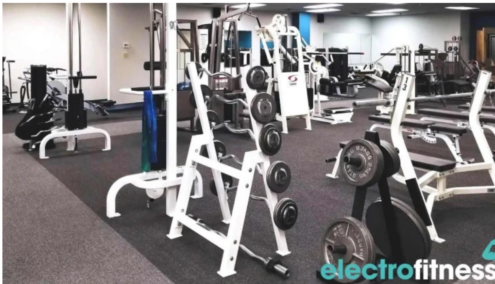
Santa fe health fitness by owner