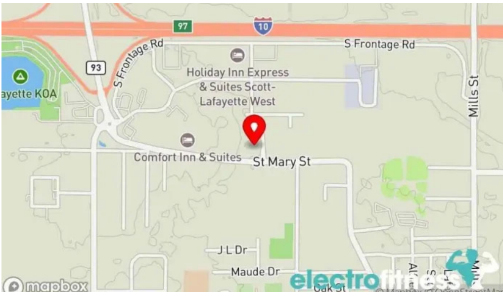
Anytime fitness map