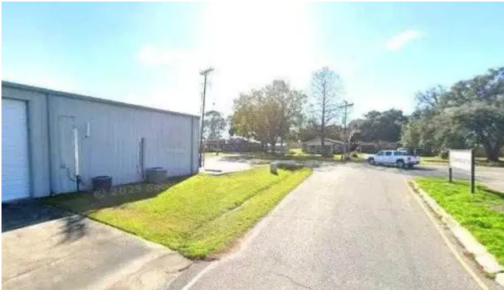
Anytime fitness street view 360deg