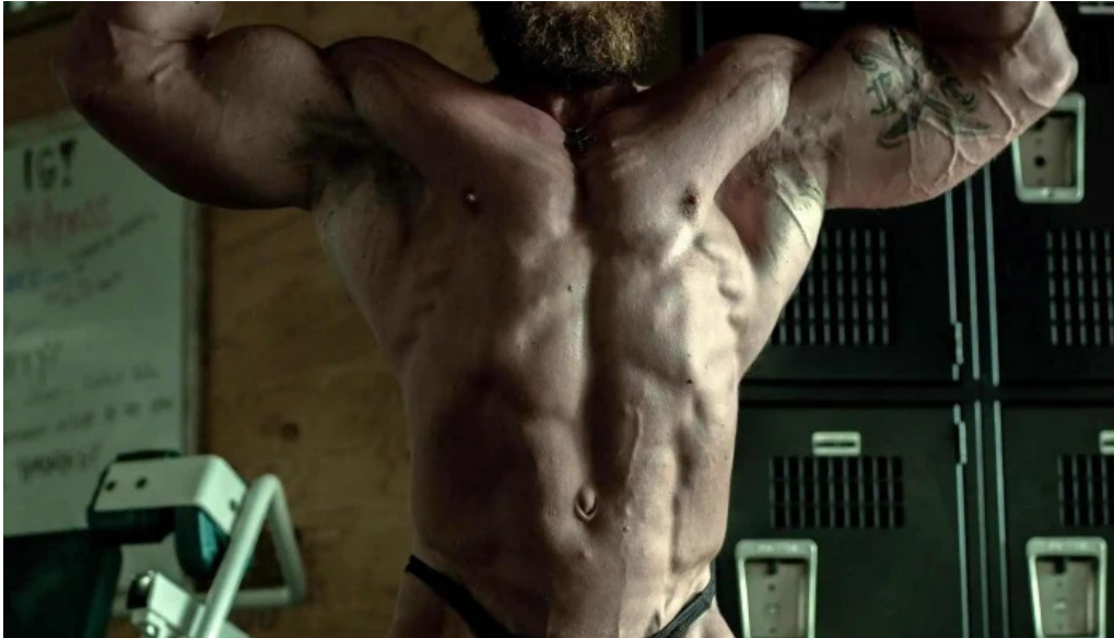
Fully charged fitness selah