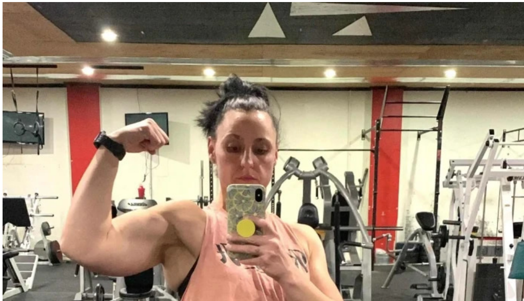
Fully charged fitness website