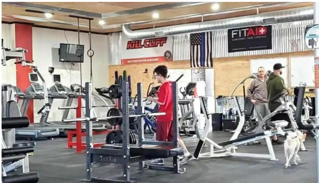
Fully charged fitness all