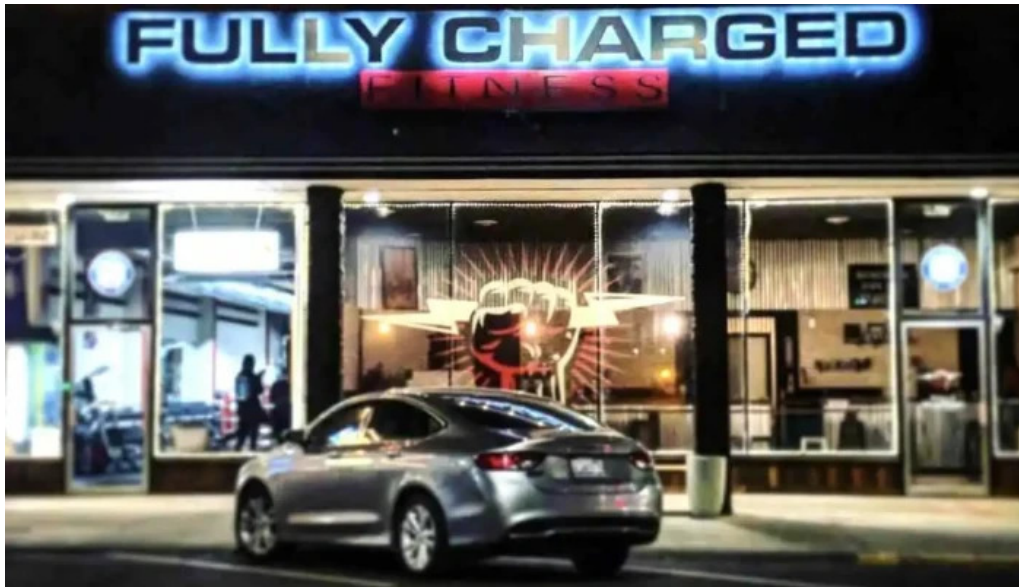
Fully charged fitness by owner