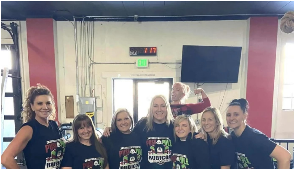
Fully charged fitness schedule