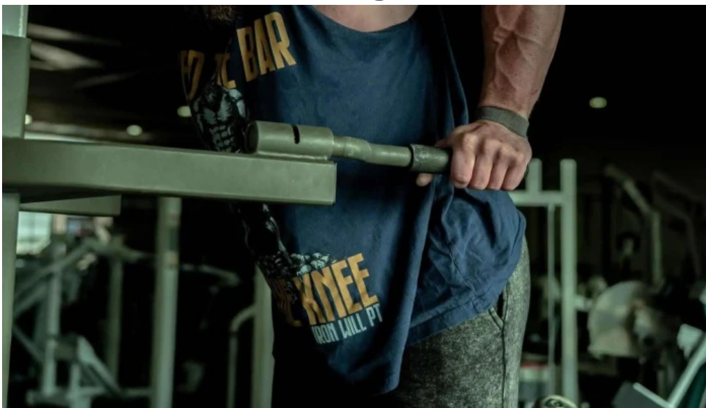
Fully charged fitness where