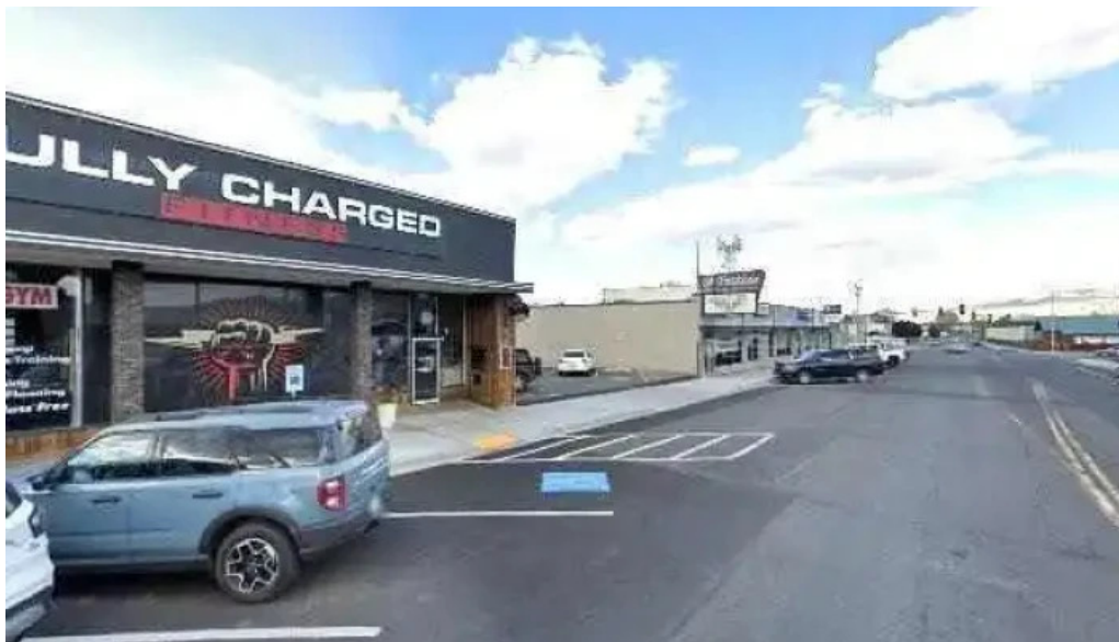
Fully charged fitness street view 360deg