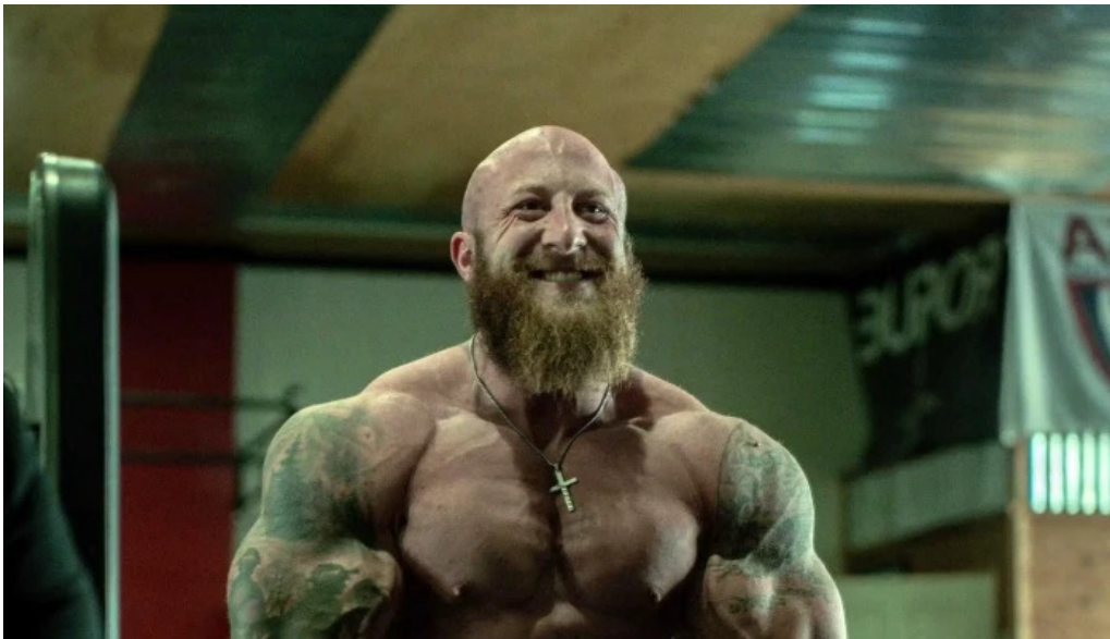
Fully charged fitness near me