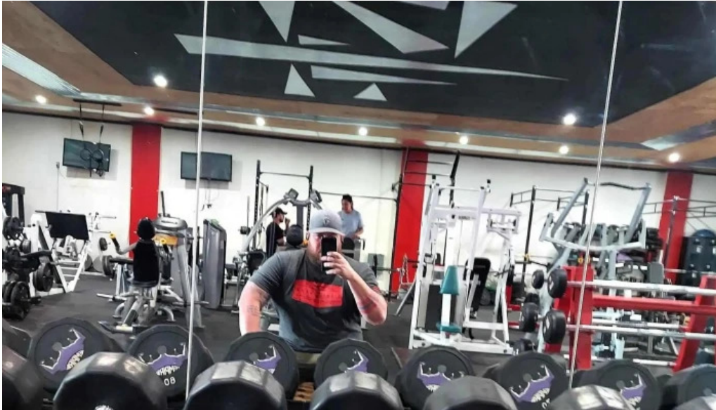
Fully charged fitness promotion