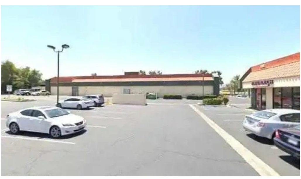
Matador nutrition training IIc all