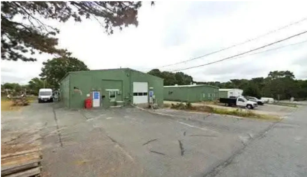
Crossfit bass river street view 360deg