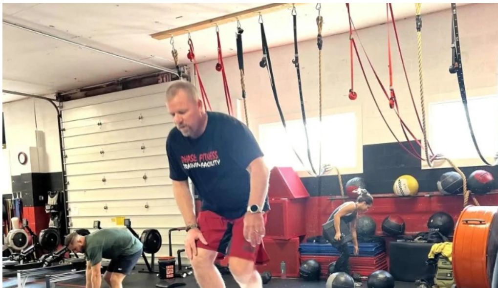
Crossfit bass river schedule