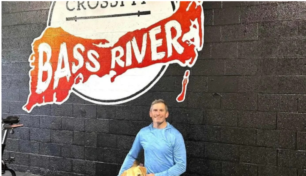
Crossfit bass river all