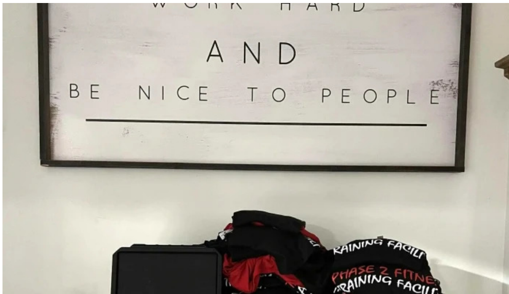
Crossfit bass river south yarmouth