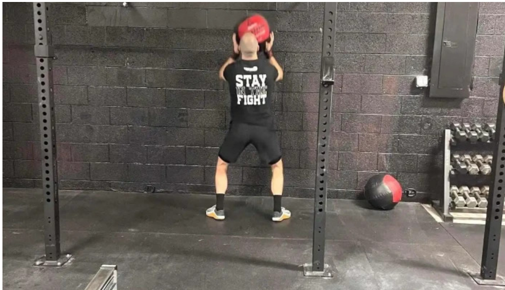
Crossfit bass river by owner