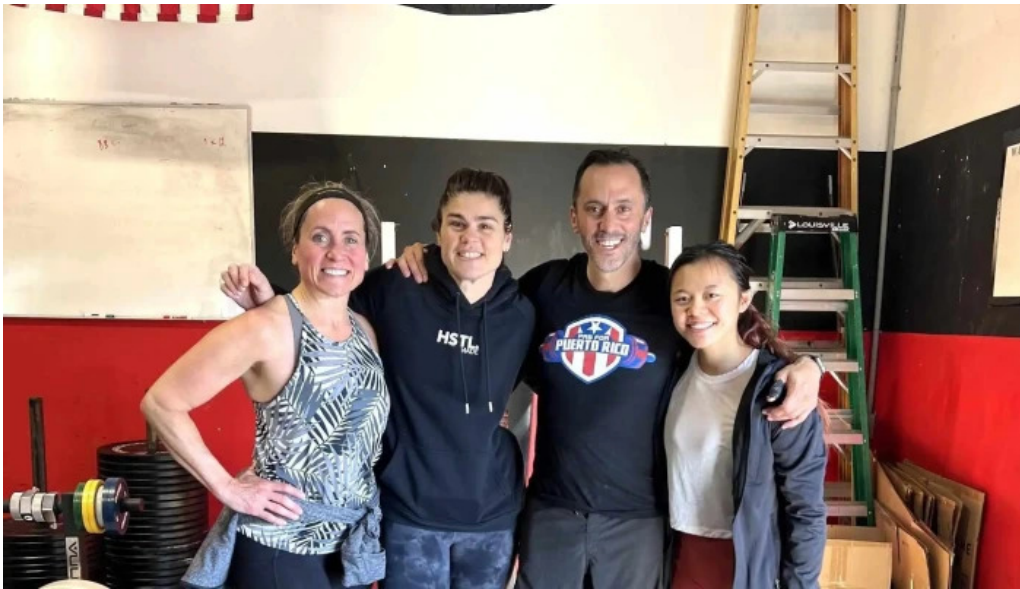
Crossfit bass river gym