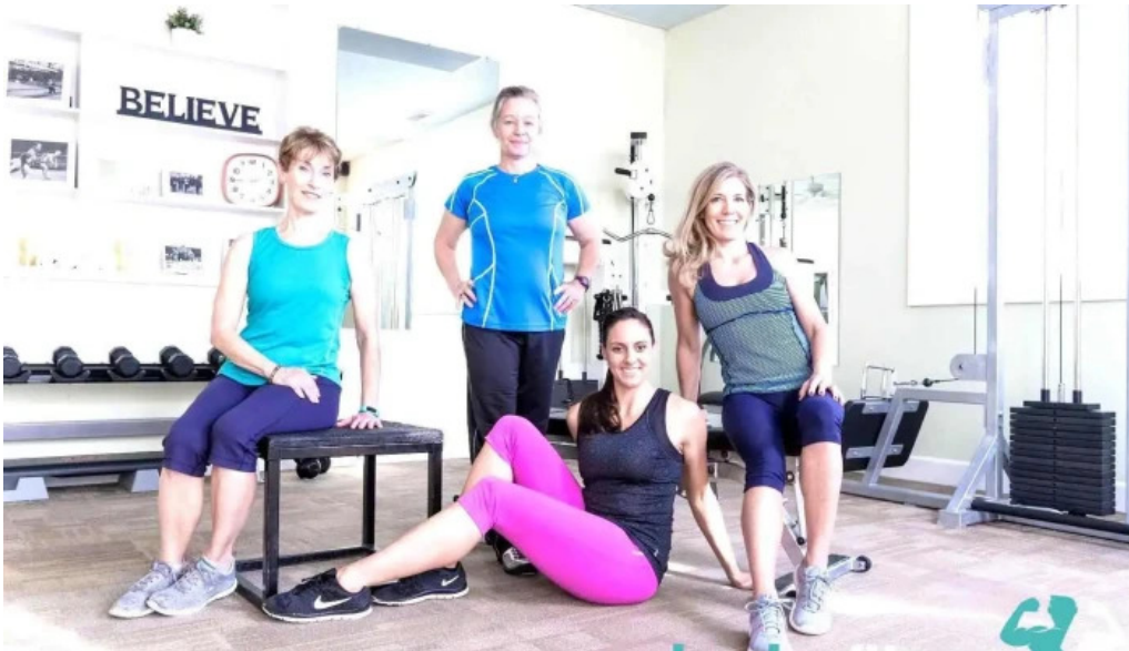
The fitness studio inc southern pines