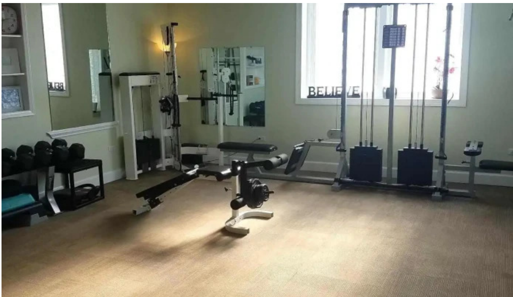
The fitness studio inc by owner