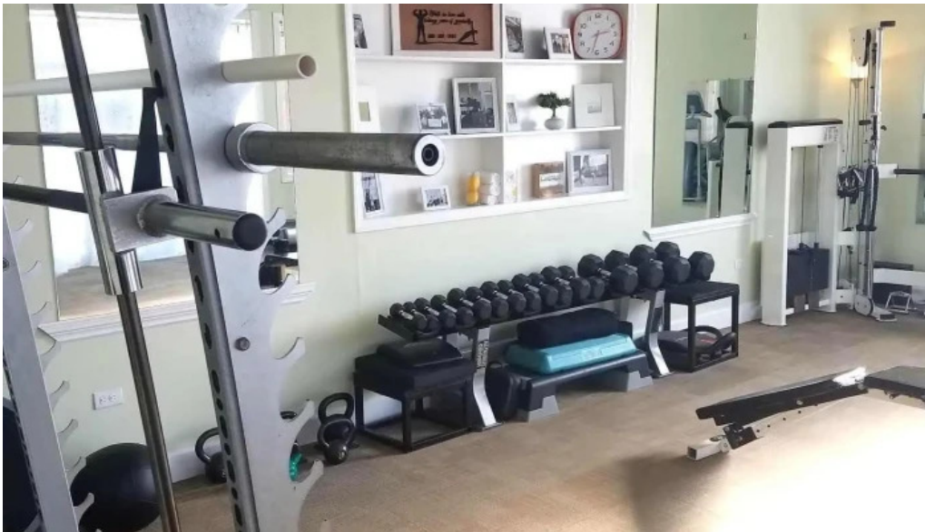
The fitness studio inc gym