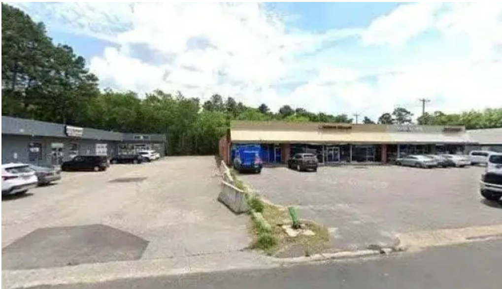
The fitness studio inc street view 360