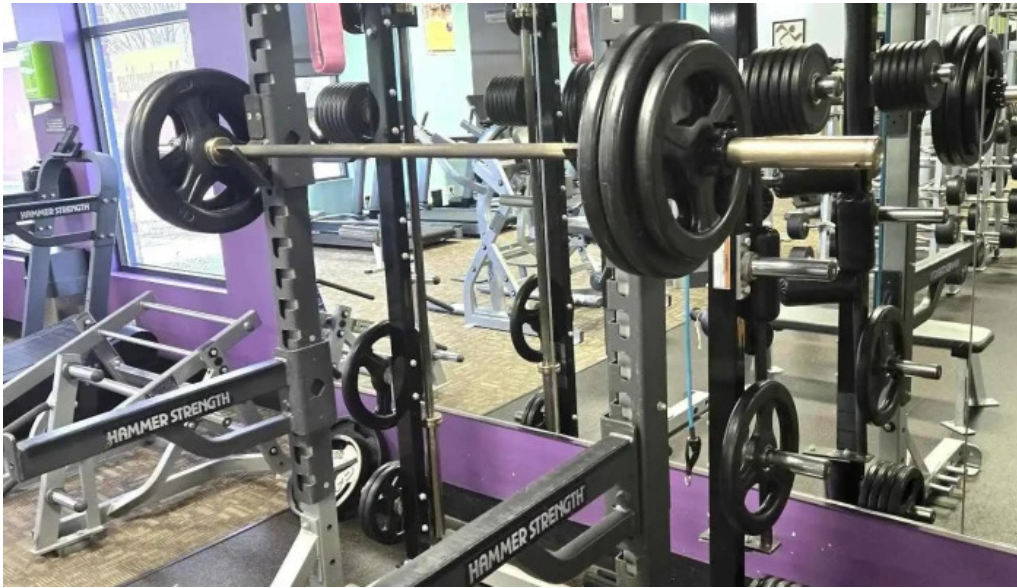
Anytime fitness all