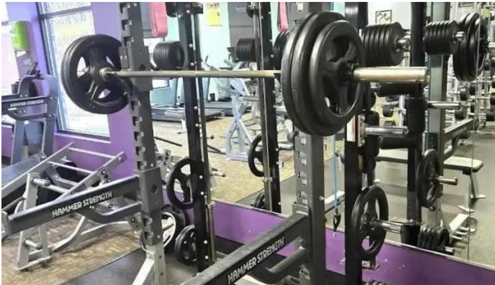
Anytime fitness st john