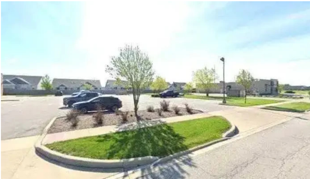
Anytime fitness street view 360