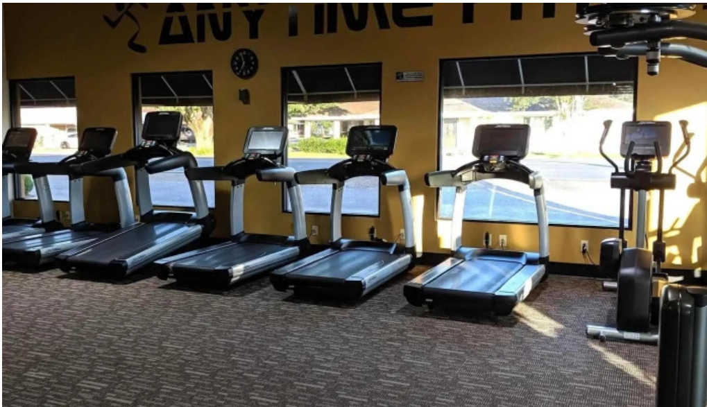
Anytime fitness st martinville