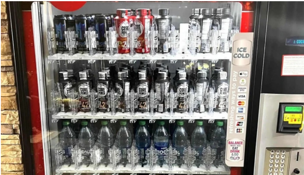
Anytime fitness location