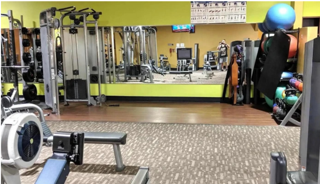
Anytime fitness discounts