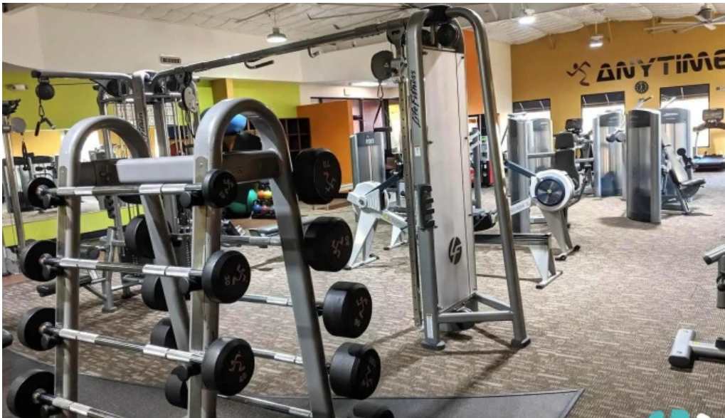
Anytime fitness exercise machine