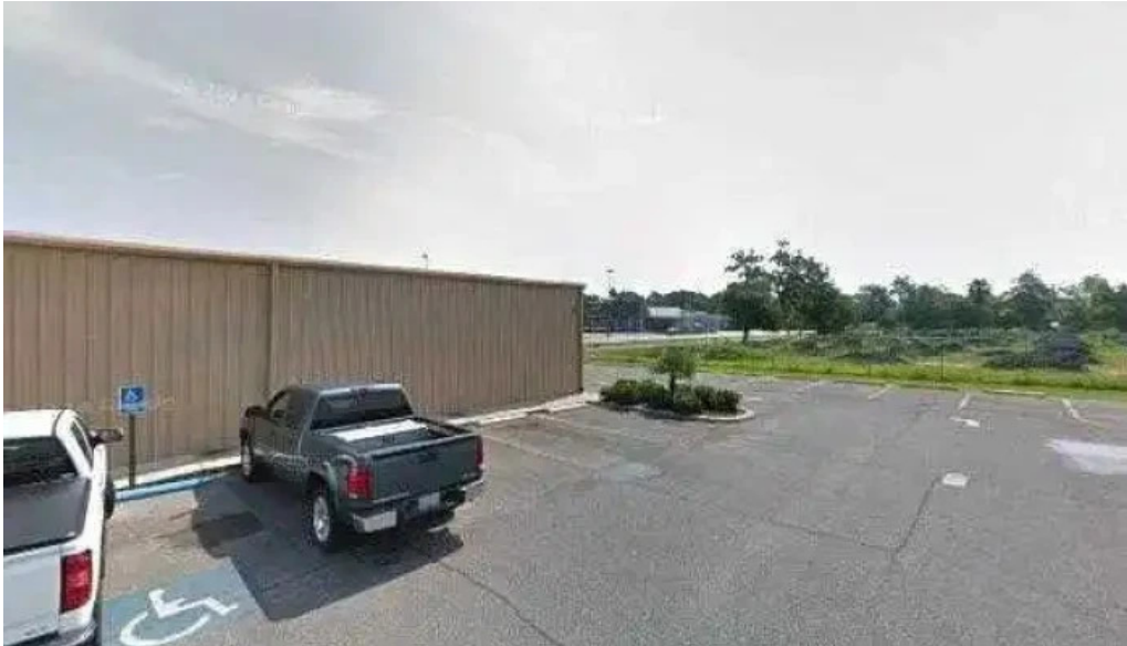
Anytime fitness street view 360deg