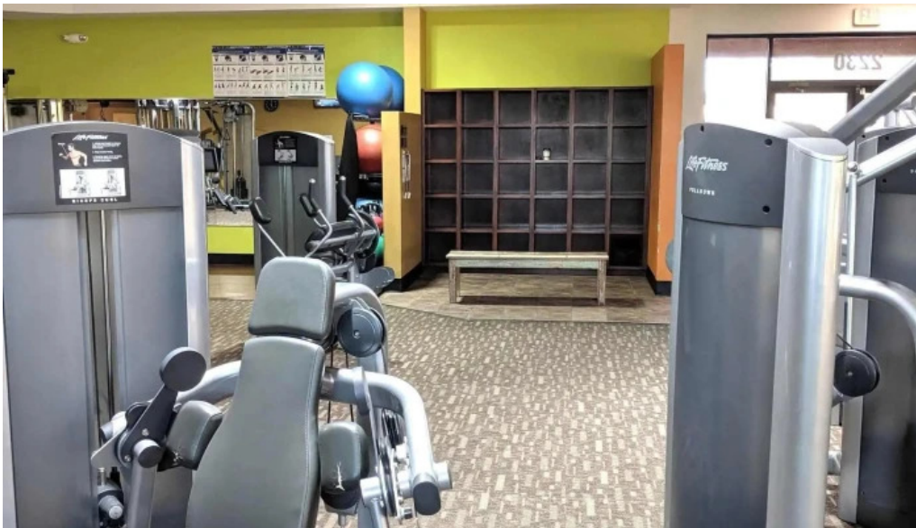
Anytime fitness gym