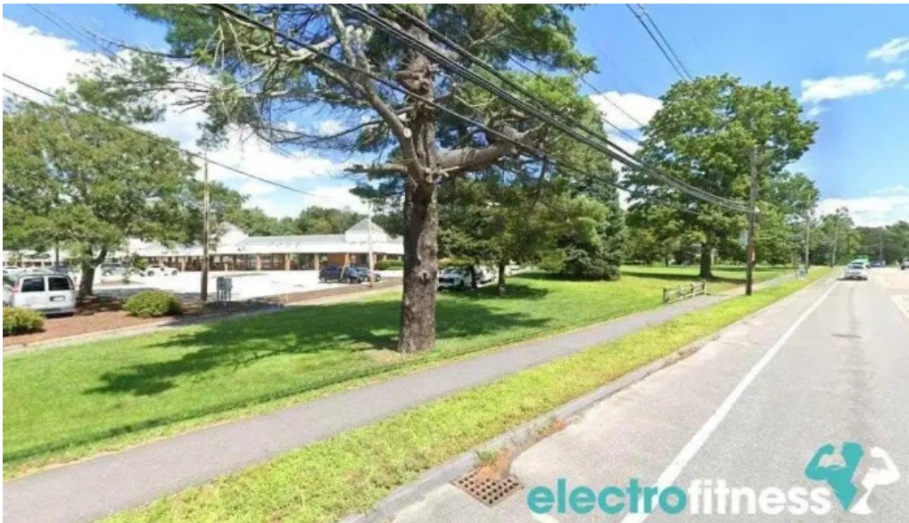
Stow fitness center stow