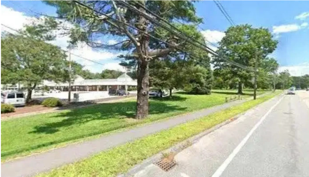
Stow fitness center all