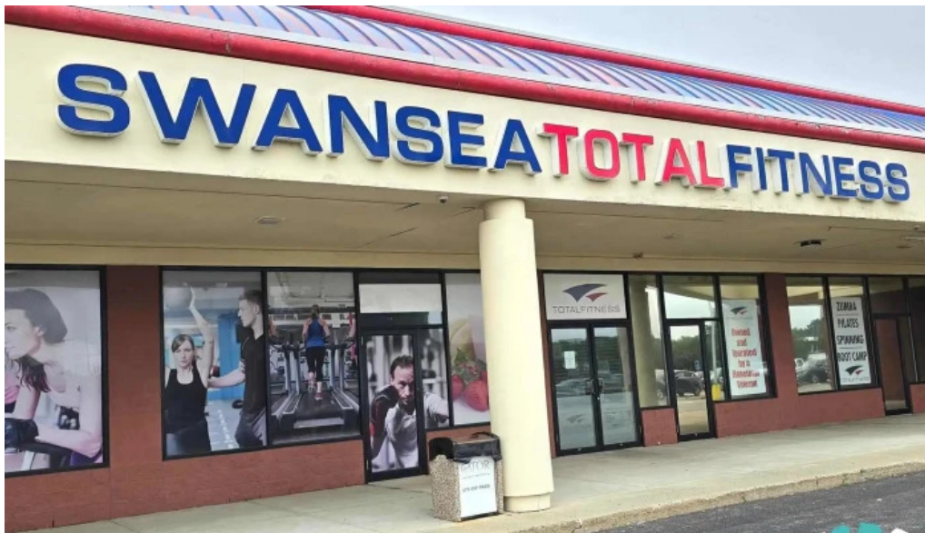
Swansea total fitness all