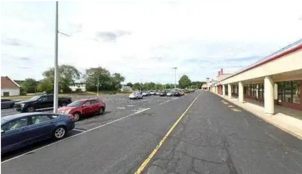
Swansea total fitness street view 360deg