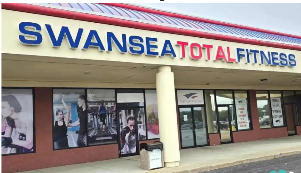
Swansea total fitness swansea