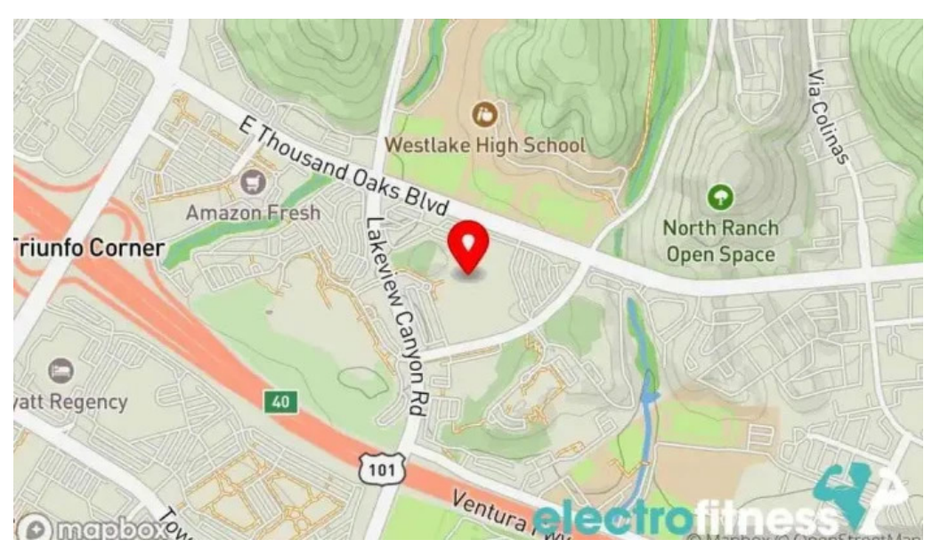
Equinox westlake village map