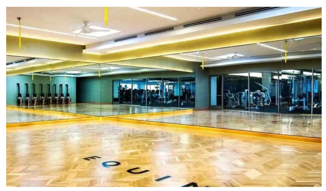
Equinox westlake village by owner