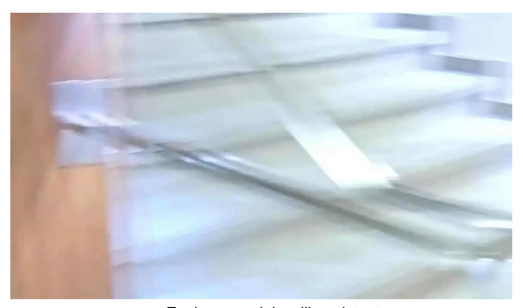
Equinox westlake village latest