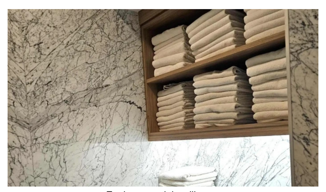
Equinox westlake village area