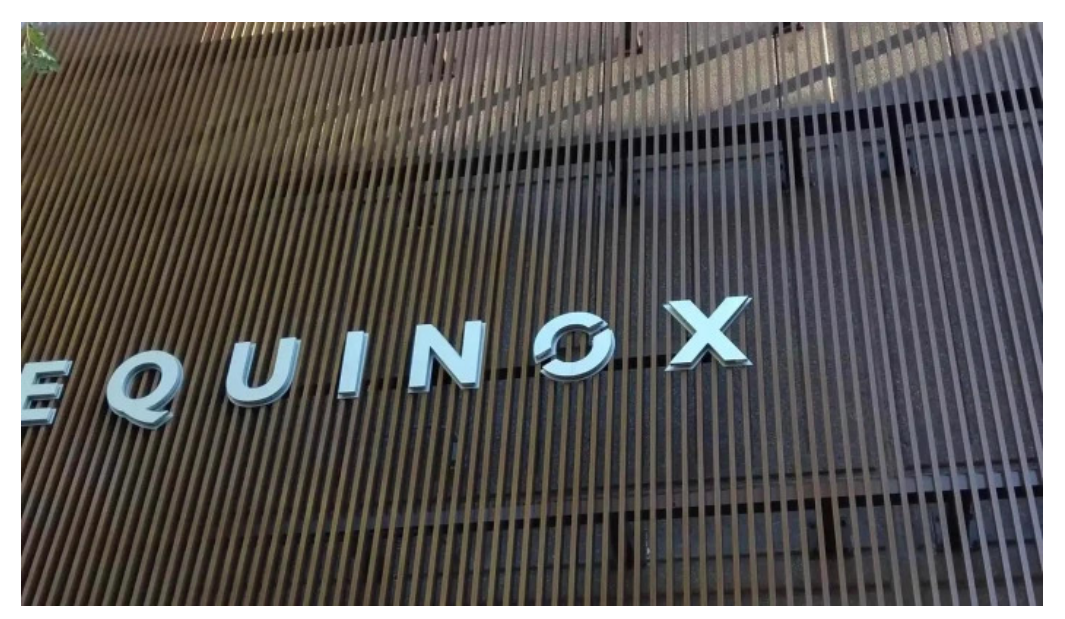
Equinox westlake village near me