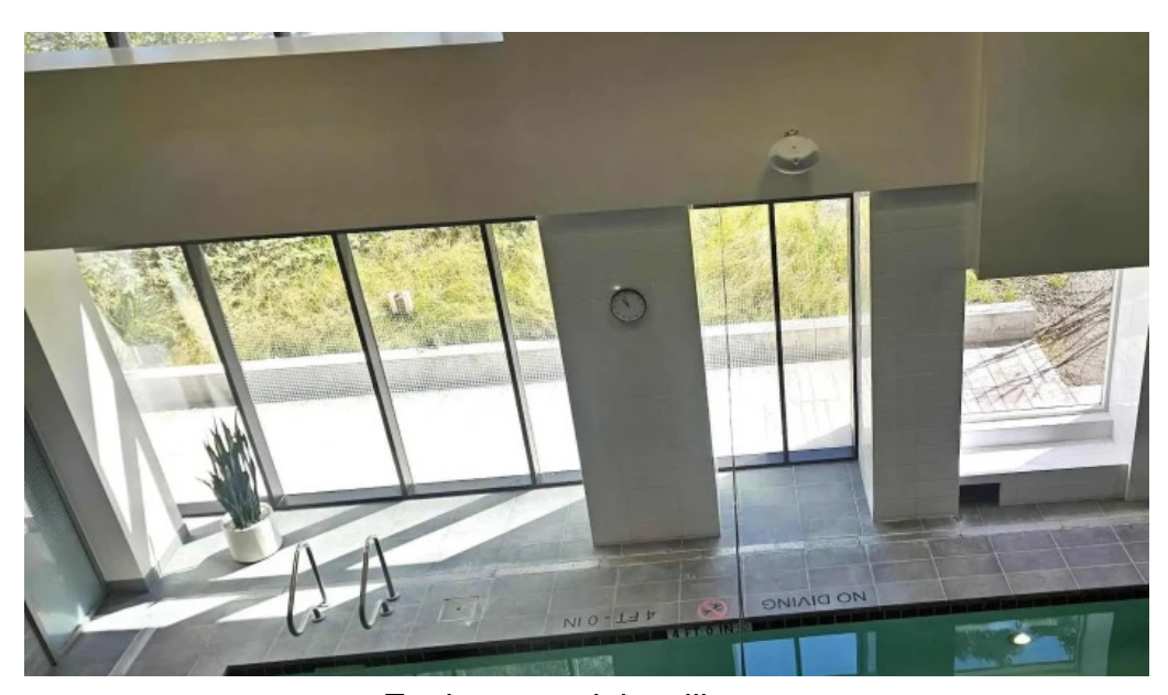
Equinox westlake village gym