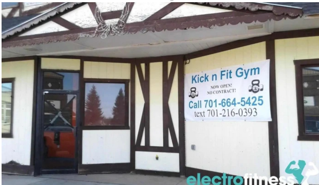
Kick n fit gym tioga