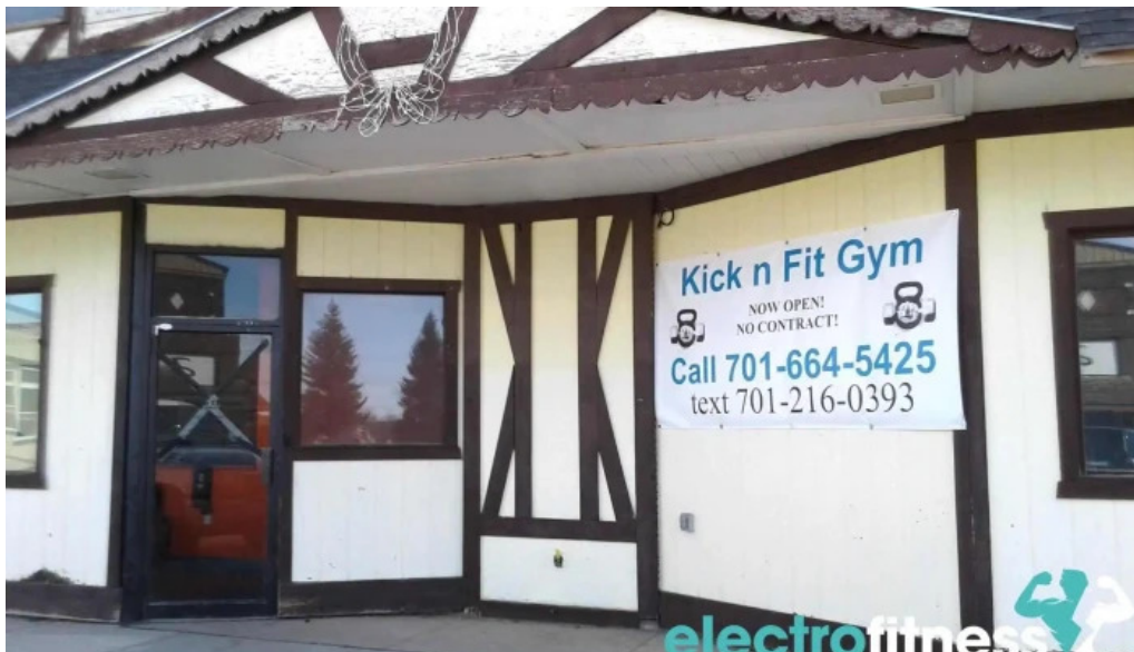
Kick n fit gym all