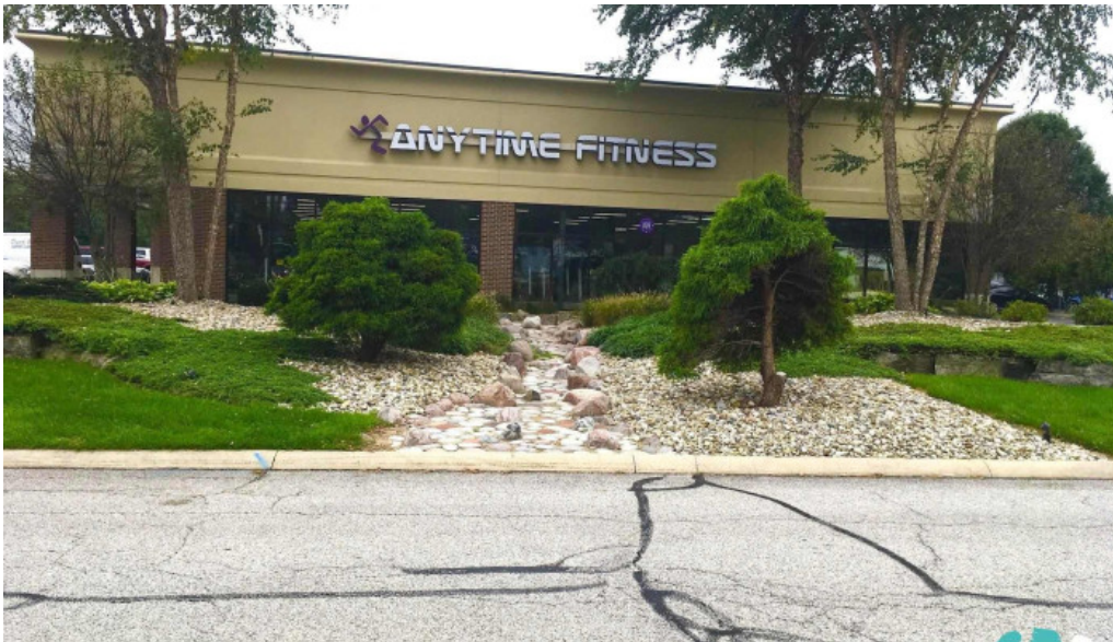
Anytime fitness all