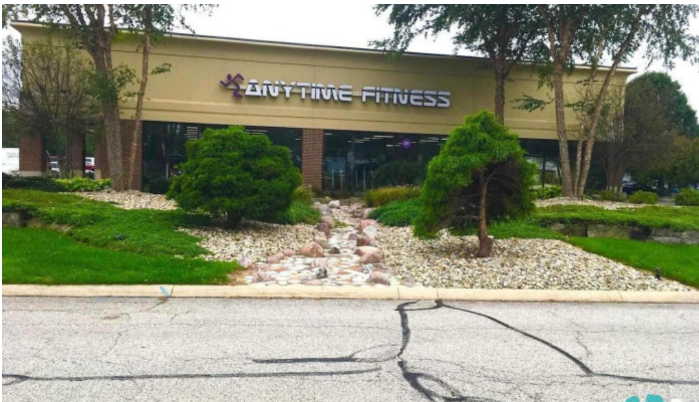
Anytime fitness valparaiso