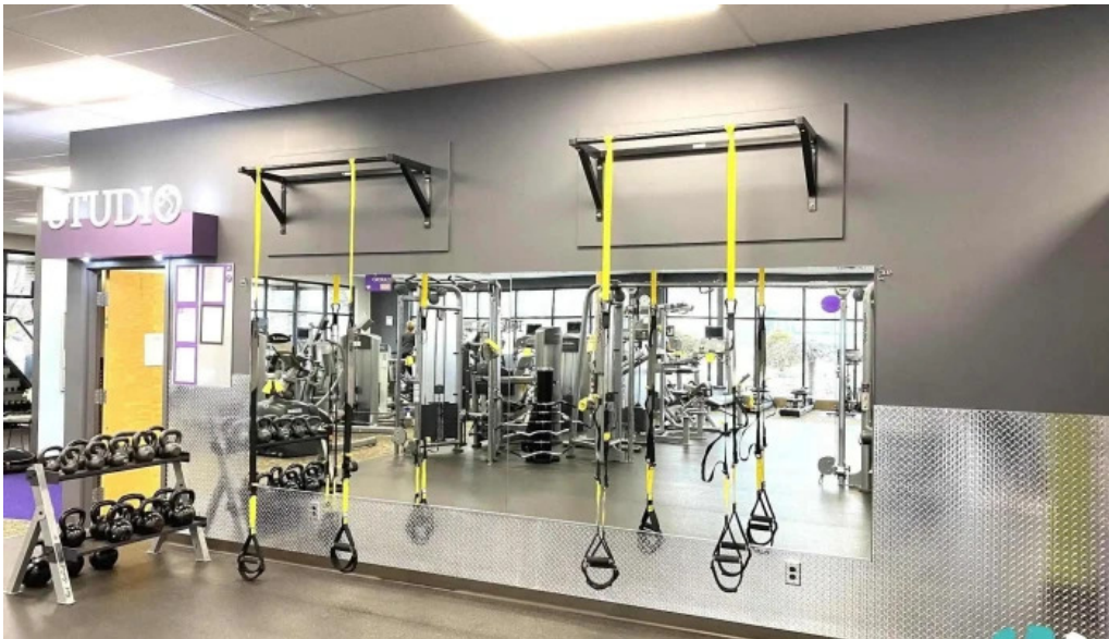
Anytime fitness gym