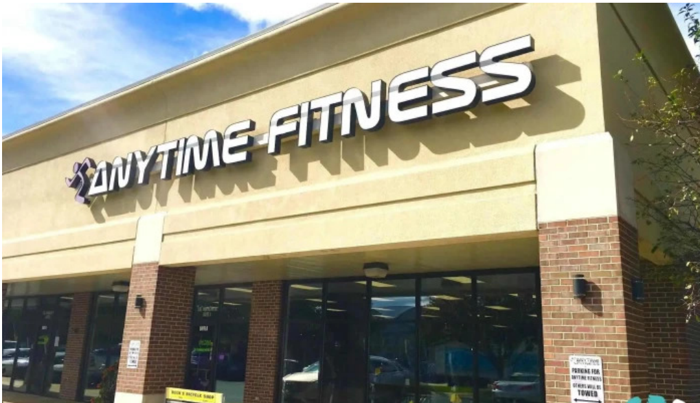
Anytime fitness by owner