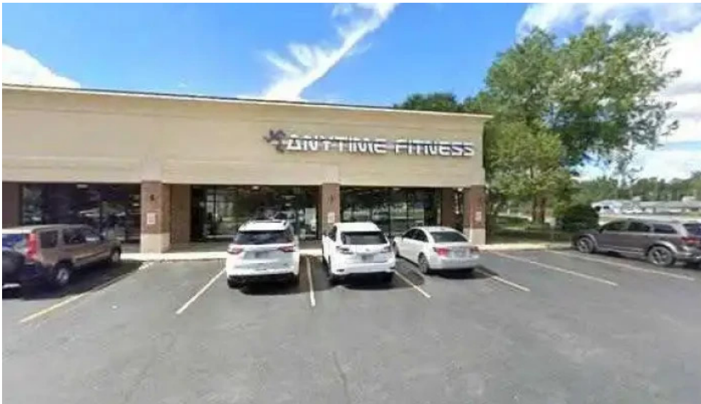
Anytime fitness street view 360