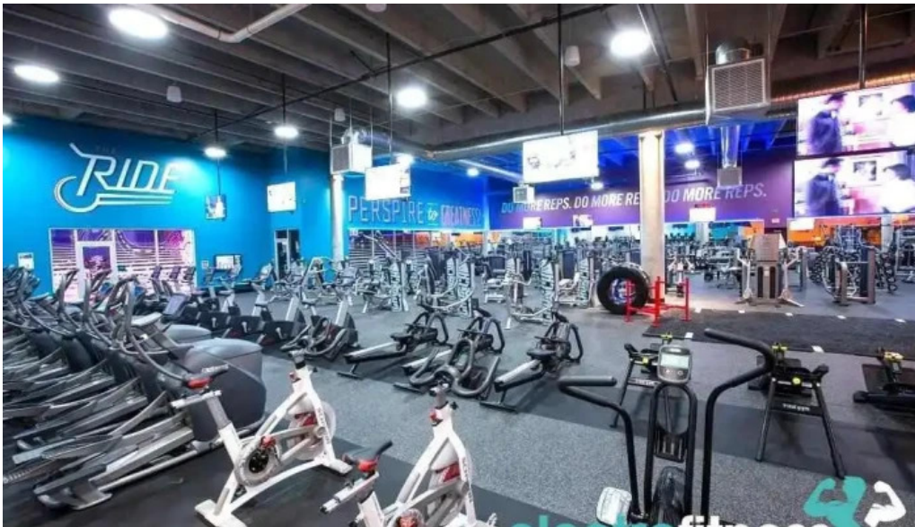
Crunch fitness walnut creek gym