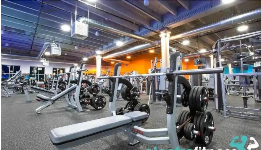
Crunch fitness walnut creek all