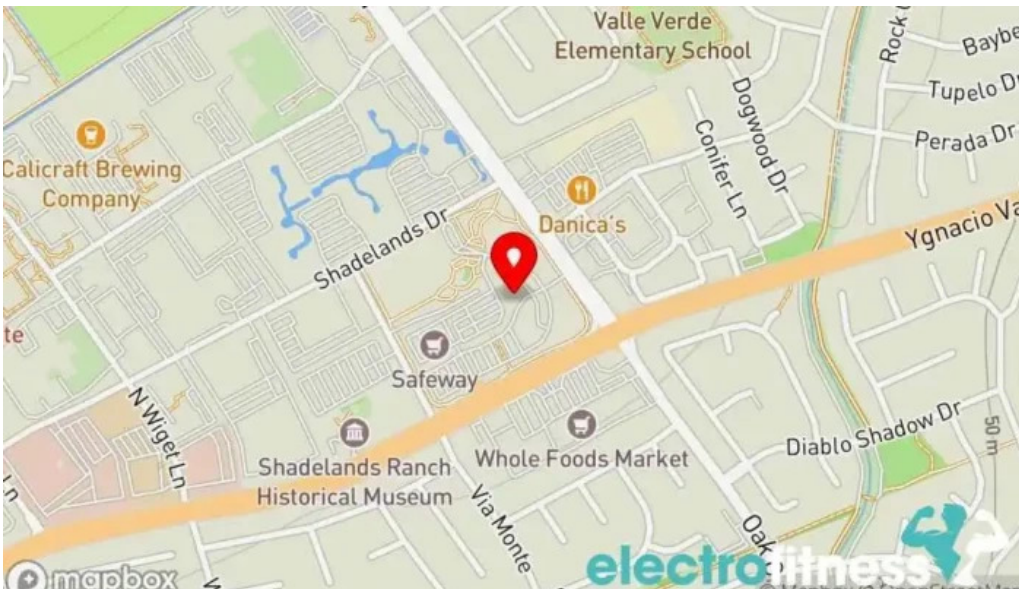
Crunch fitness walnut creek map