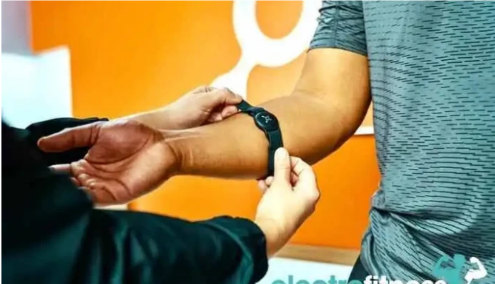
Orangetheory fitness by owner