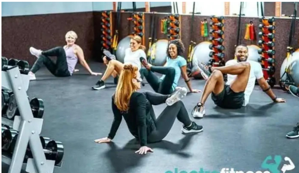
Orangetheory fitness gym