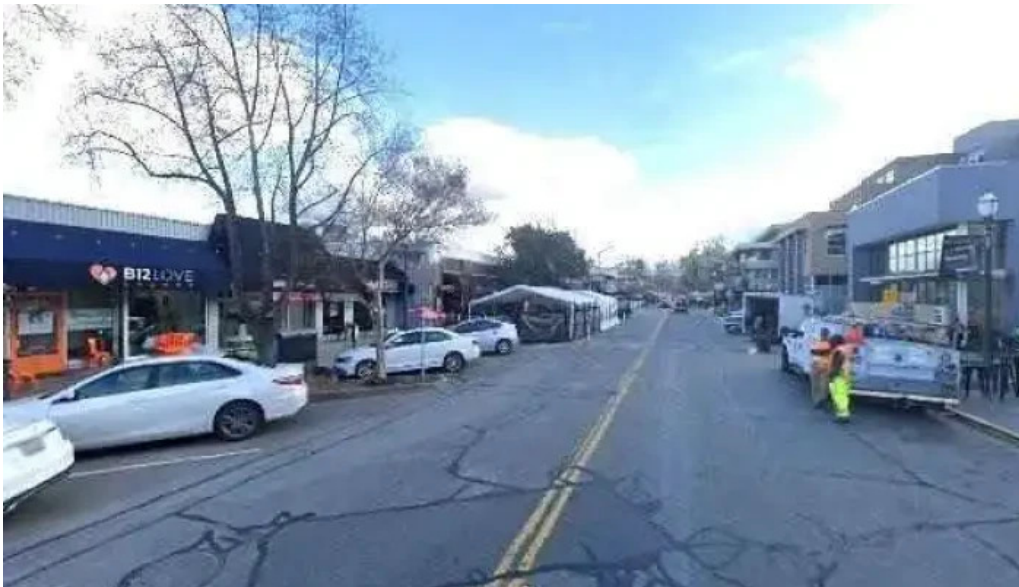
Orangetheory fitness street view 360deg