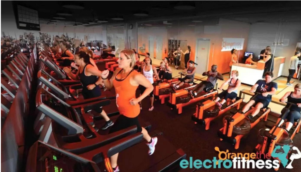
Orangetheory fitness walnut creek