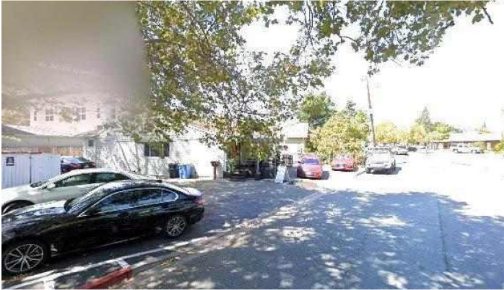
Perpetual motion street view 360deg