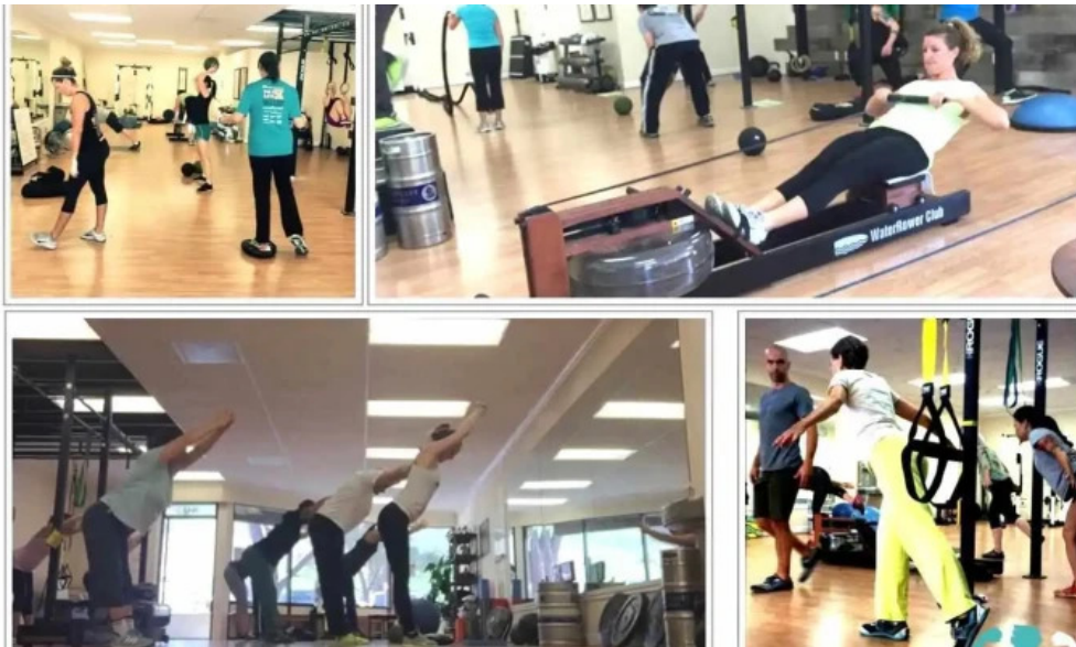
Perpetual motion all