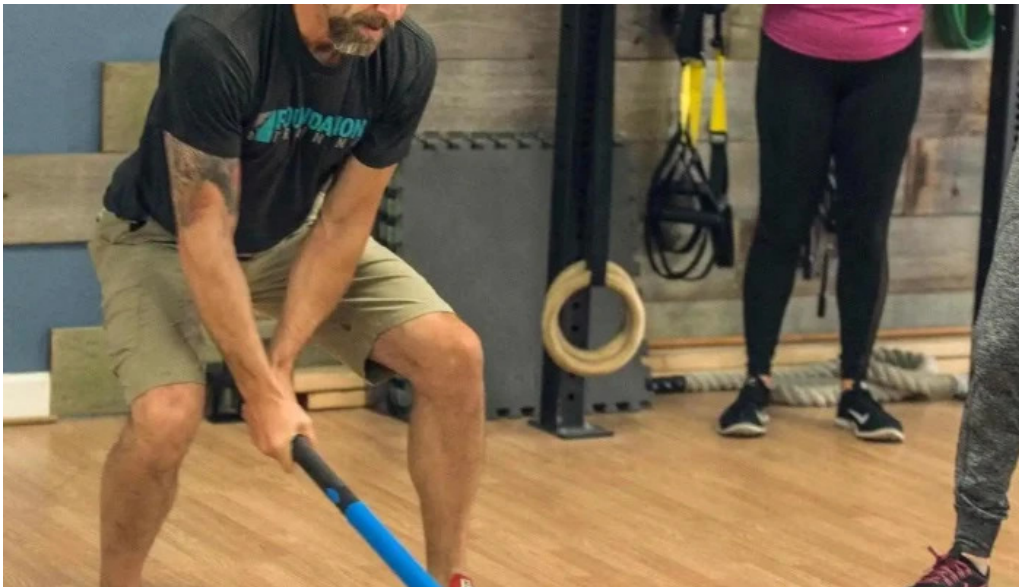
Perpetual motion by owner