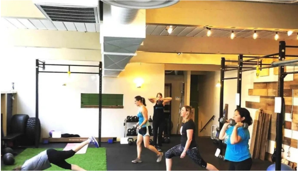
Perpetual motion gym