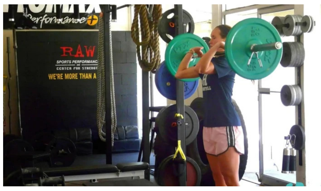
Raw sports performance all