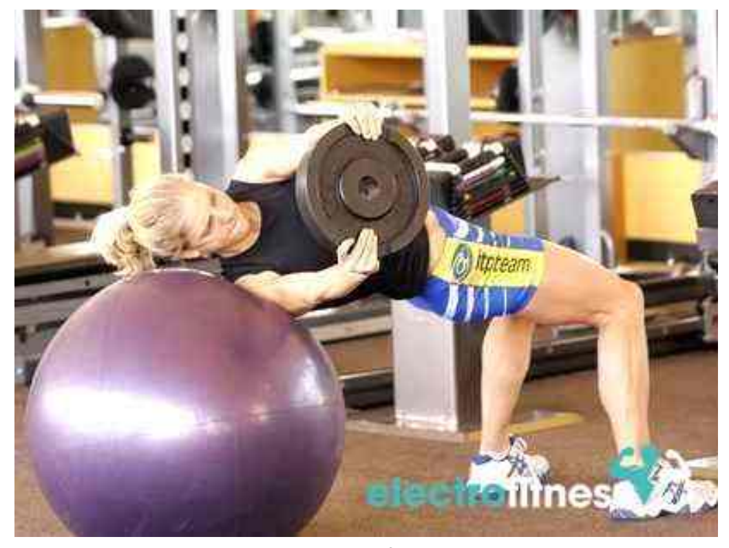
Raw sports performance gym