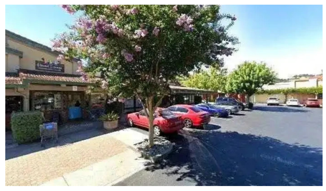
Raw sports performance street view 360deg