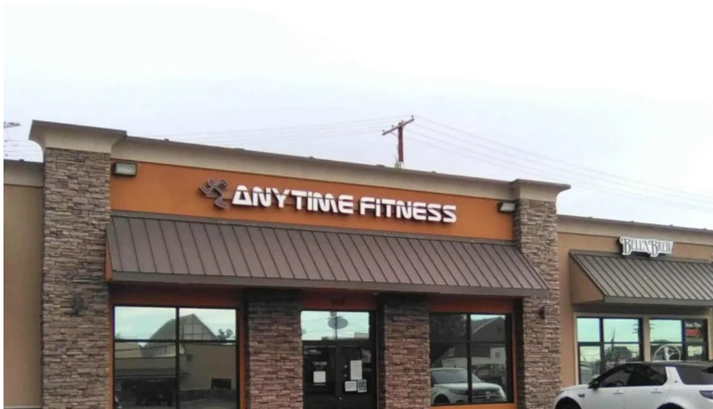
Anytime fitness phone