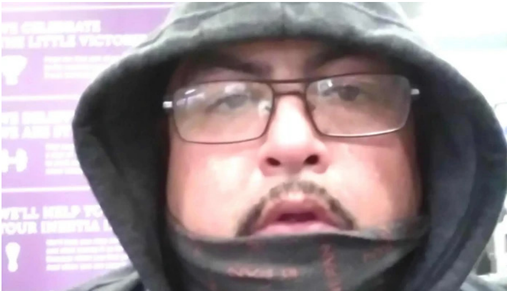
Anytime fitness discounts