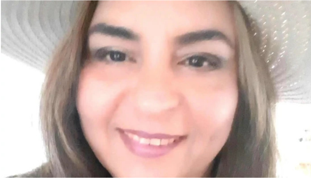
Anytime fitness wapato