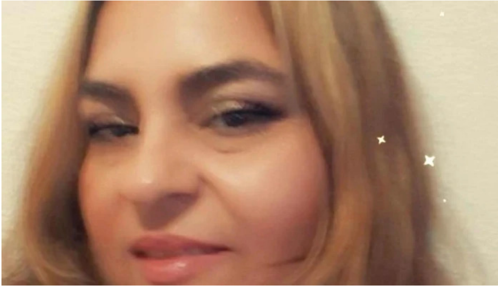
Anytime fitness gym