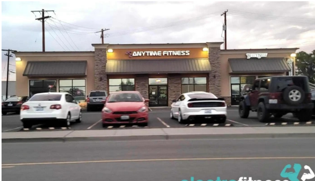
Anytime fitness all