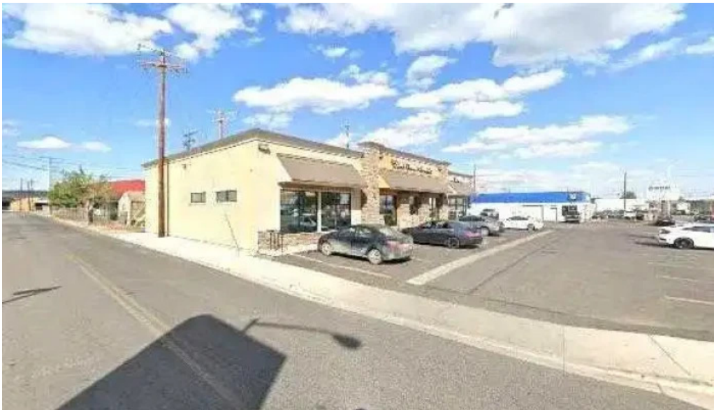
Anytime fitness street view 360deg