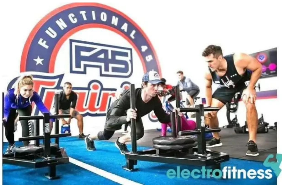
F45 training columbia heights washington