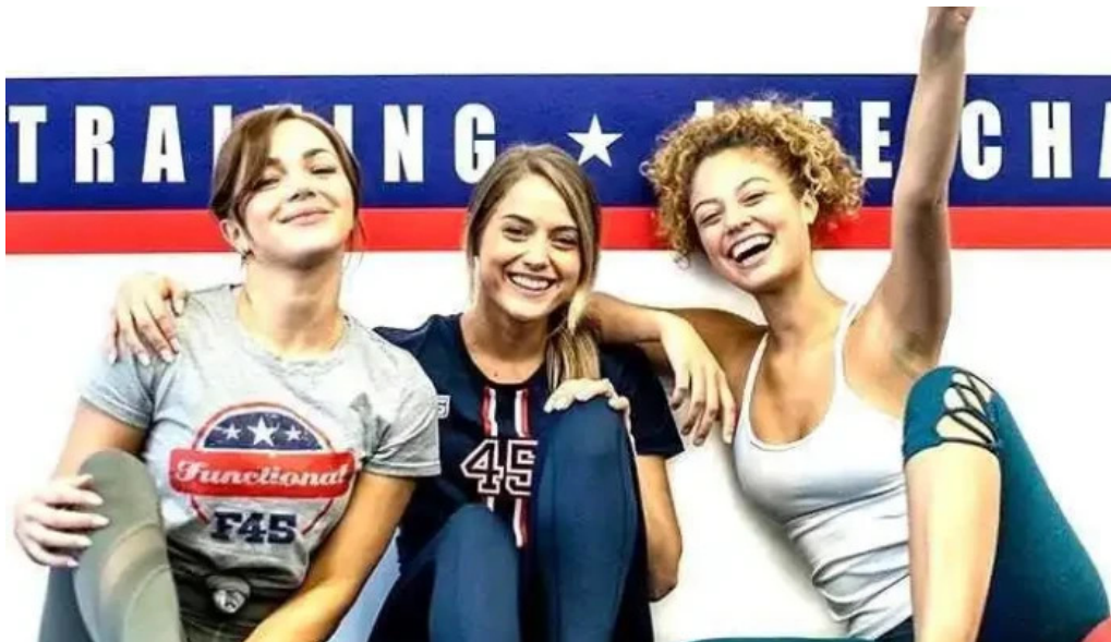
F45 training columbia heights by owner