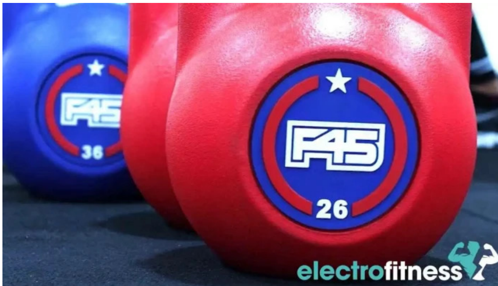
F45 training columbia heights videos