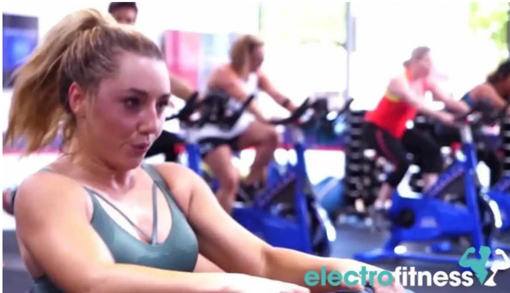
F45 training columbia heights gym