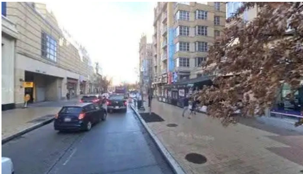
F45 training columbia heights street view 360deg