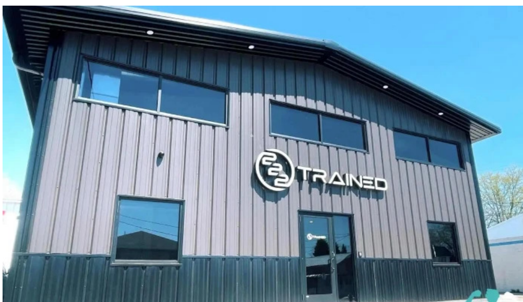
222 trained all