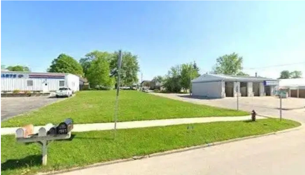
222 trained street view 360deg