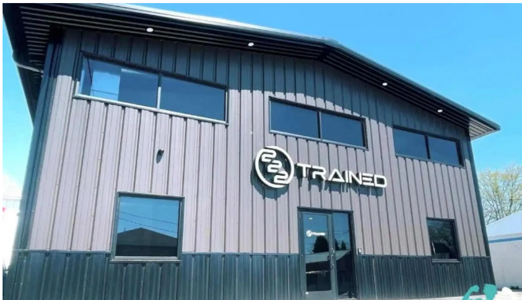
222 trained waukon