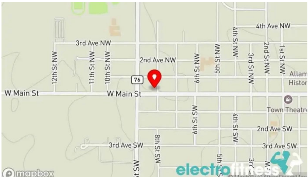
222 trained map