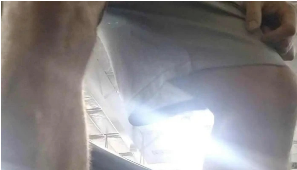
Anytime fitness videos