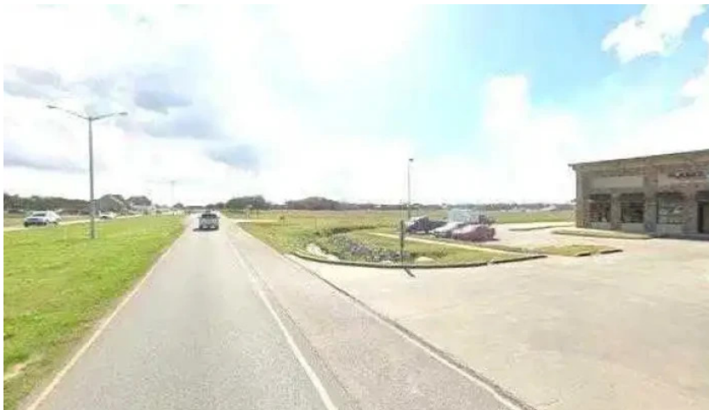
Anytime fitness latest