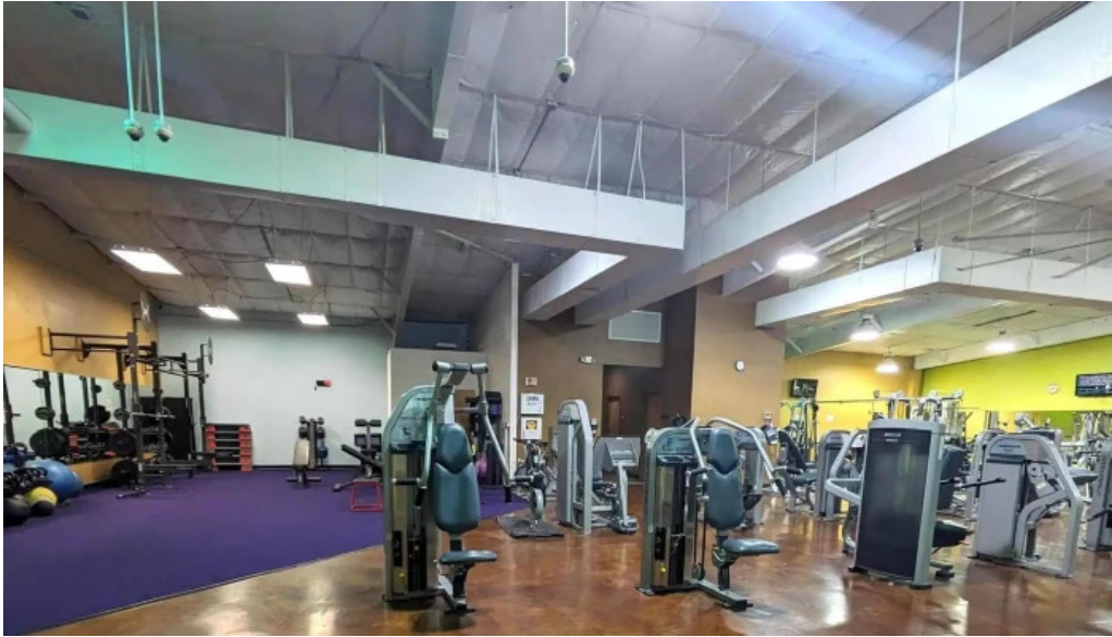
Anytime fitness gym