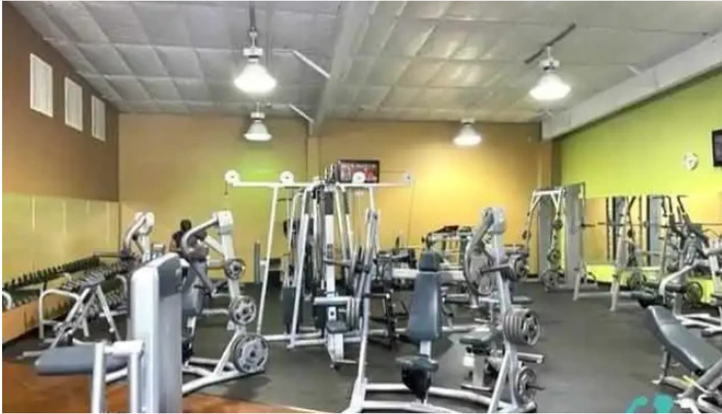
Anytime fitness youngsville