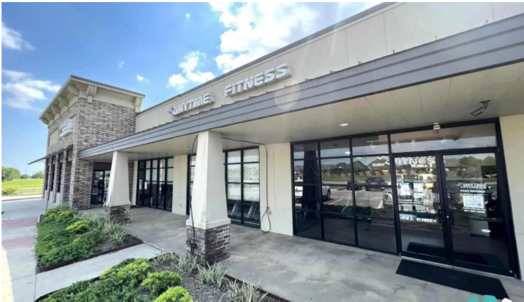
Anytime fitness by owner