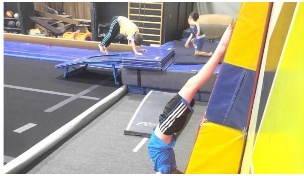
California strong athletics discounts