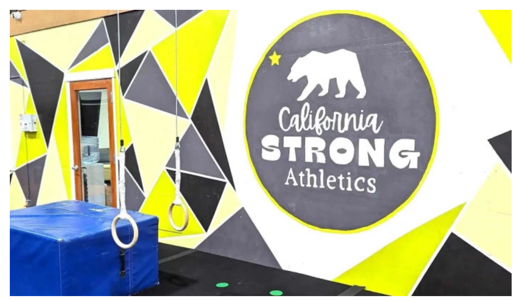
California strong athletics promotion