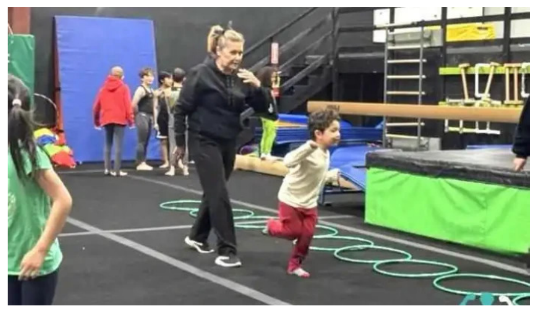
California strong athletics latest