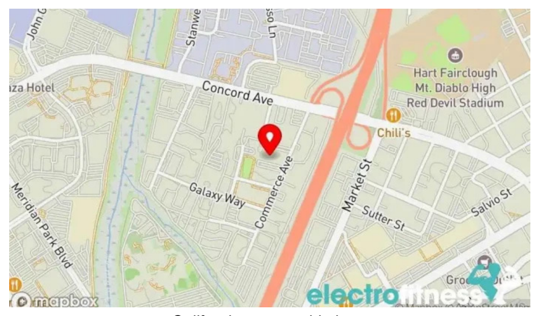
California strong athletics map