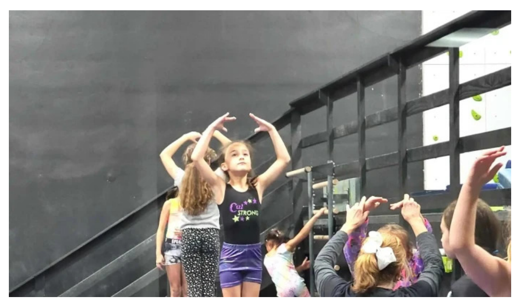
California strong athletics concord