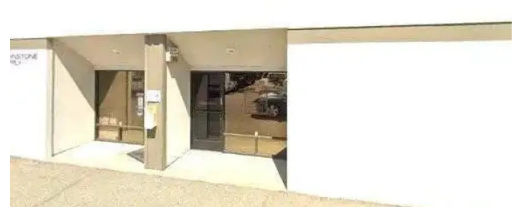
California strong athletics street view 360deg