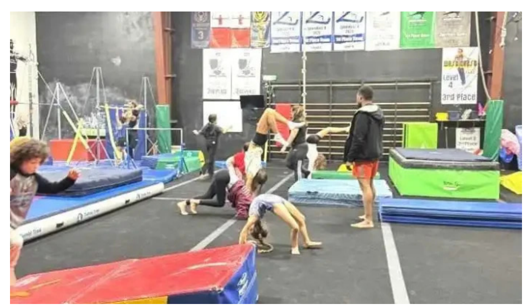
California strong athletics exercise