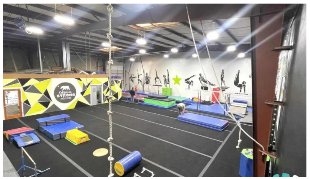
California strong athletics all