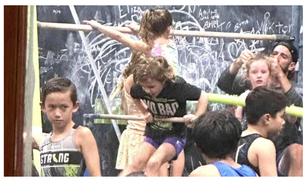
California strong athletics prices