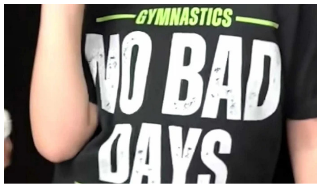
California strong athletics how to get there