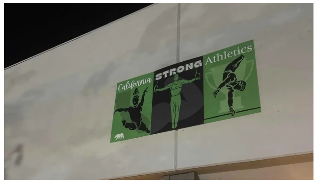
California strong athletics gymnastics center