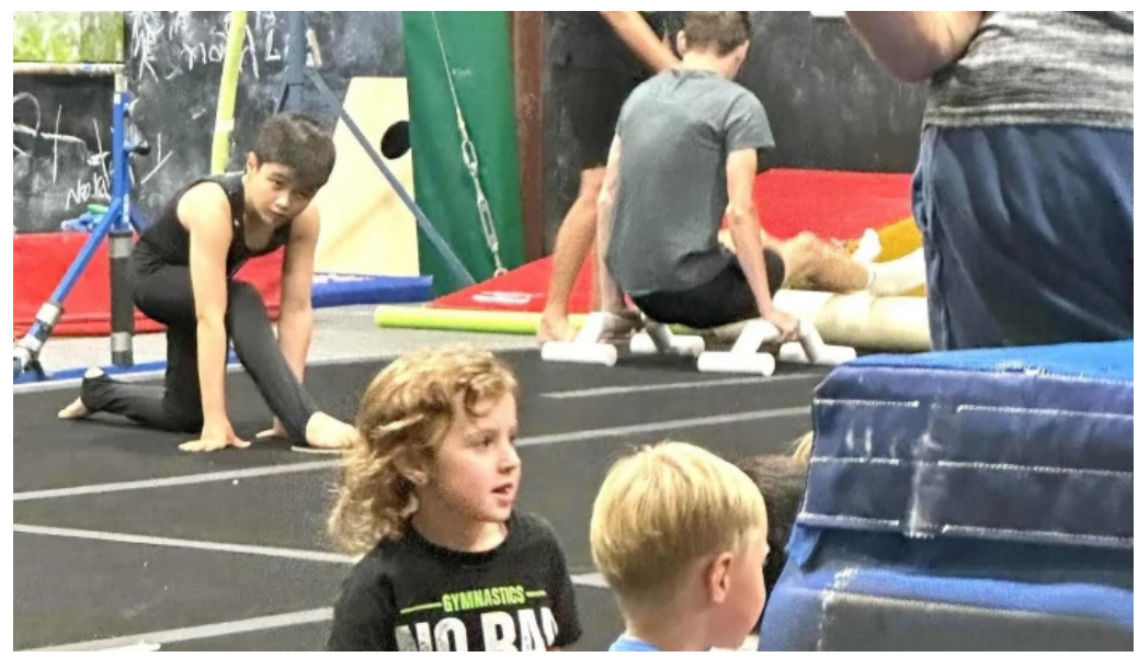
California strong athletics photos