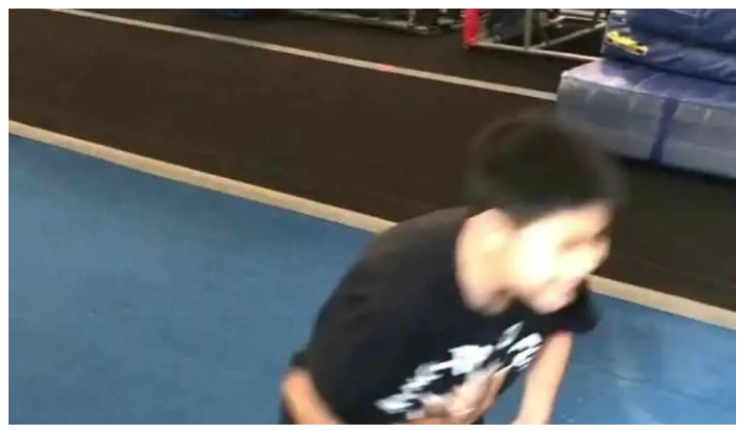
California strong athletics videos